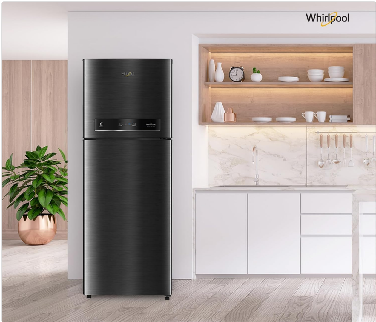
Figure 5.3: Dedicated vegetable storage with advanced freshness technologies.