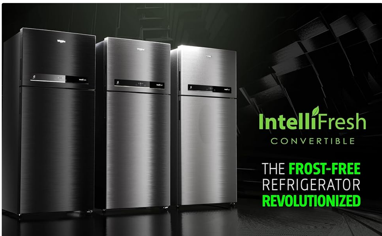
Figure 3.1: Overview of key features including Feather Touch UI, Flexible Inner Shelves, Convertible 5 in 1, and Adaptive Intelligence.