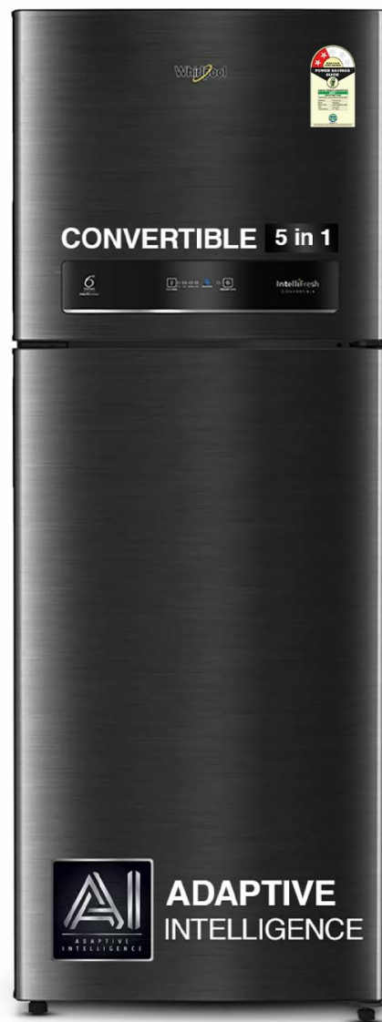
Figure 1.1: Front view of the Whirlpool 411L IntelliFresh Refrigerator.