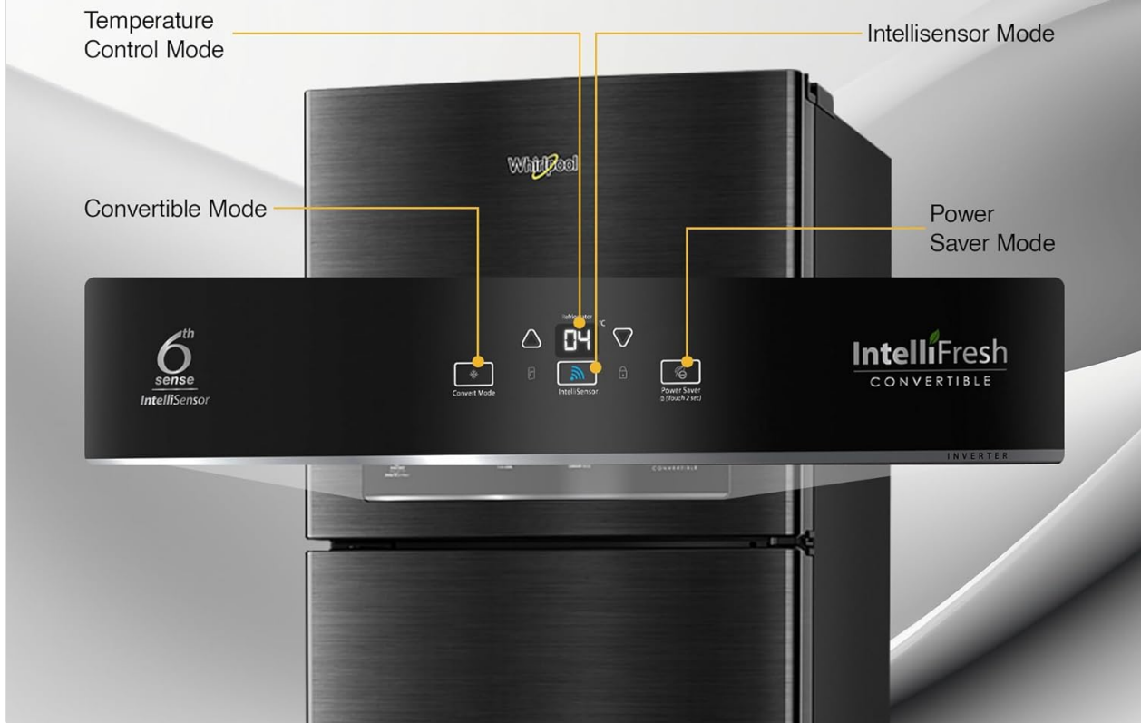
Figure 5.2: The five convertible modes offer flexible storage solutions.