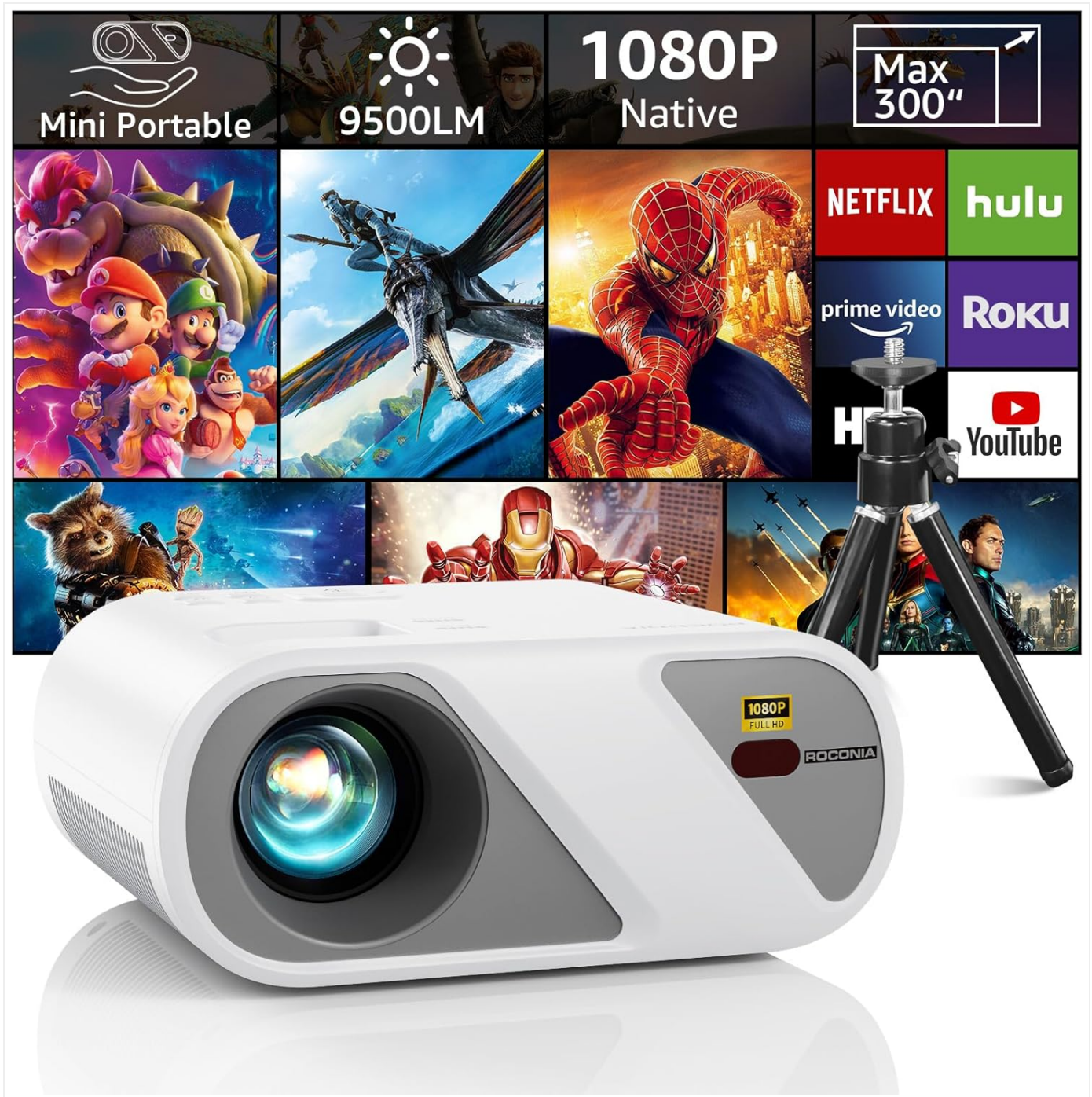
Image: Front view of the Roconia G3 projector, highlighting its compact design and compatibility with various streaming platforms.

The Roconia G3 projector is designed for versatile entertainment, offering a native 1080P resolution and high brightness for clear images. It features 5G WiFi for fast wireless connections and Bluetooth 5.0 for external audio devices.