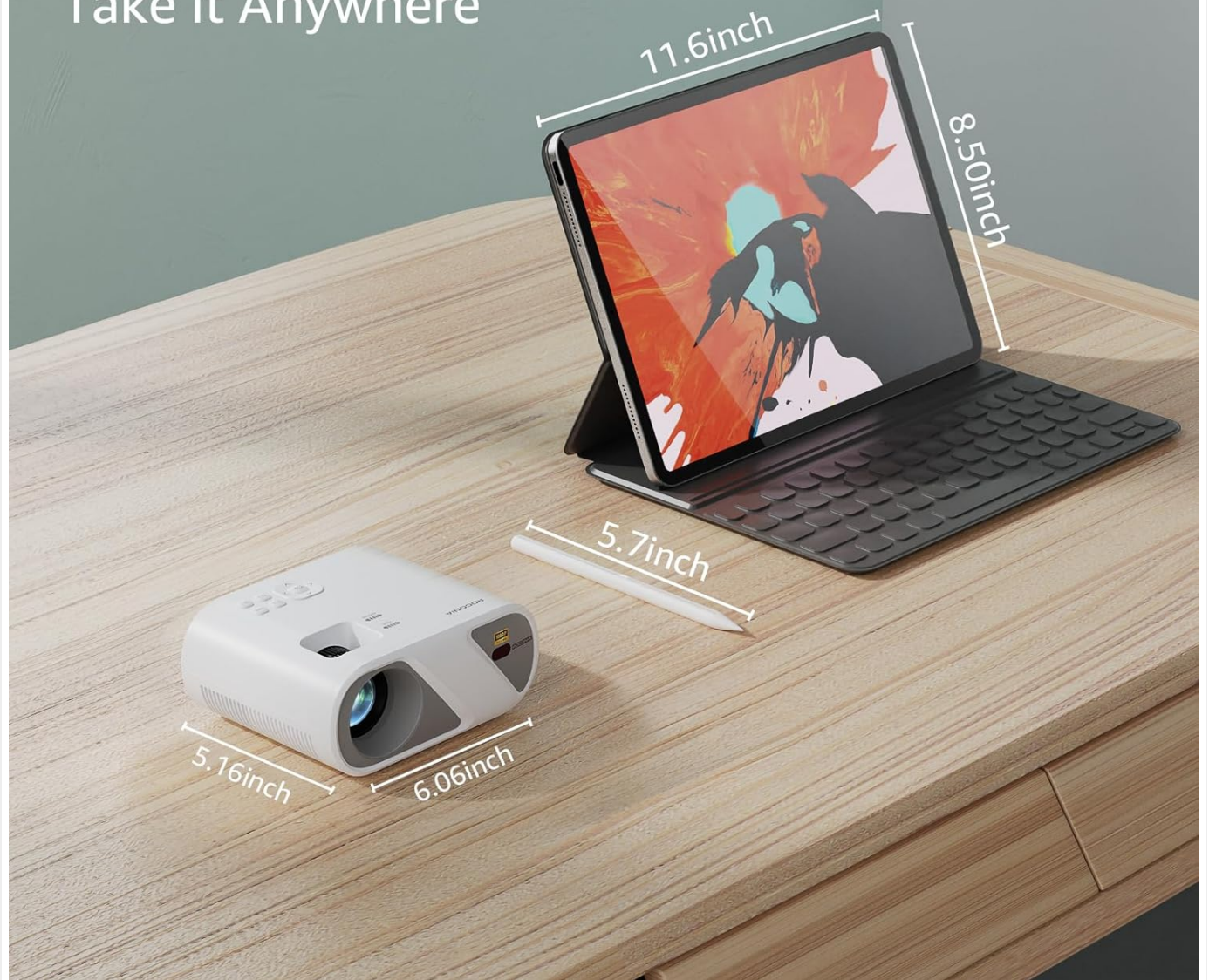
Image: The mini projector displayed next to a tablet, illustrating its small and portable size for easy carrying.