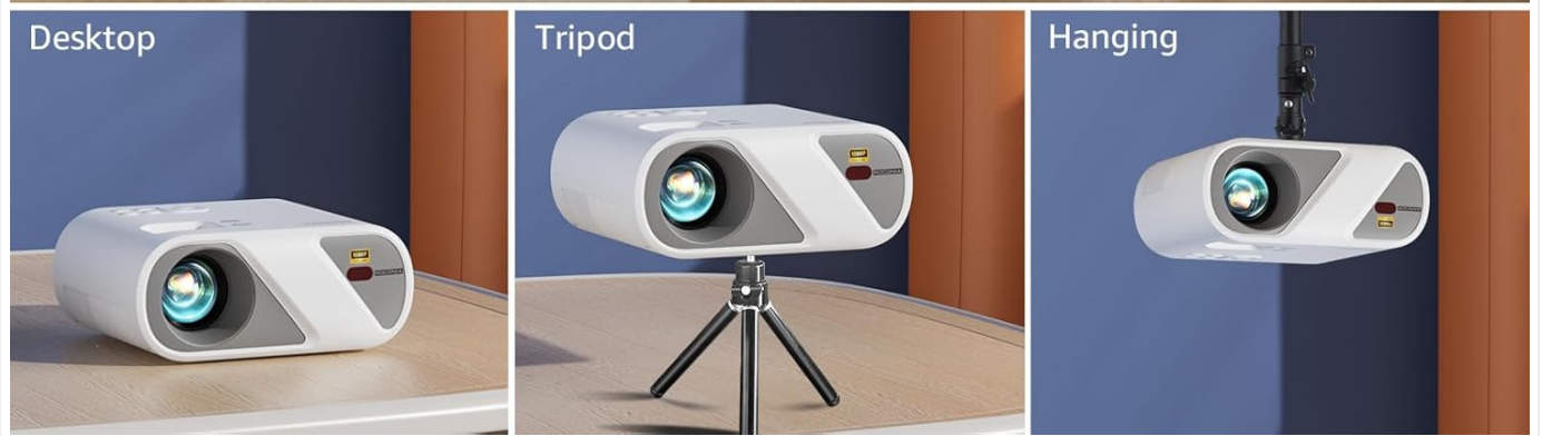
Image: Demonstrates the projector's versatility with desktop, tripod, and ceiling hanging setup options.