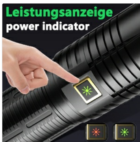
Figure 6: Charging Interface