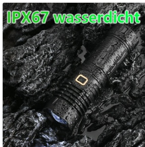
Figure 4: IPX67 Dustproof and Waterproof Design