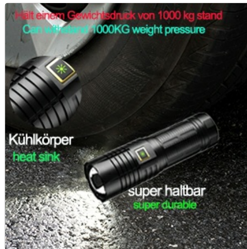
Figure 2: Five Dimming Modes