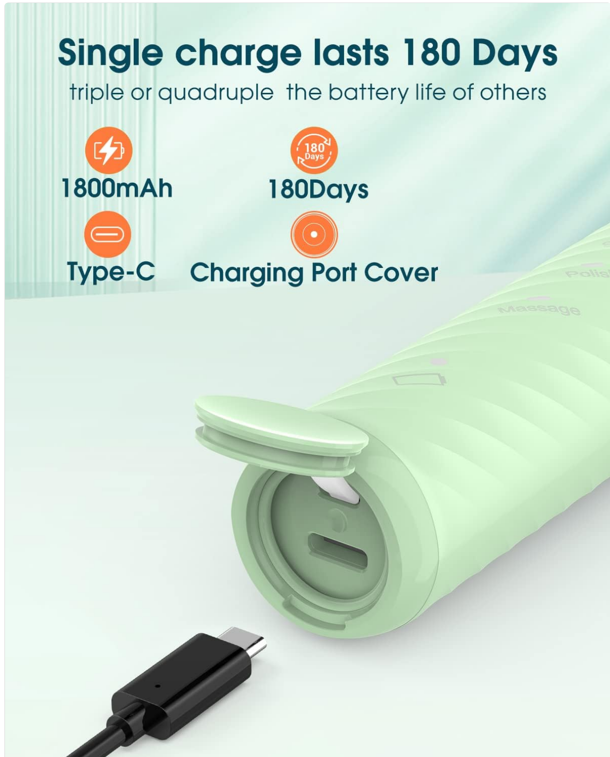
Image: Close-up of the YteaTh Shcall Y01 Sonic Electric Toothbrush's USB Type-C charging port with its protective cover open, showing a charging cable connected. Text indicates 1800mAh battery and 180 days of use.