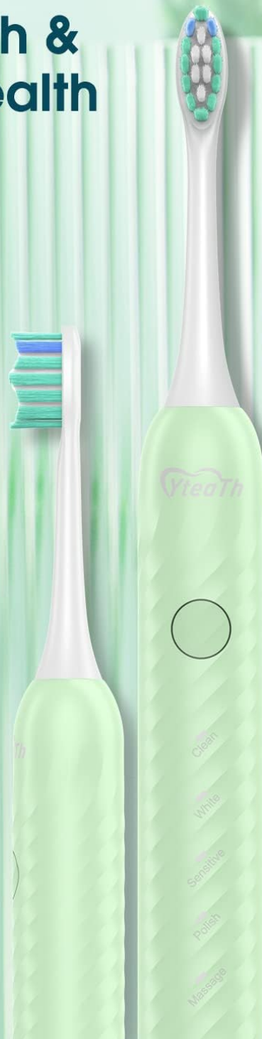
Image: The YteaTh Shcall Y01 Sonic Electric Toothbrush handle with a brush head attached, ready for use.