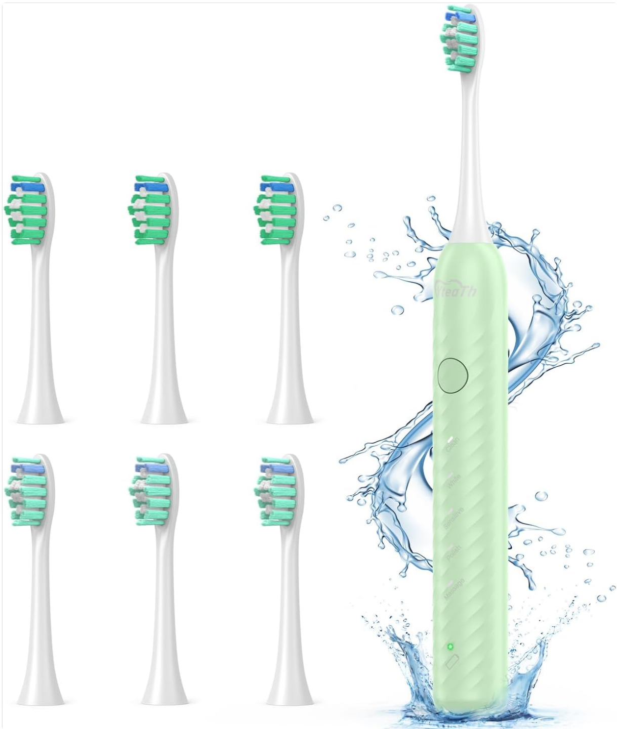
Image: The YteaTh Shcall Y01 Sonic Electric Toothbrush in light green, accompanied by six replacement brush heads. The toothbrush handle is shown with water splashing around it, highlighting its waterproof design.