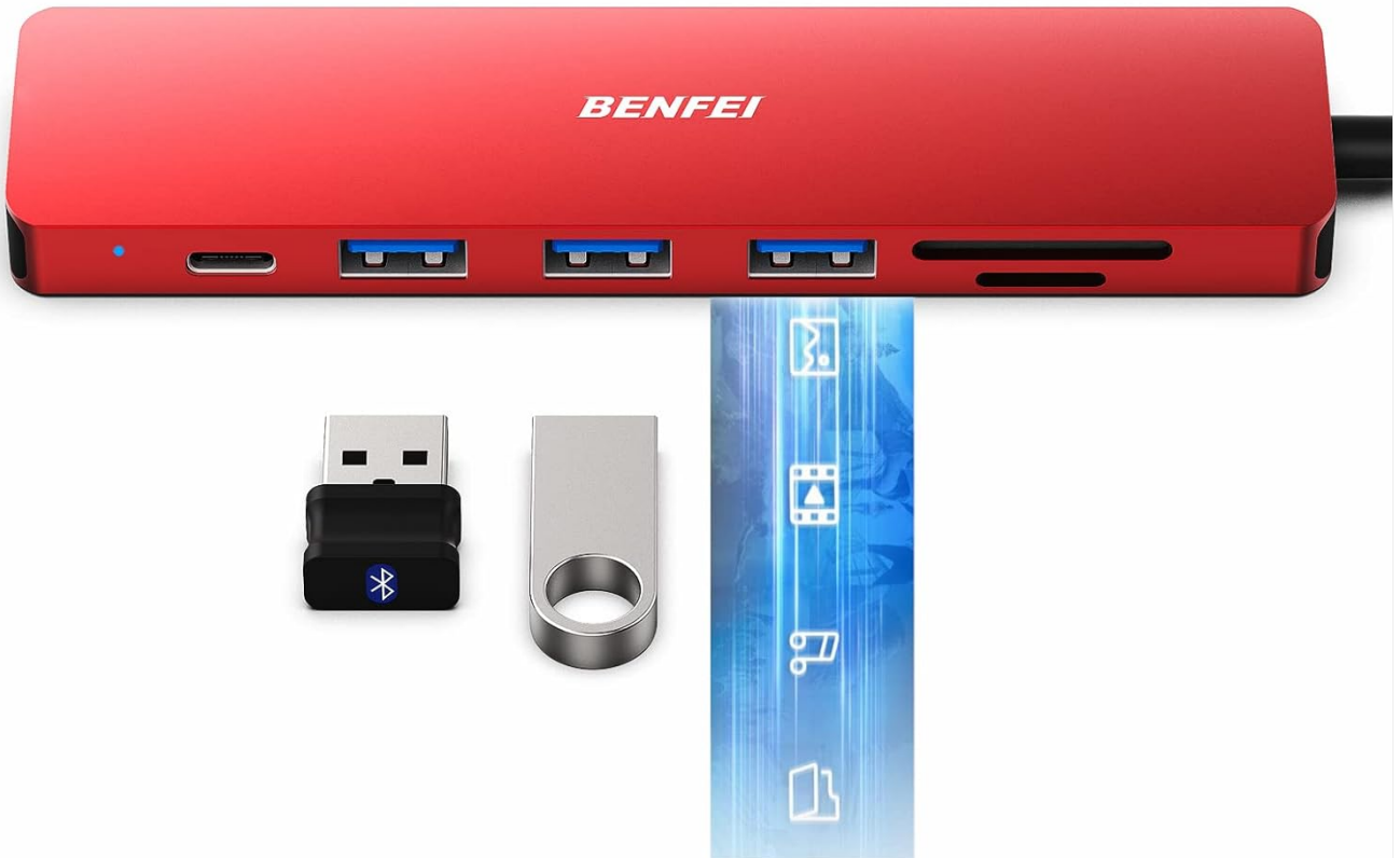
Detail of the BENFEI USB-C Hub's USB 3.0 ports, highlighting their capability for fast data transfer at 5Gbps, significantly faster than USB 2.0.