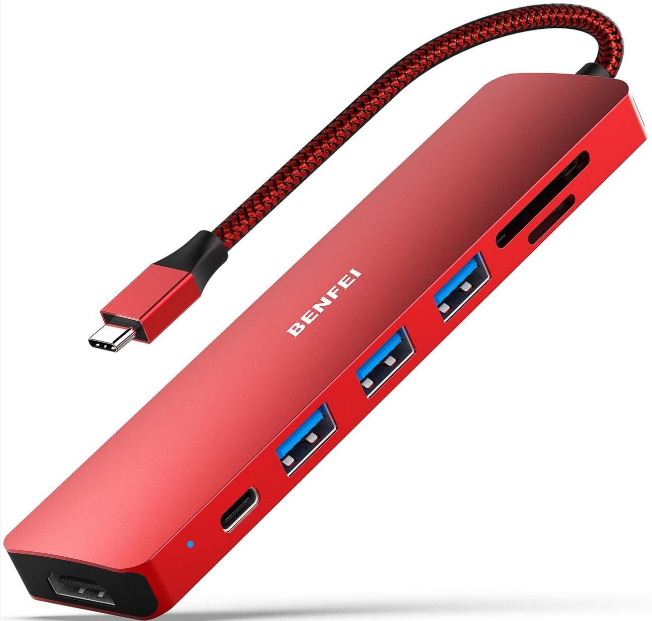
A view of the BENFEI 7-in-1 USB-C Hub, emphasizing its compact design and the range of ports it offers for expanded connectivity.