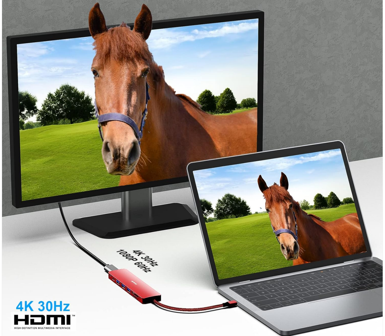
Illustration of the BENFEI USB-C Hub providing crystal-clear 4K video output to an external monitor from a laptop.