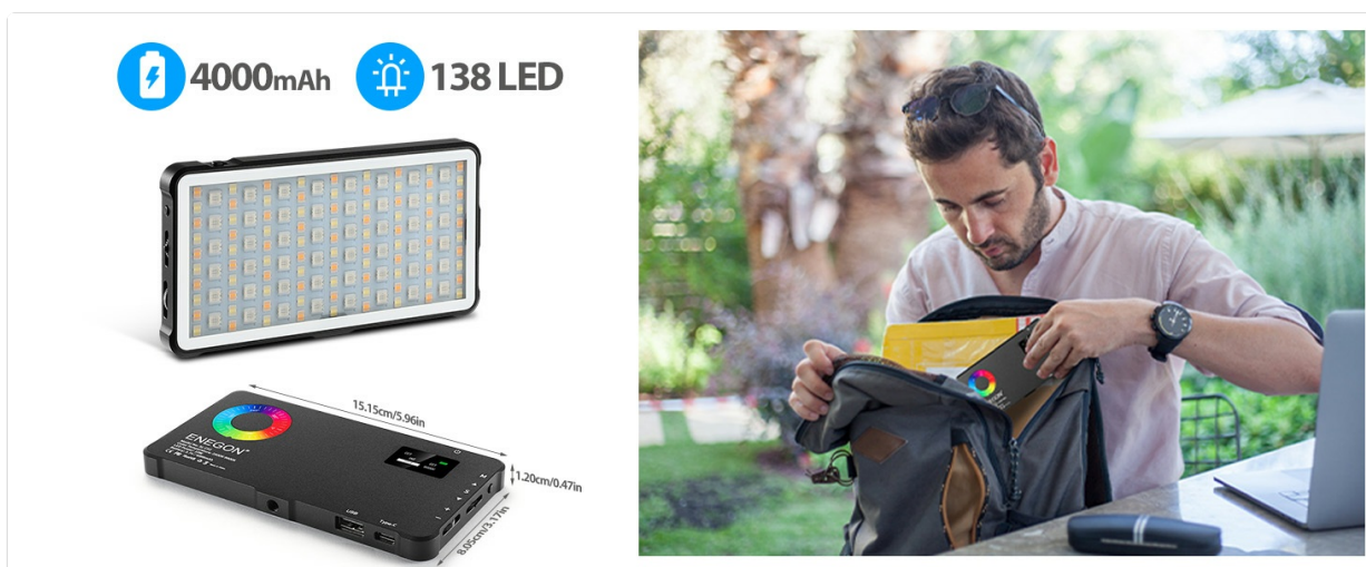
Image: Contents of the ENEGON RGB Video Light package.