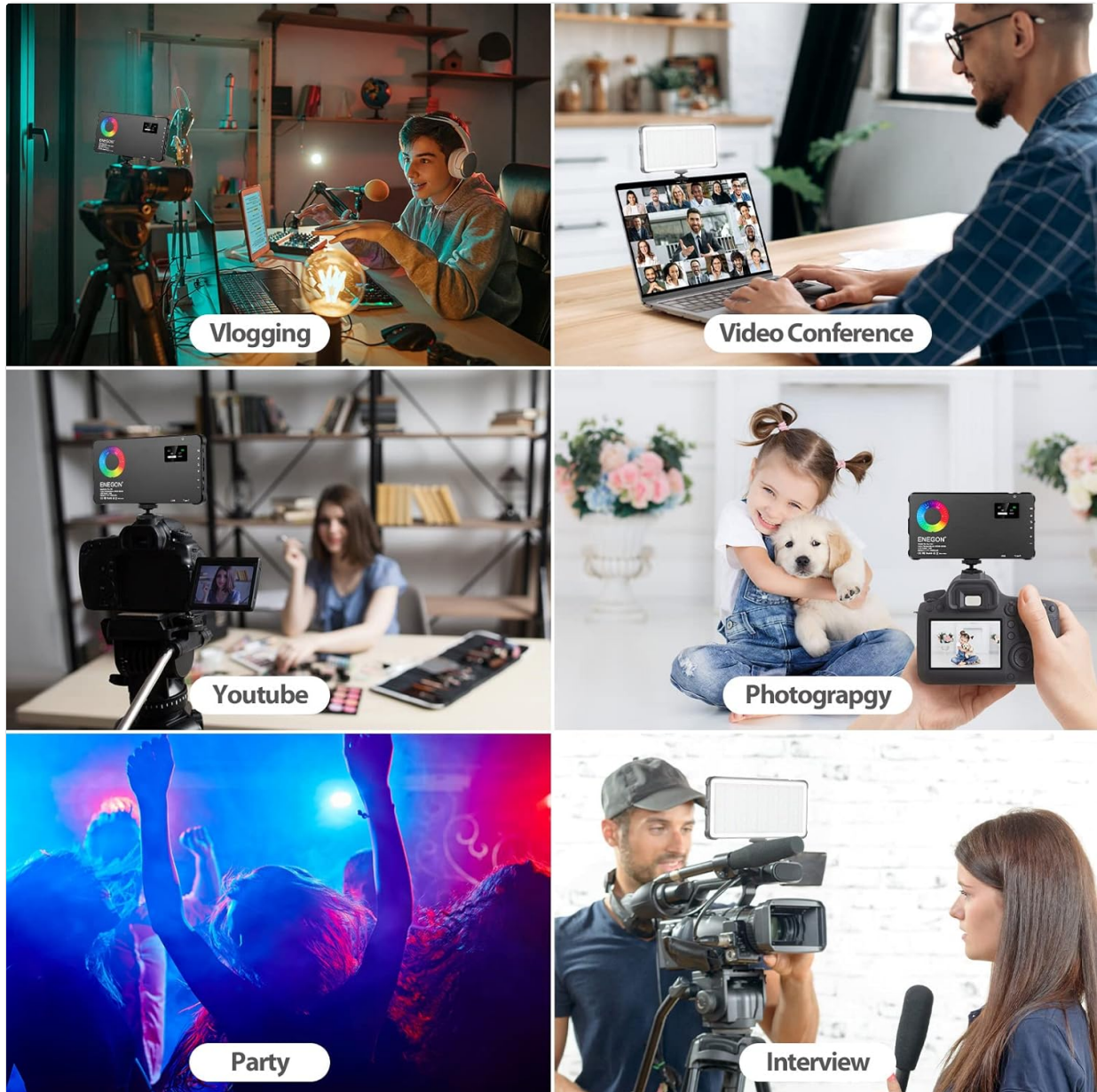
Image: Examples of mounting the ENEGON RGB Video Light on various devices.