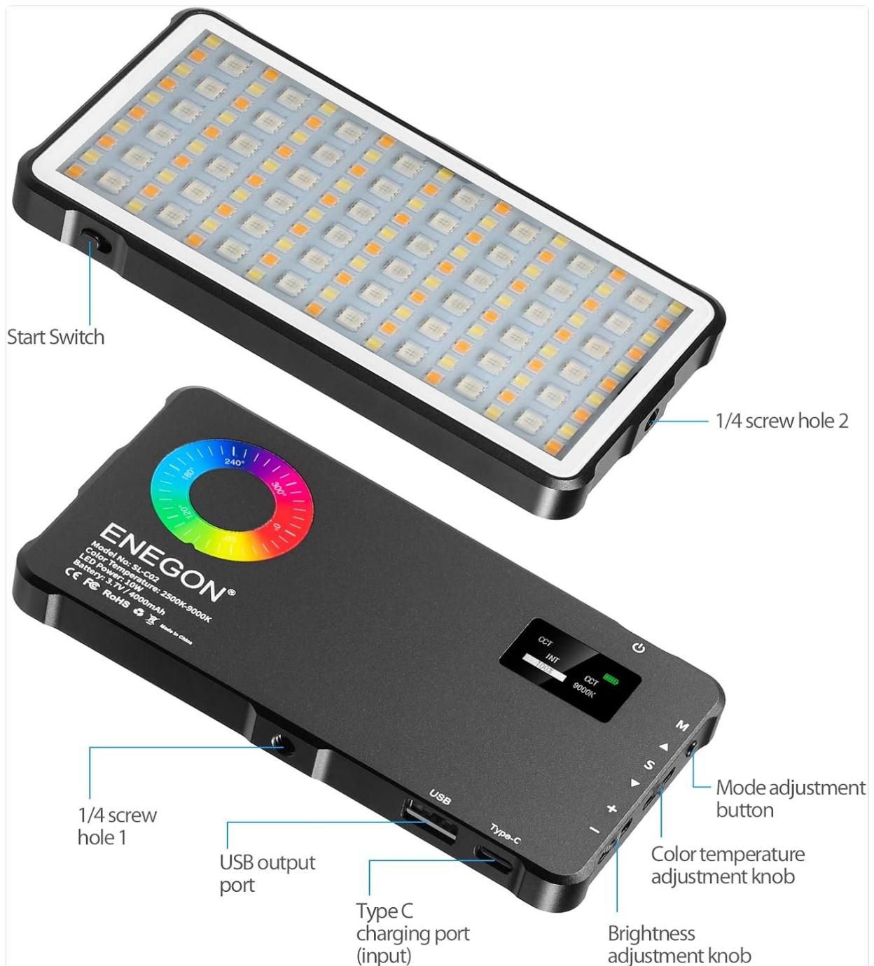
Image: Front and back view of the ENEGON RGB Video Light, highlighting controls and ports.