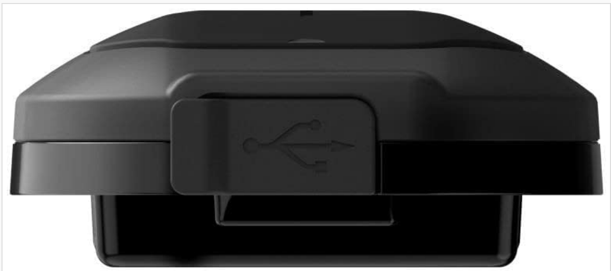
Figure 4: Top/bottom view of the SF2 main unit, showing the USB port with its protective cover closed.

A protective cover ensures the charging port remains secure when not in use.