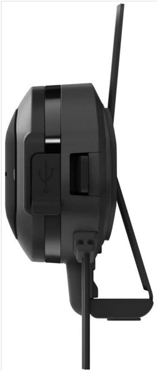
Figure 3: Side view of the SF2 main unit, displaying the USB charging port for power input.

A protective cover ensures the charging port remains secure when not in use.