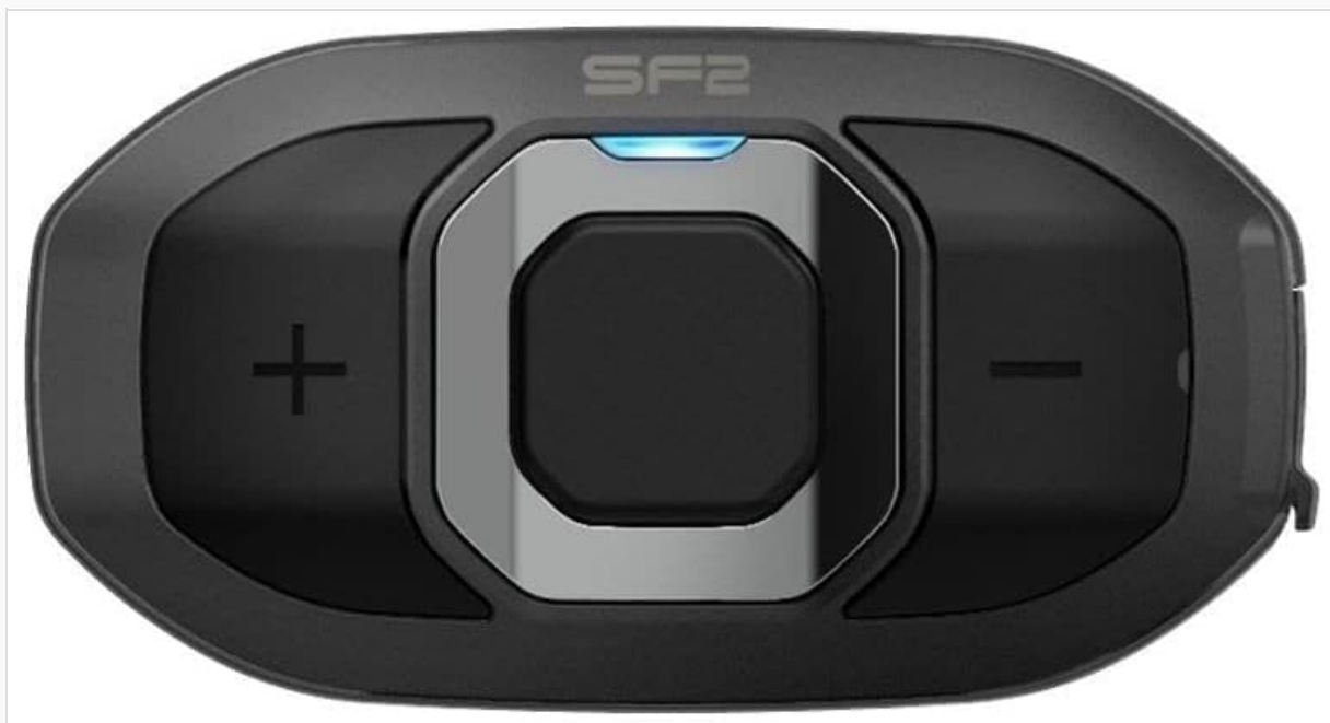
Figure 2: Front view of the SF2 main unit, highlighting the central control button and the '+' and '-' buttons for volume adjustment and navigation.

The main unit features intuitive controls for easy operation while riding.