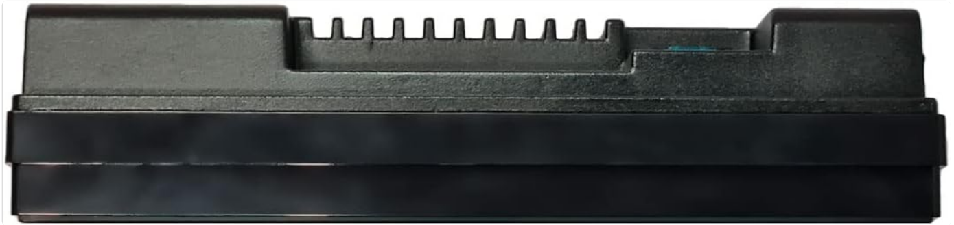
Image: Side profile of the multimedia unit, showing its slim design and mounting points.

The RS-815BR is designed for dashboard mounting. Ensure adequate space and secure fastening to prevent vibration and damage. Refer to your vehicle's specific dashboard configuration for best mounting practices.