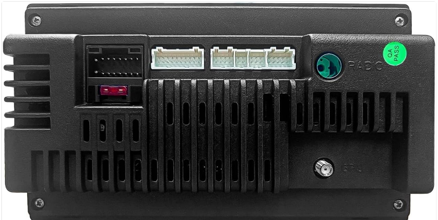
Image: Rear view of the multimedia system, displaying various input and output ports for power, audio, video, USB, and antennas.