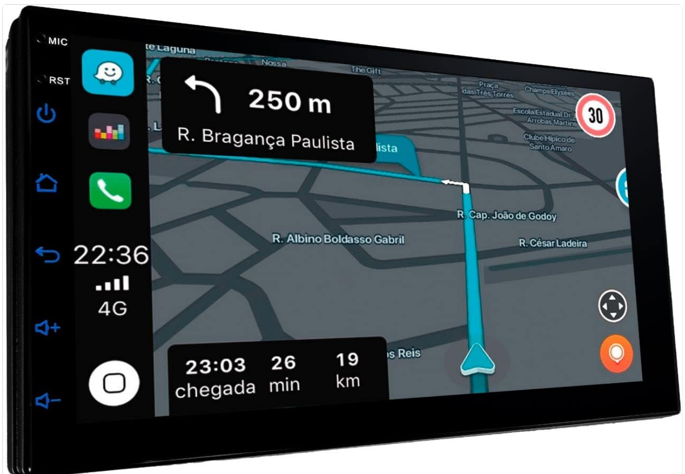
Image: Front view of the Roadstar RS-815BR multimedia system, showing the 7-inch display with a navigation map and side control

The Roadstar RS-815BR is an advanced 7-inch Android multimedia system designed for automotive use. It features a full touch IPS capacitive screen, offering an intuitive and user-friendly interface. This system integrates modern connectivity options such as Bluetooth, Wi-Fi, and GPS, along with support for Apple CarPlay and Android Auto, enhancing your in-car entertainment and navigation experience. This manual provides essential information for the proper installation, operation, and maintenance of your RS-815BR unit.