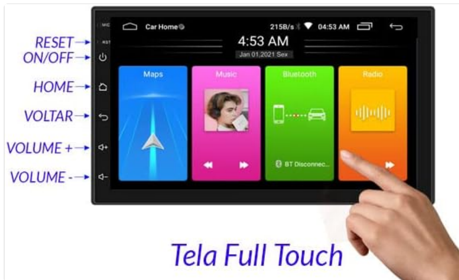
Image: Front view of the multimedia system with labels pointing to the functions of the side buttons: Reset, On/Off, Home, Back, Volume +, and Volume -.