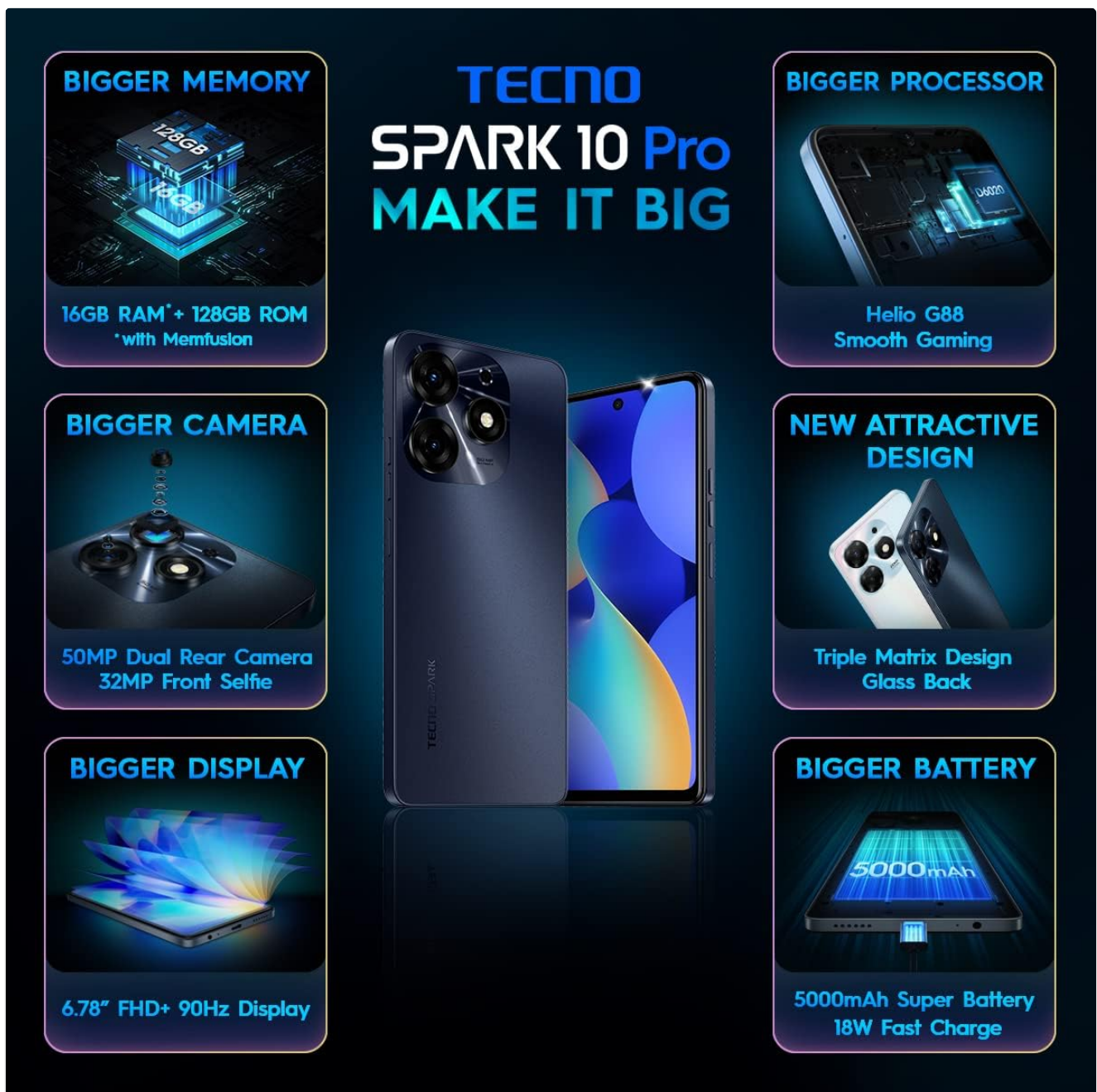
Image 4.1: Front view of the Tecno Spark 10 Pro, showcasing its large 6.8-inch display with a punch-hole front camera.