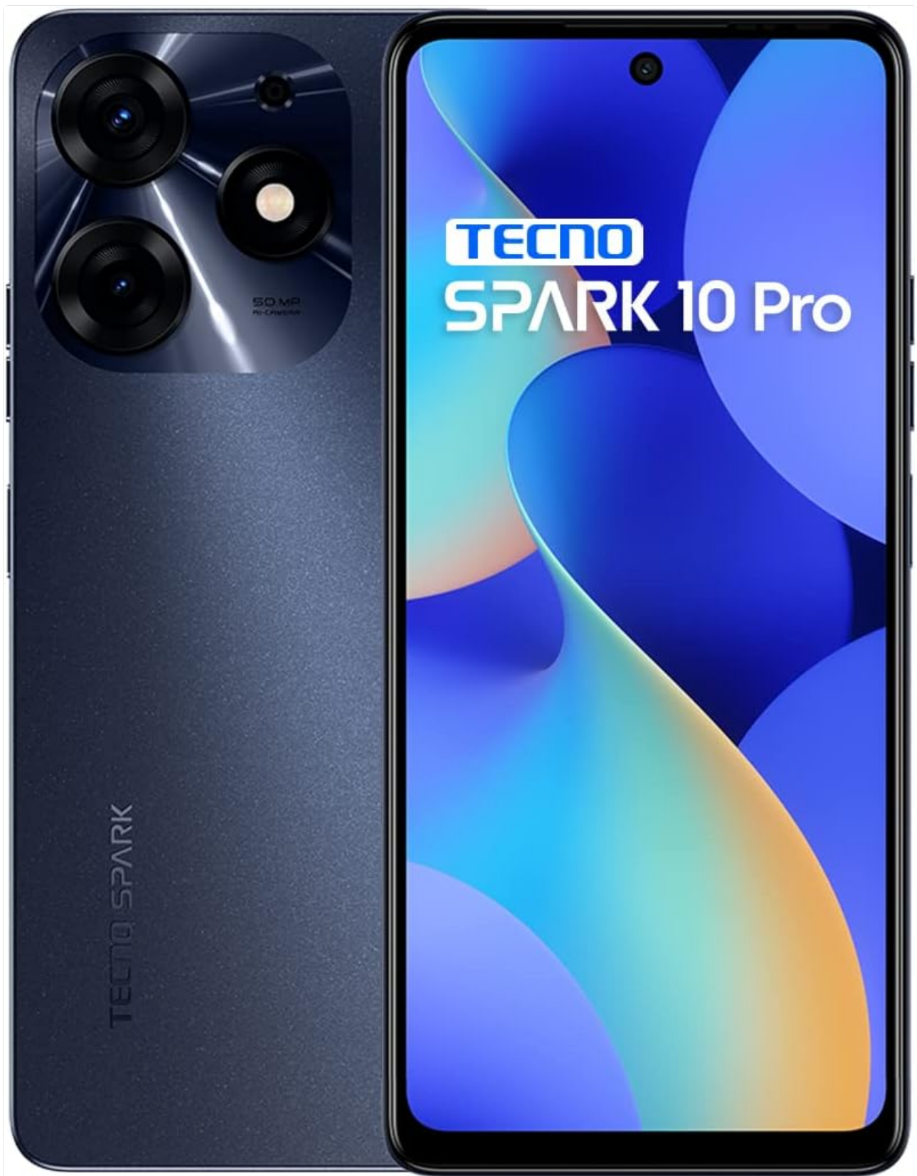
Image 1.1: Front and back view of the Tecno Spark 10 Pro Smartphone. The device features a large display on the front and a camera module with three lenses and a flash on the back.