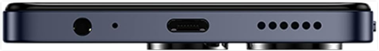
Image 3.2: Bottom view of the Tecno Spark 10 Pro, showing the USB-C charging port, 3.5mm audio jack, and speaker grille.