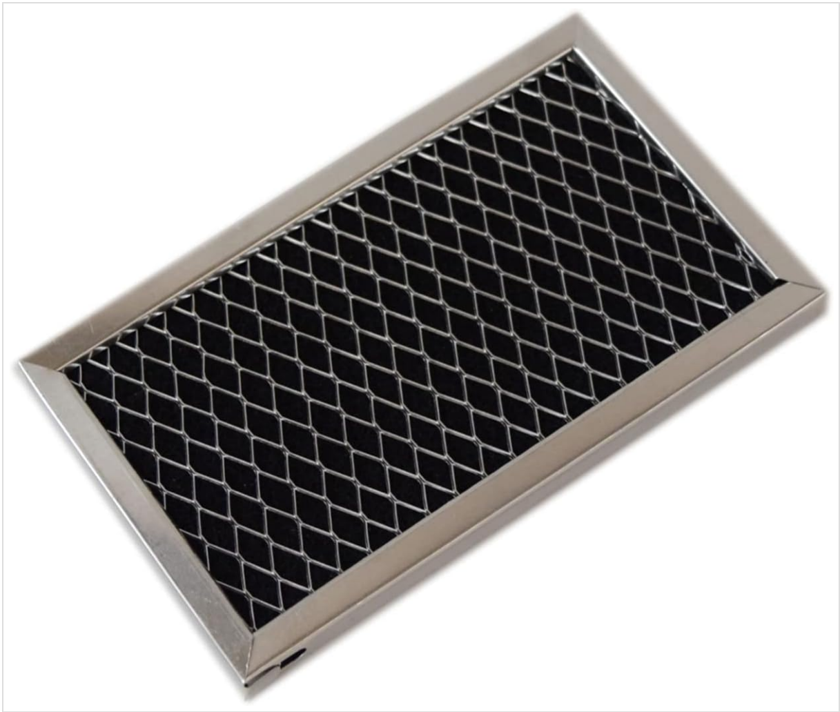
Image 1: The Kircuit Replacement Charcoal Filter. This image displays the rectangular filter with a metallic frame and a mesh-covered charcoal media inside, designed for odor absorption in microwave ovens.