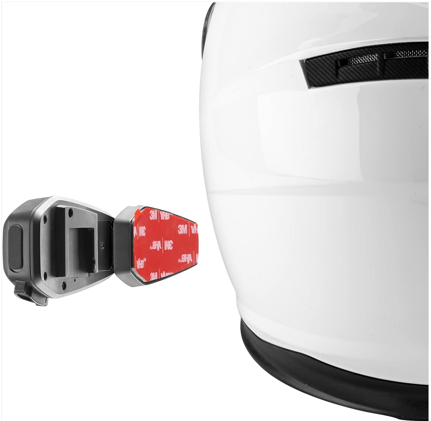
Image: The adhesive mounting bracket for the Interphone U-Com 7R, showing the 3M VHB adhesive tape for secure attachment to the helmet shell.