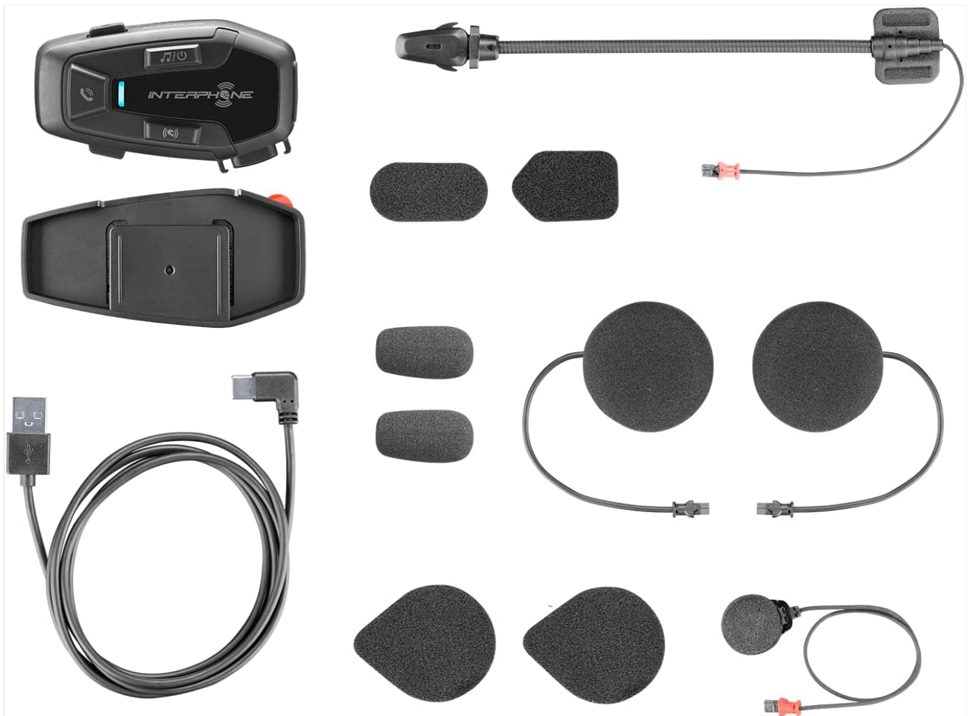
Image: All components included in the Interphone U-Com 7R package. This includes the main intercom unit, various mounting options (adhesive and clamp), speakers, microphones (boom and wired), USB-C charging cable, and foam covers for microphones and speakers.