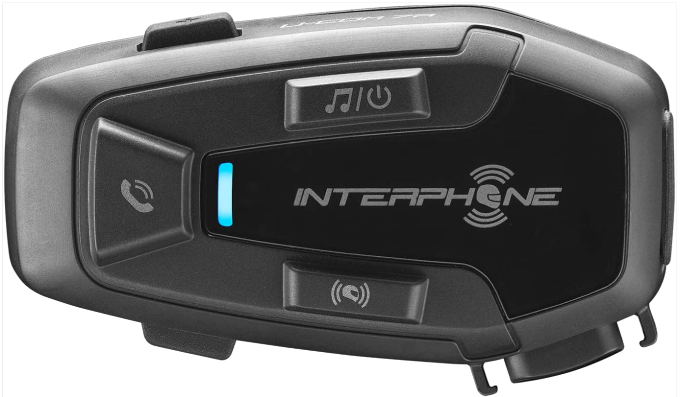
Image: Top view of the Interphone U-Com 7R unit, showing the main control buttons for music, phone calls, and intercom functions, along with the LED indicator.