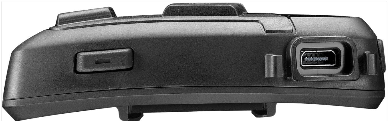
Image: Side view of the Interphone U-Com 7R unit, highlighting the USB-C charging port and a small button, likely for reset or additional function.