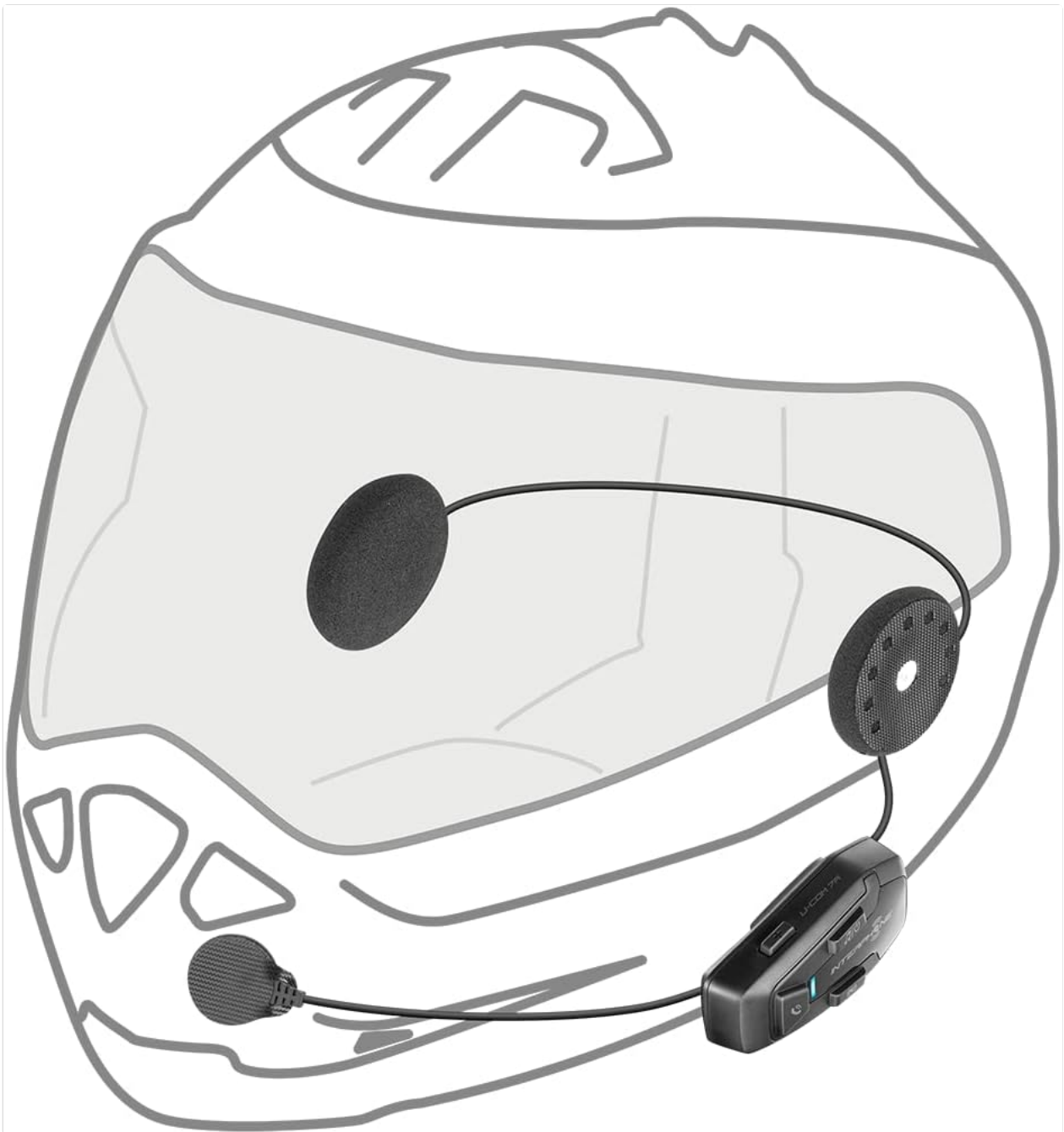
Image: The Interphone UCOM7 mounted on a helmet.