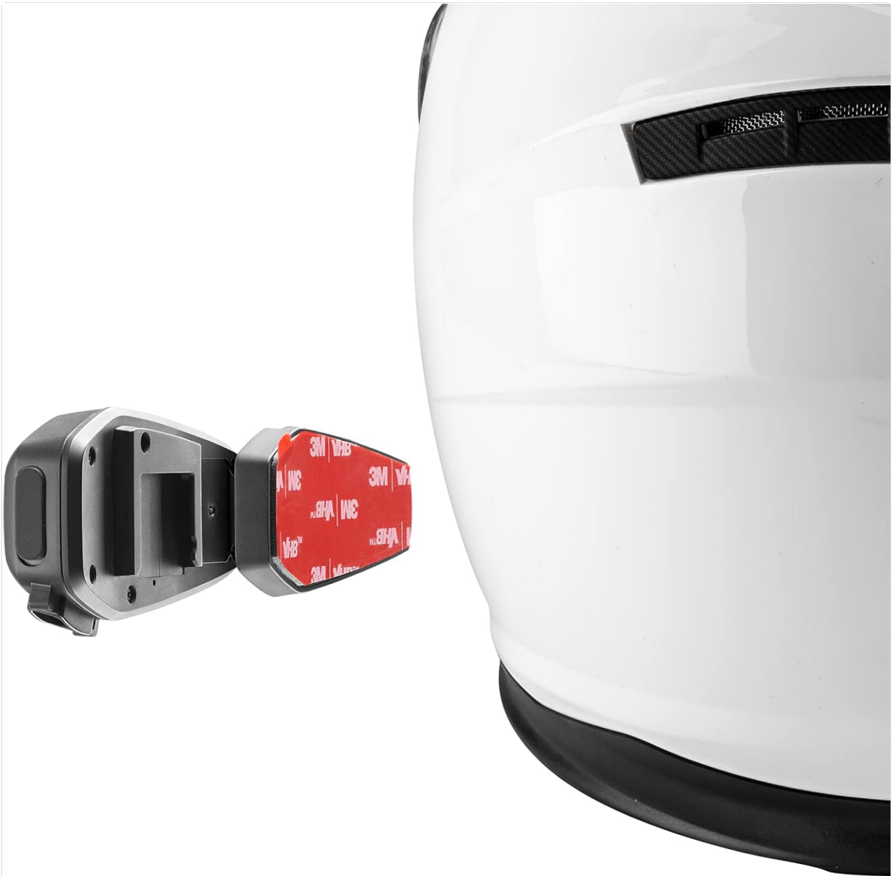
Image: The adhesive mounting bracket for the Interphone UCOM7.