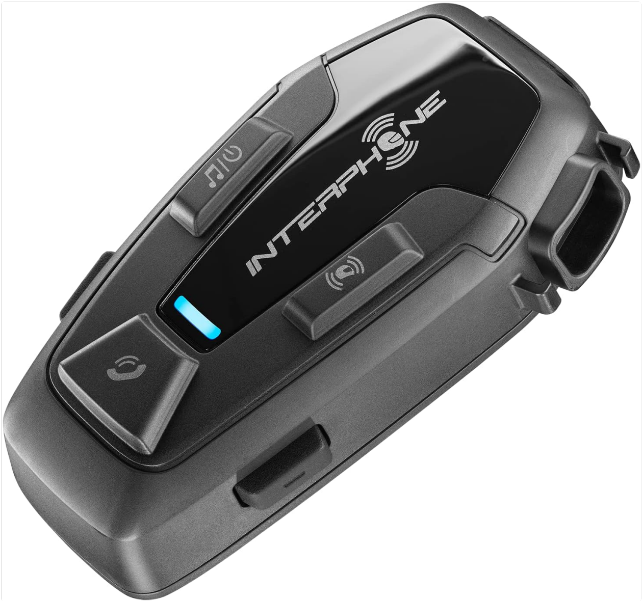
Image: Interphone UCOM7 unit with connected speakers and boom microphone.