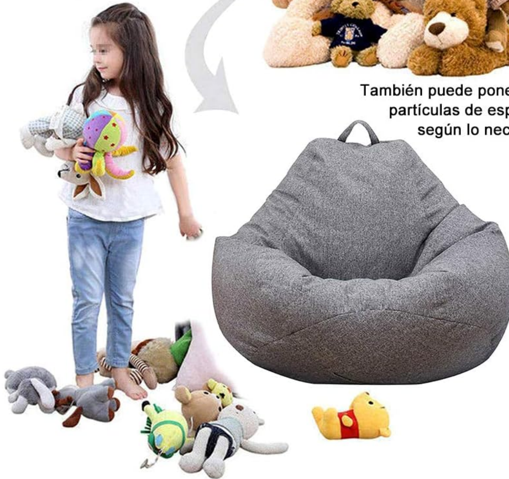
Image 4.2: The bean bag cover can also serve as a storage solution for items like stuffed animals.

También puede poner las partículas de espuma según lo necesite