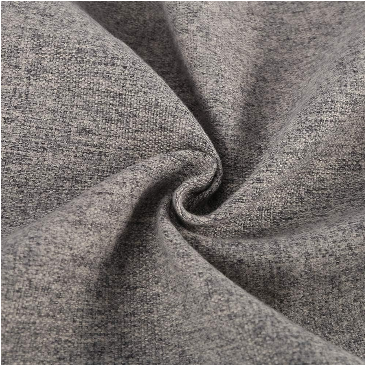
Image 5.1: The soft and durable fabric of the bean bag cover is designed for easy maintenance.