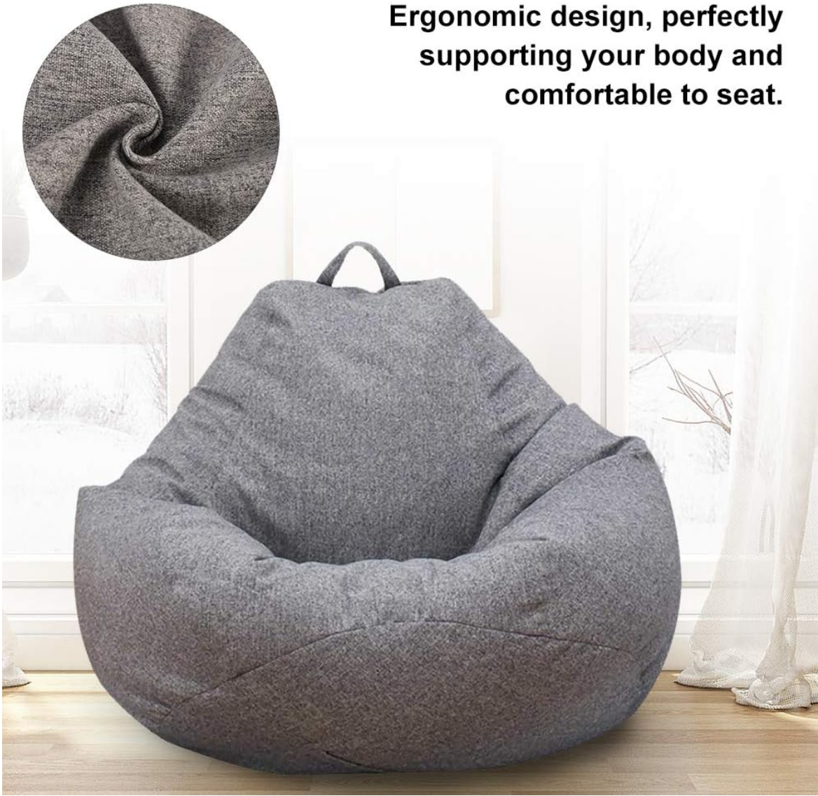
Image 4.1: The bean bag cover, once filled, provides ergonomic support for comfortable seating.

Ergonomic design, perfectly supporting your body and comfortable to seat.