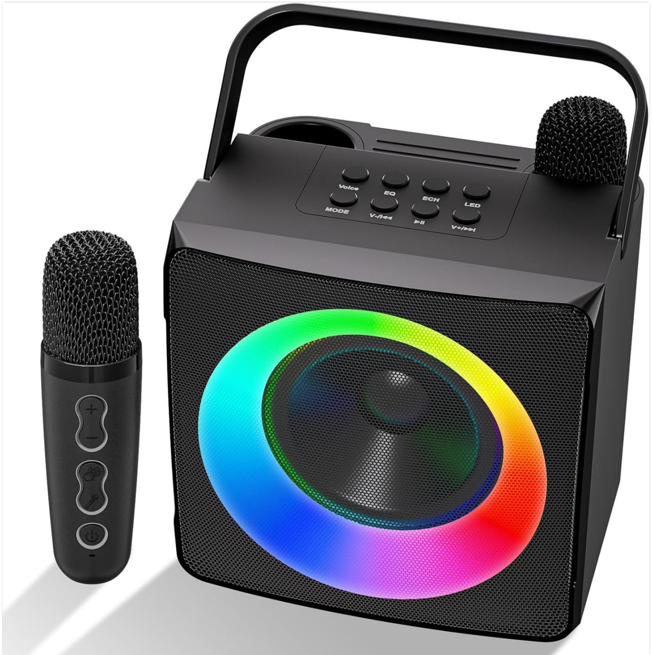
Figure 2: Front view of the karaoke machine with microphones.

The Verkstar Karaoke Machine is a compact and portable audio system designed for entertainment. It features a main speaker unit and two wireless microphones. The main unit includes a speaker with dynamic LED lights, a control panel, and integrated storage slots for the microphones.