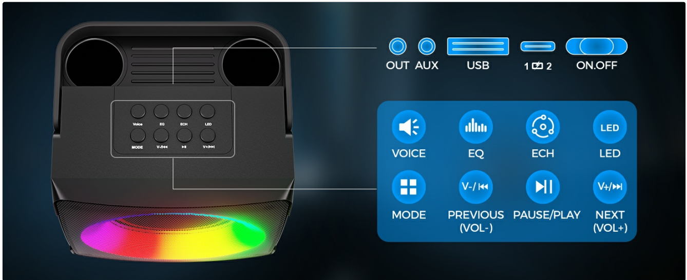
Figure 5: Control Panel Layout.

The control panel on the top of the main unit allows for various adjustments and functions. Familiarize yourself with the buttons: