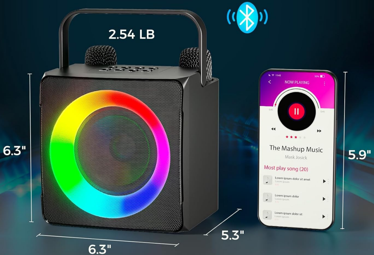
Figure 3: Compact design and dimensions of the unit.