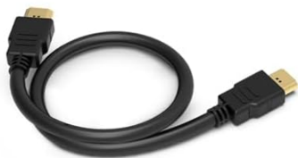
HDMI Cable X1