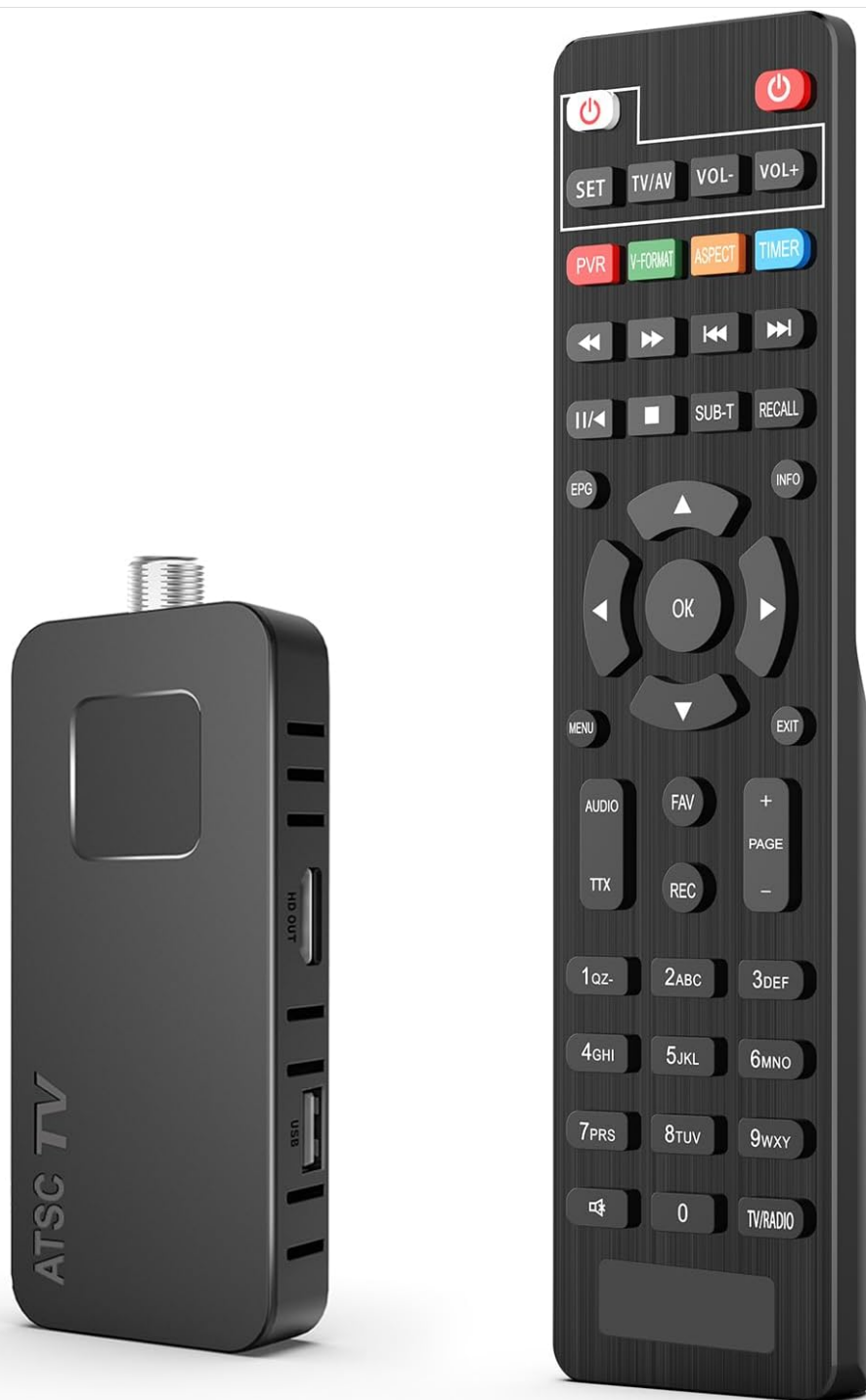
Figure 3: DCOLOR Digital Converter Box and its accompanying 2-in-1 Learning Remote Control.