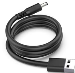
USB to DC Cable x1