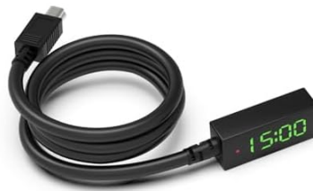
IR Receiver x1