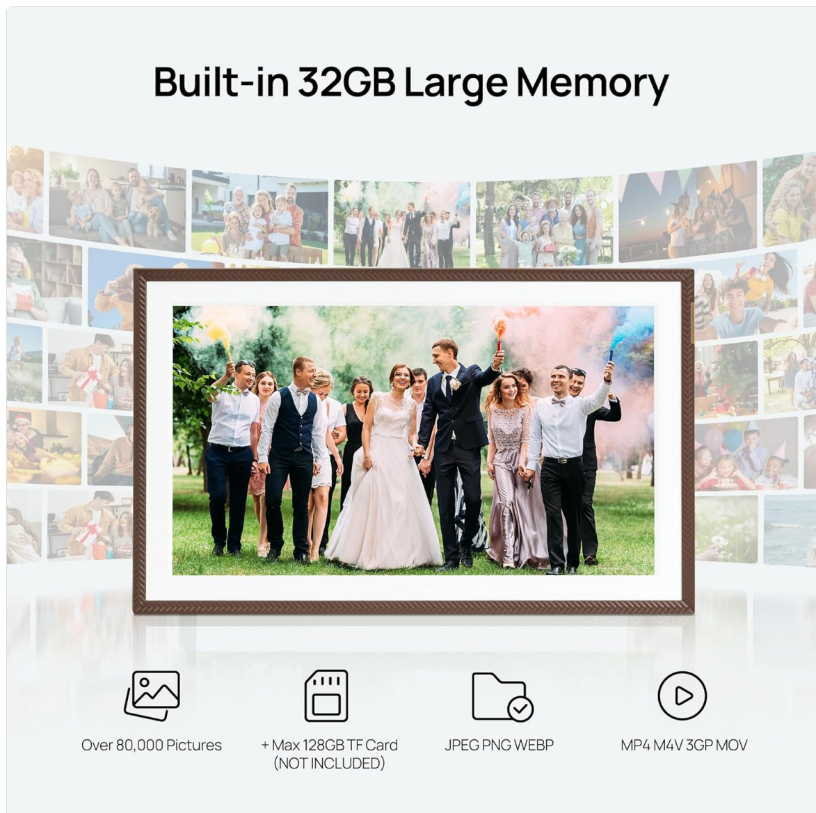
Image: The Arzopa Digital Picture Frame showcasing its 32GB built-in memory and the option for 128GB expandable storage via TF card.