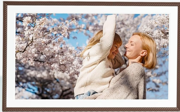
Image: The Arzopa Digital Picture Frame demonstrating its flexible placement options, including auto-rotation between portrait and landscape modes.