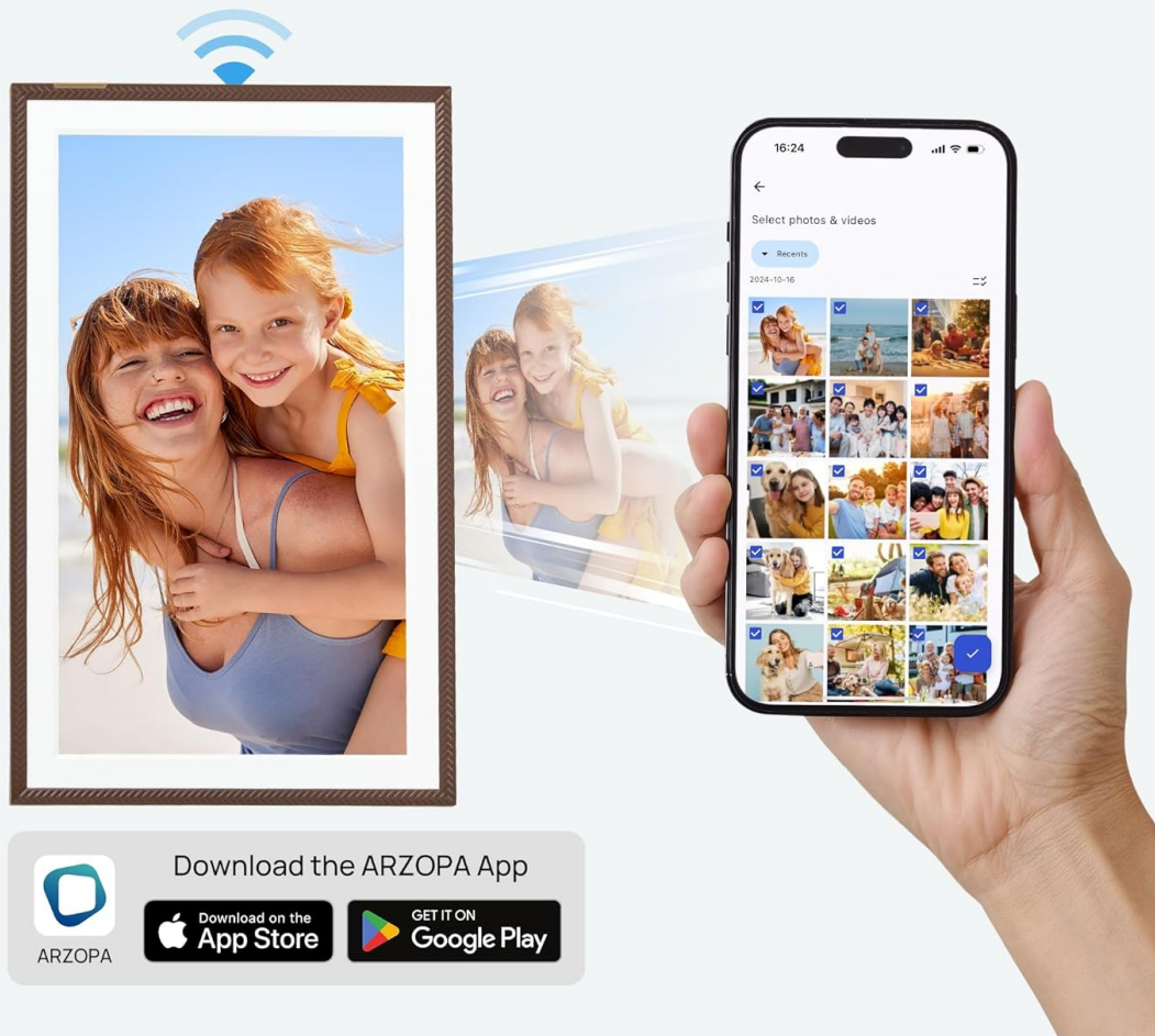
Image: A smartphone screen displaying the Arzopa app, illustrating the instant and unlimited photo and video sharing capabilities to the digital picture frame.