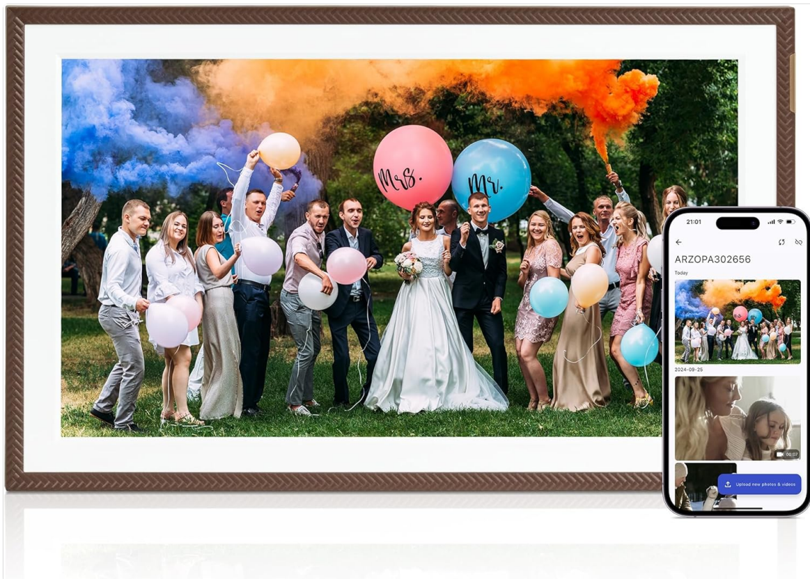
Image: The Arzopa 15.6 inch Digital Picture Frame alongside a smartphone displaying its companion app.