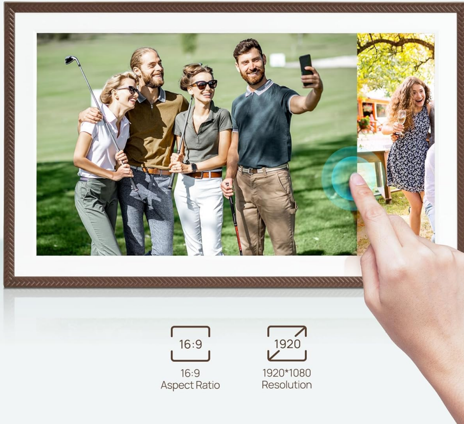
Image: A hand interacting with the touchscreen of the Arzopa Digital Picture Frame, highlighting its responsive interface.

A perfect gift for the the elderly who are not tech-savvy