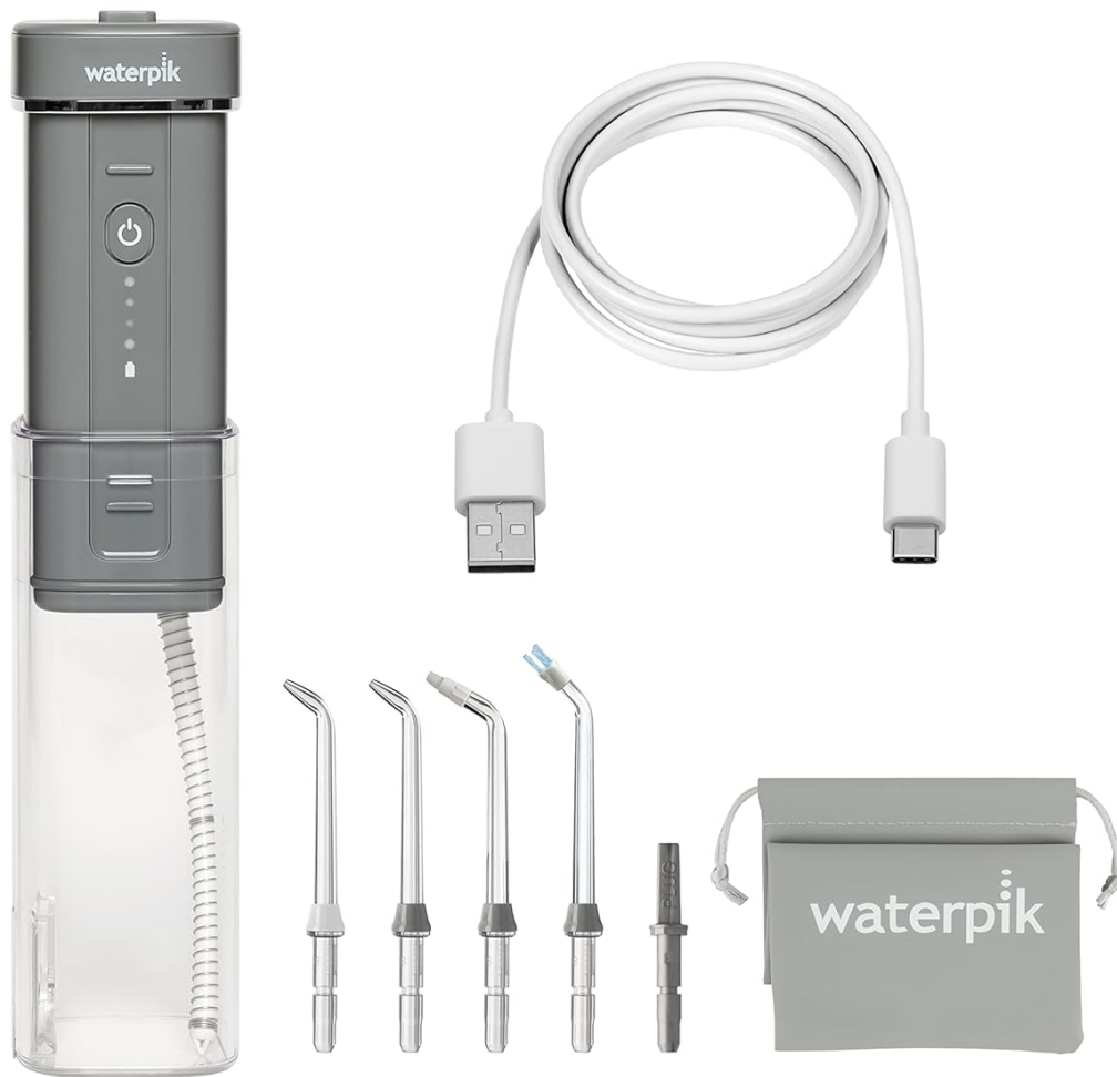
Figure 1: Waterpik Cordless Slide Professional Water Flosser with 4 tips, USB charging cable, and travel bag.