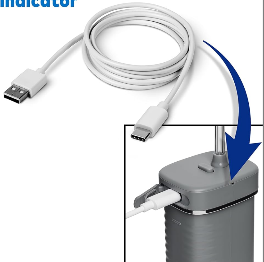
Figure 2: The Waterpik Cordless Slide charging via USB-C cable.

Up to 4 weeks of use LED recharge indicator