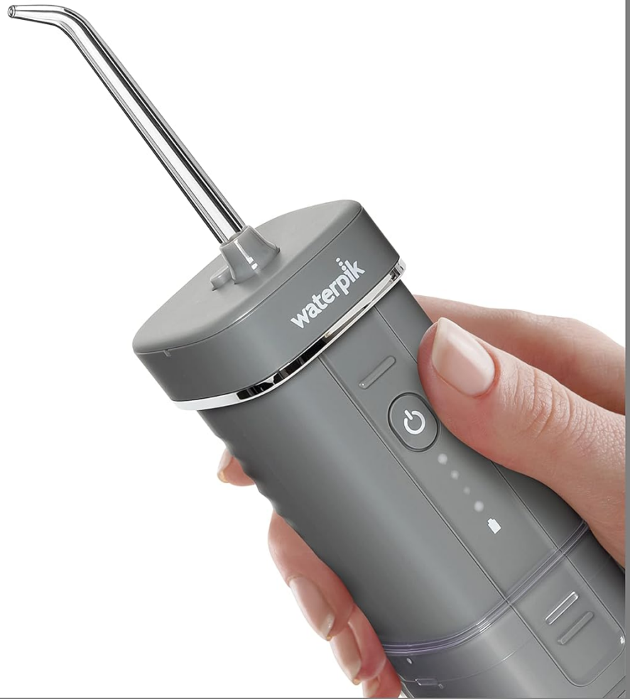
Figure 4: The control panel indicating the three available pressure settings.