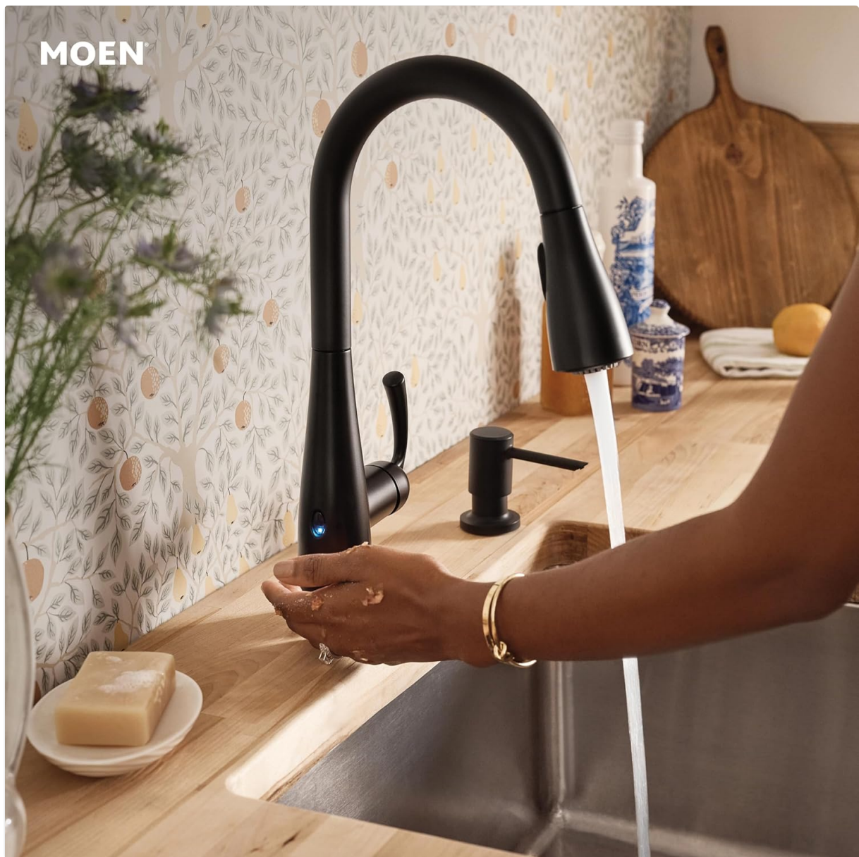
Figure 3: Activating the MotionSense Wave feature.