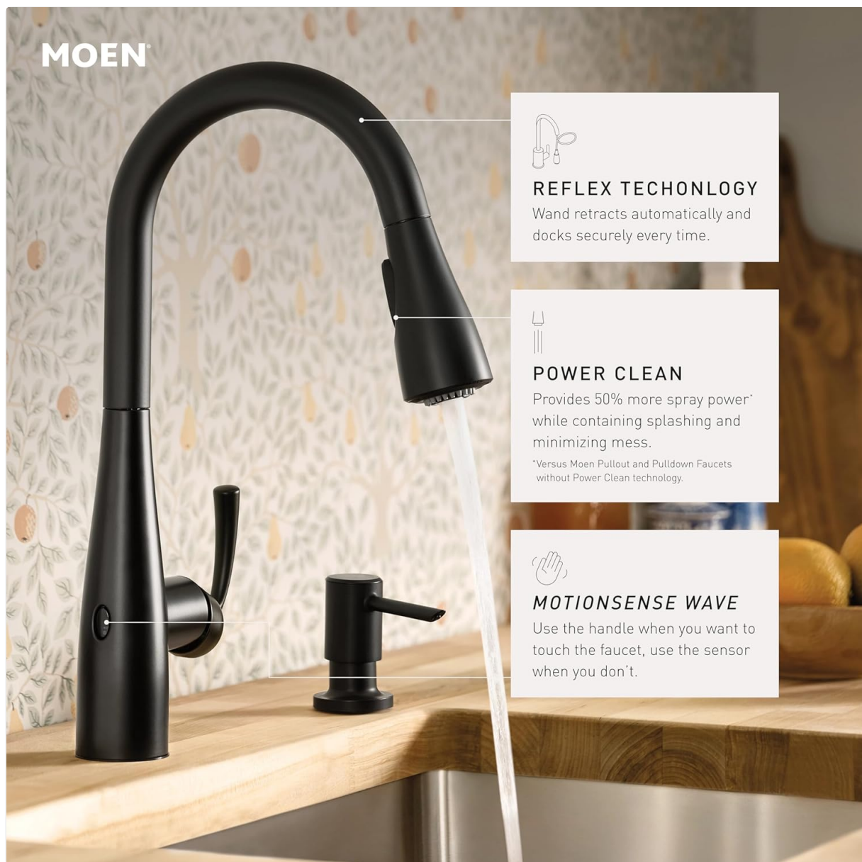
Figure 1: Key features of the Moen Essie MotionSense Wave Faucet.