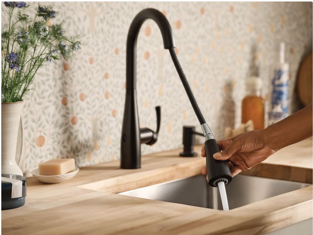
Figure 4: Using the pulldown sprayer for extended reach.