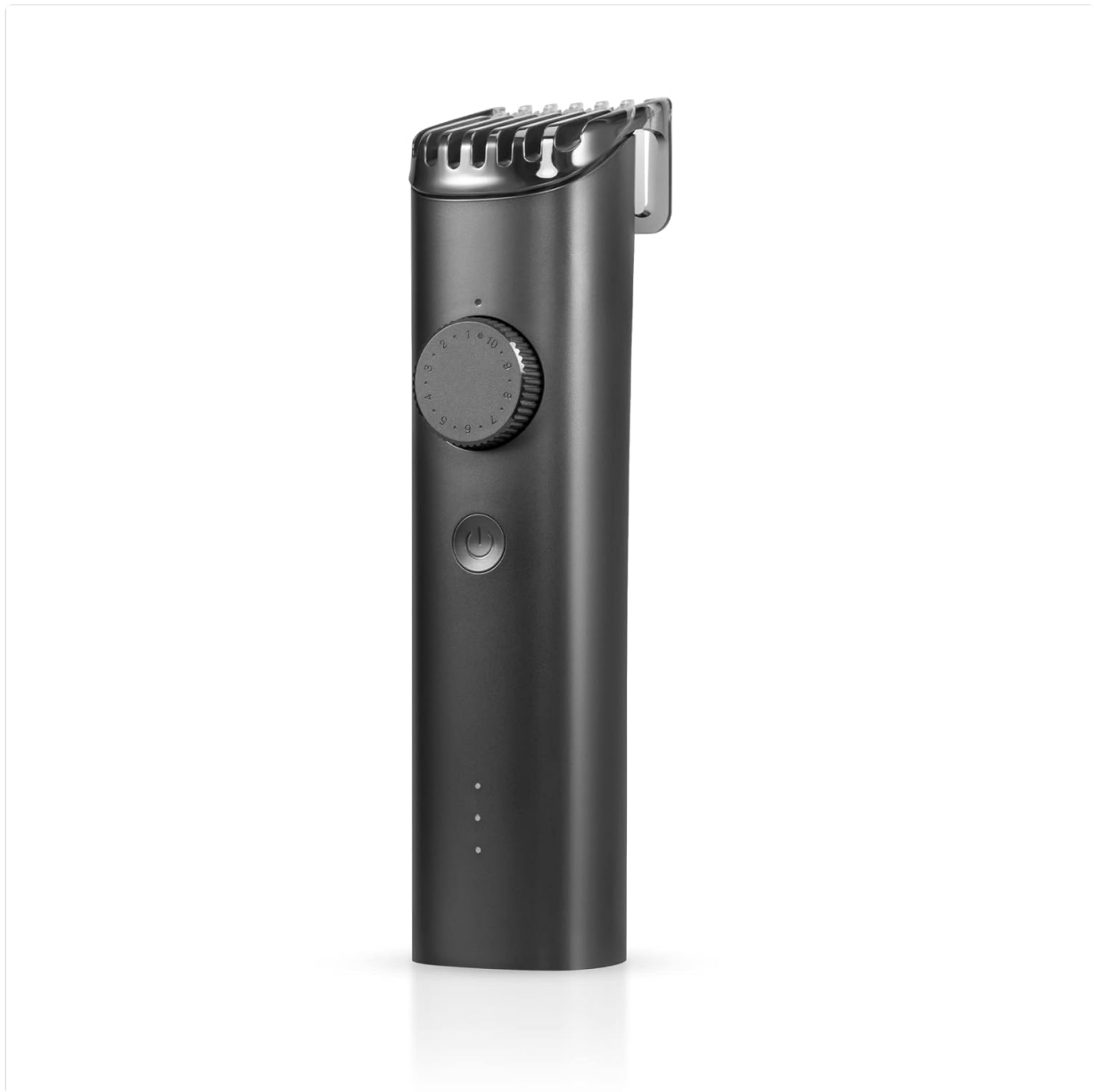
Image 1.1: MI Xiaomi Beard Trimmer 2C, showcasing its sleek black design and integrated dial.