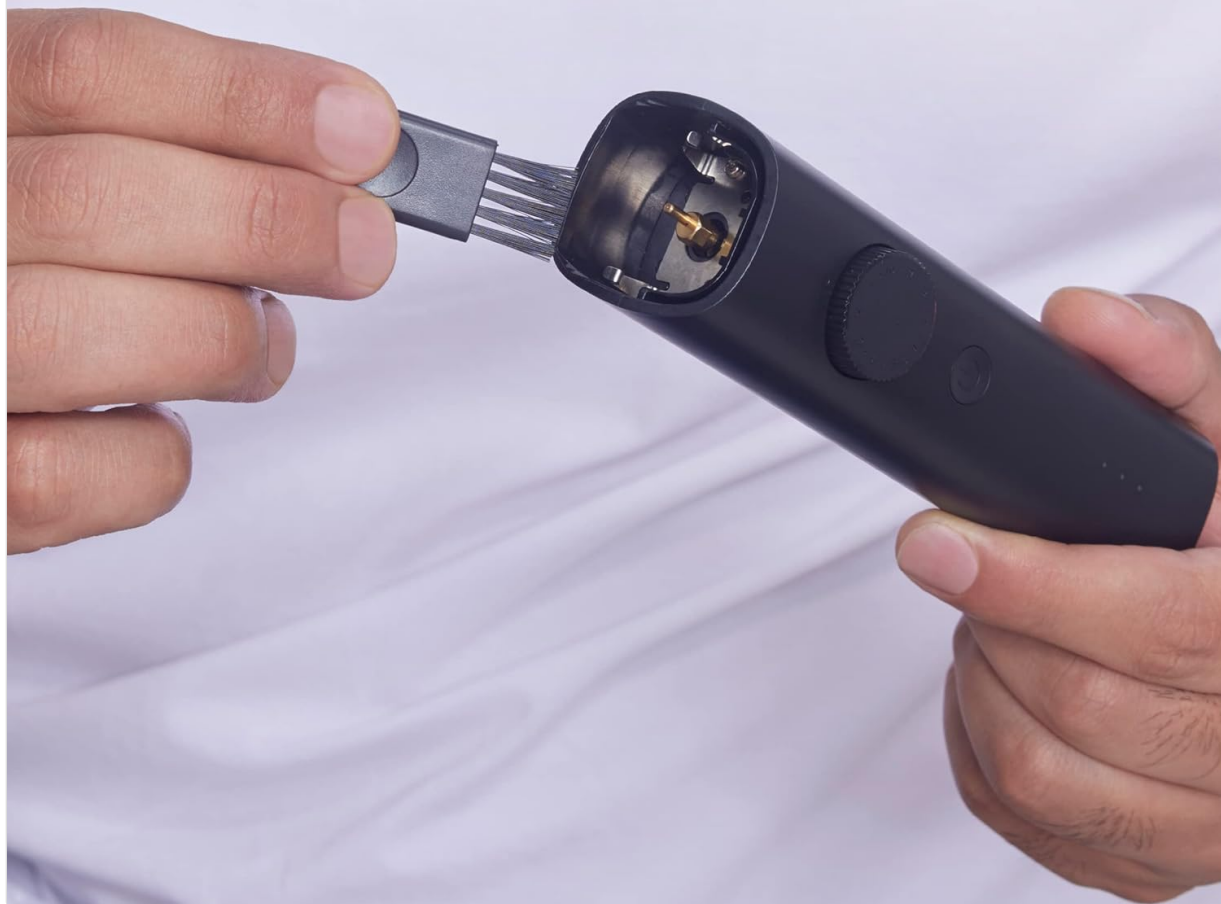
Image 6.1: Using the cleaning brush to remove hair from the trimmer blades.