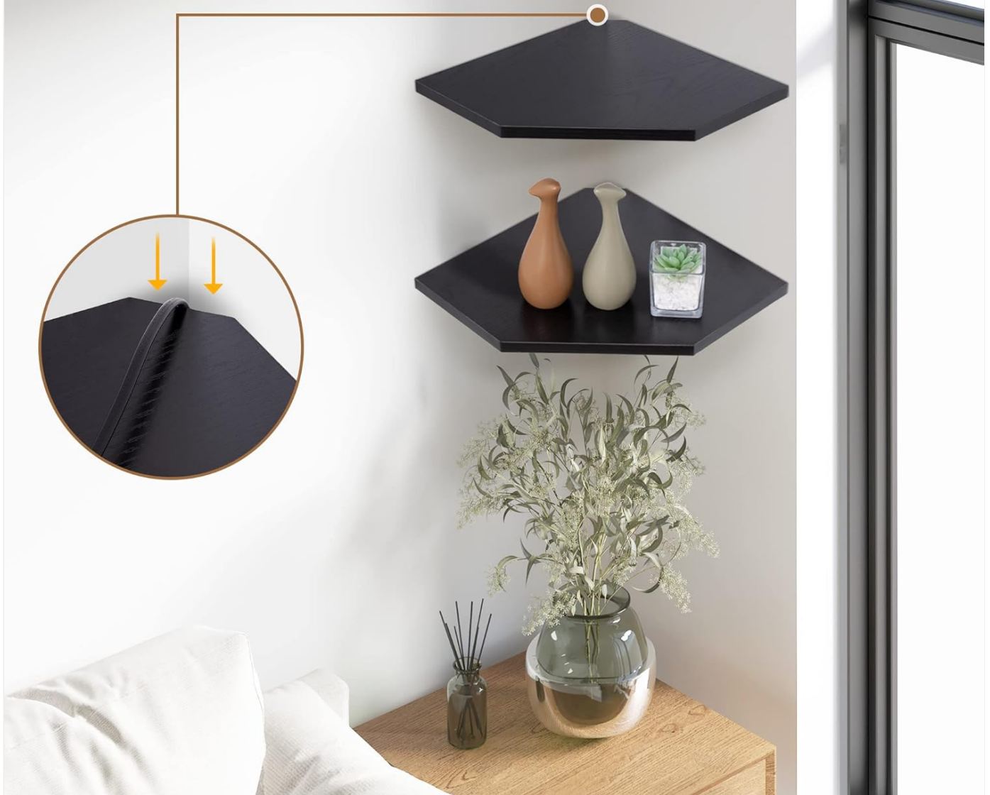
Image: Detail of the rear cord hole, designed for cable management and a tidy appearance.

Provides cord concealed channel, to hide all your messy cables