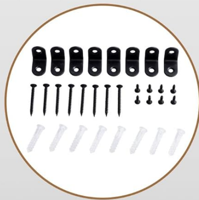
Mounting hardware included