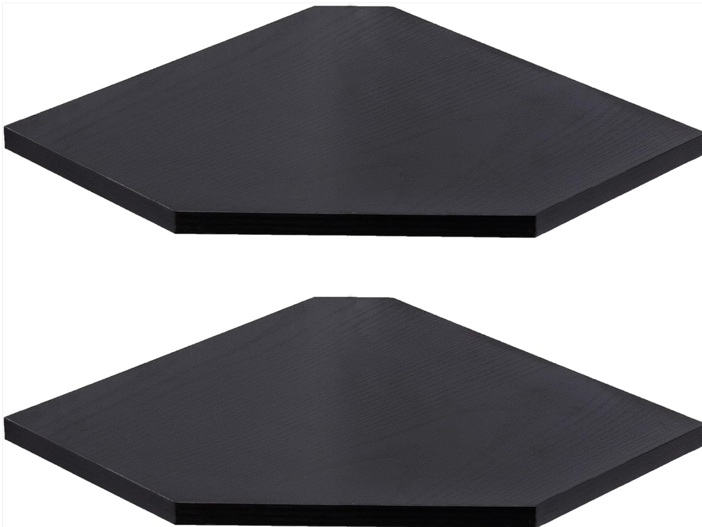
Image: Two black corner shelves, showcasing the product's design and color.

Crafted from premium quality, heavy-duty composite wood, these shelves are built for durability. They are mildly waterproof and easy to clean, ensuring longevity and ease of maintenance. Each shelf is designed to support a significant weight, making them a robust storage solution. The imitation wood grain finish adds a natural and rustic touch, complementing a wide range of interior decor styles.