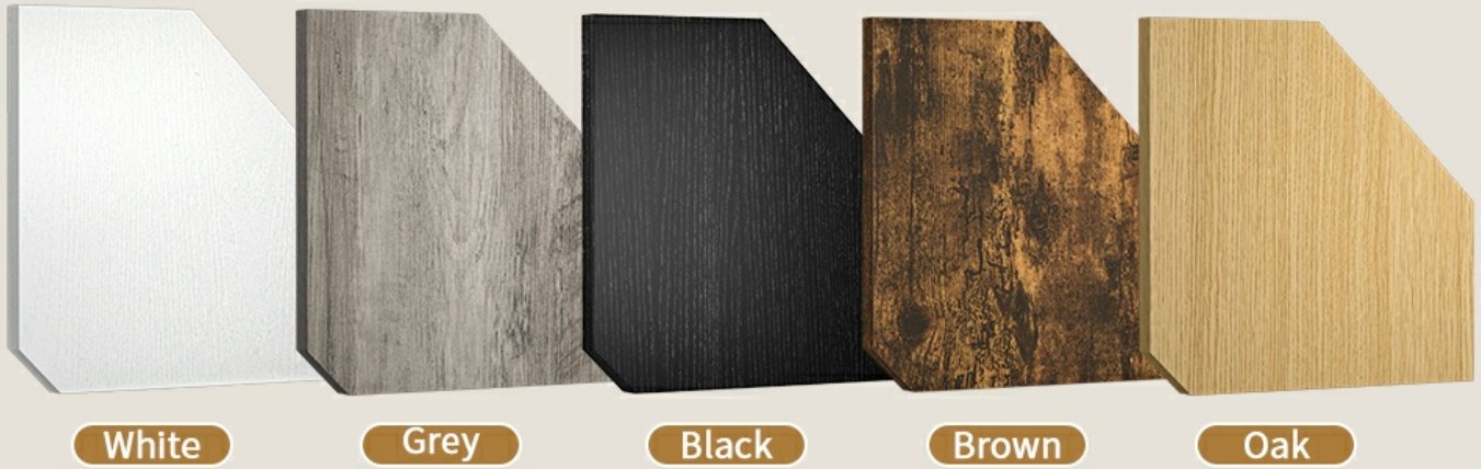
Image: Available finishes for the corner shelves, including White, Grey, Black, Brown, and Oak, demonstrating versatility in decor matching.