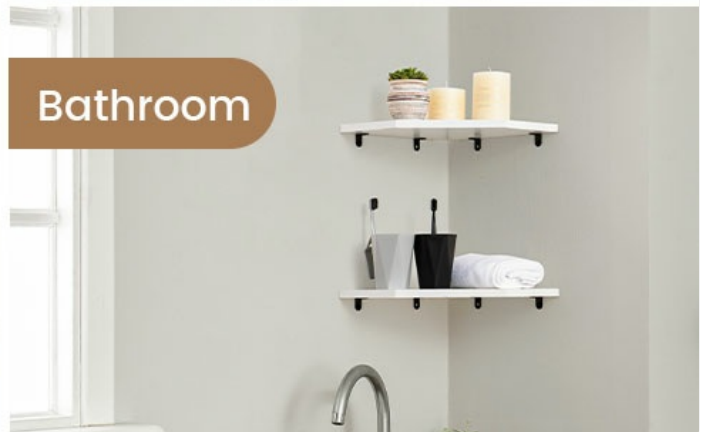
Image: Examples of corner shelf usage in various rooms: kitchen, bedroom, and bathroom, demonstrating their versatility.

The floating design provides a simple and clean aesthetic, making the shelves appear to seamlessly integrate with your wall.