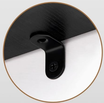
L-shaped metal support

Image: Components included for installation: detailed instructions, various screws and anchors, and an L-shaped metal support bracket.