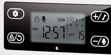
Image: Control panel for programming the feeder.

Le panneau de paramètres intuitif convient à tous les âges et évite les opérations compliquées.