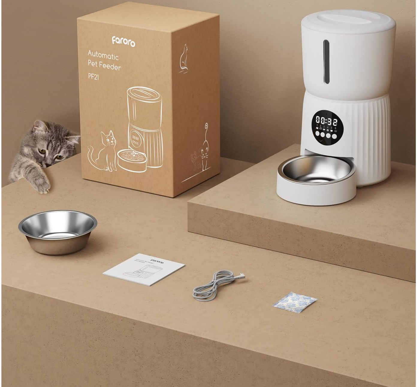
Image: Contents of the Faroro 4L Automatic Pet Feeder box.