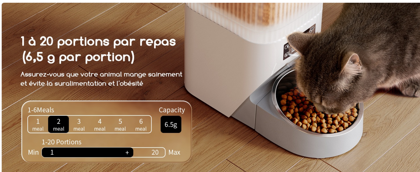
Image: Portion size adjustment.

The feeder supports 1 to 6 meals per day, with 1 to 50 portions per meal (approx. 10g per portion).