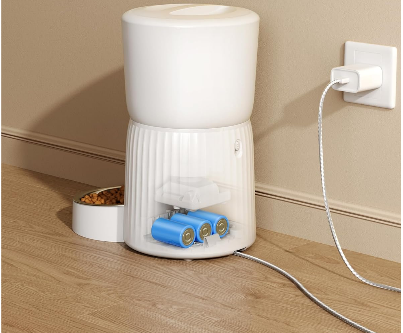
Image: Dual power supply options for the feeder.

Ensure uninterrupted feeding, even during a power outage