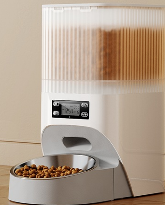
Image: Example of a customized feeding schedule.