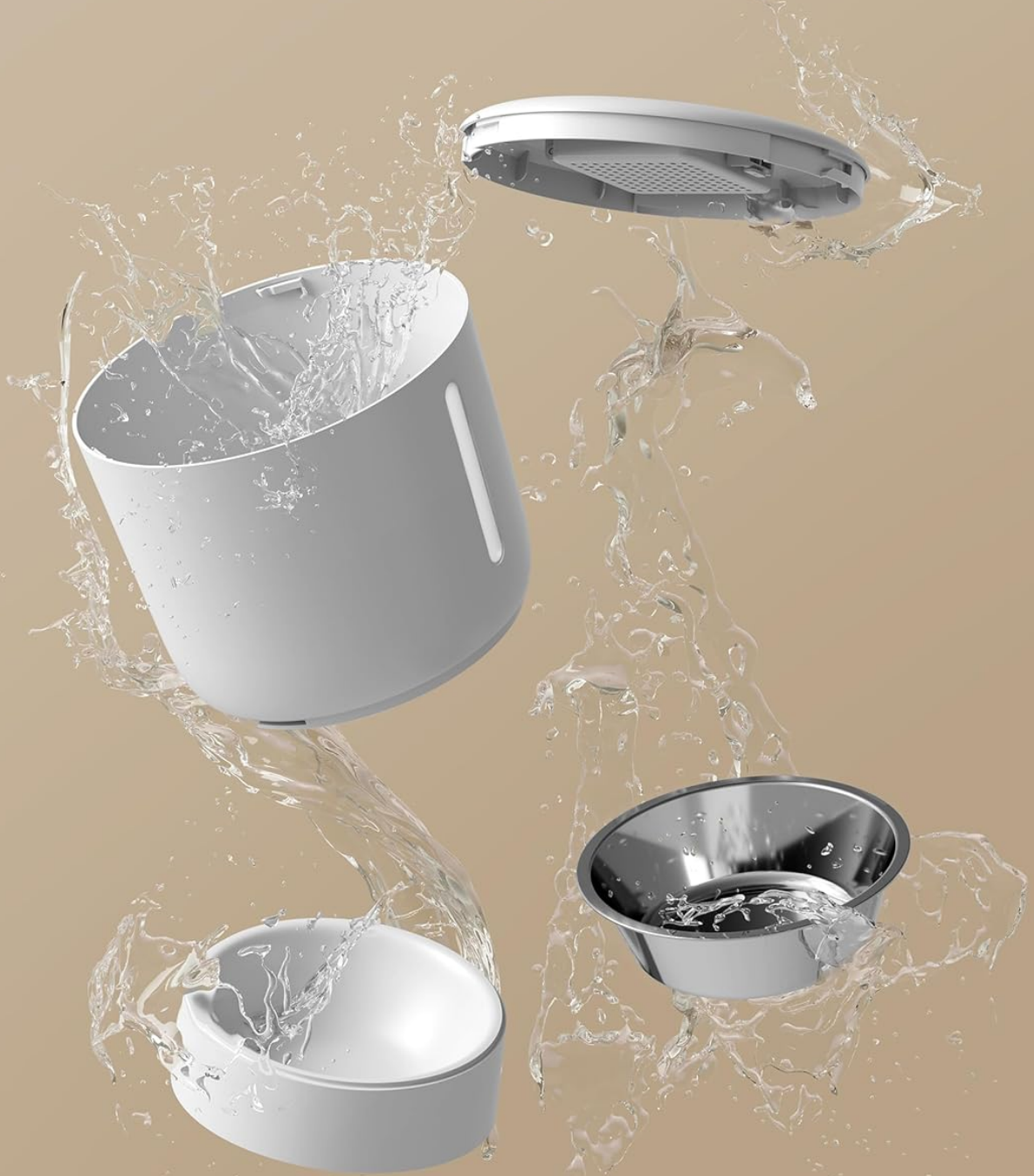
Image: Detachable components for easy cleaning.

Detachable structure for a hygienic feeding environment