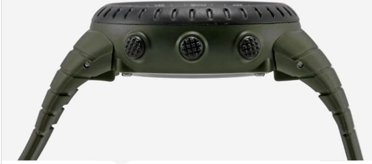
Figure 2: Side Profile and Button Placement

COOL OPENED SURFACE DESIGN WITH 3D DIAL , SHOCK RESISITANT