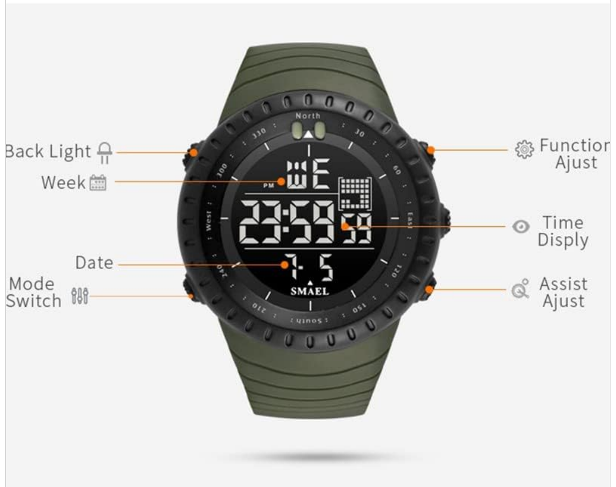
Figure 1: Watch Face and Button Identification

MORE DETIALS JUST FOR YOUR BEST EXPERIENCE