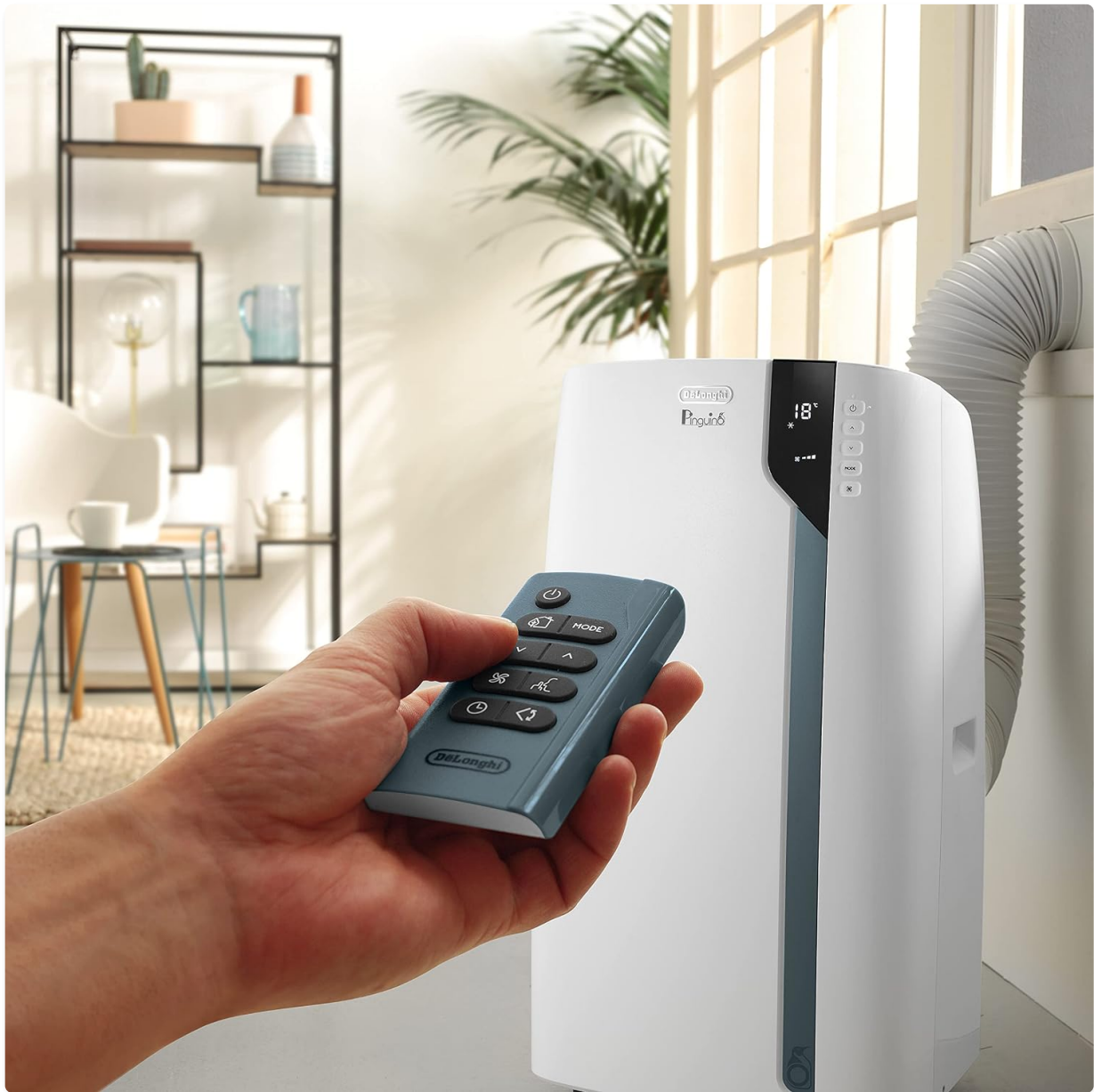
Image 1.1: De'Longhi Pinguino PAC EX105 in operation with remote control.