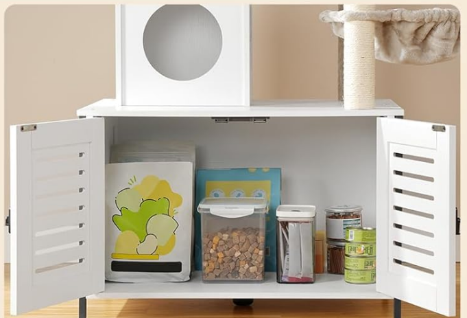
Store cat food and pet supplies

Image: Demonstrates the versatility of the hidden litter box enclosure, showing it used for a litter box, a cat bed, or storage for cat supplies.