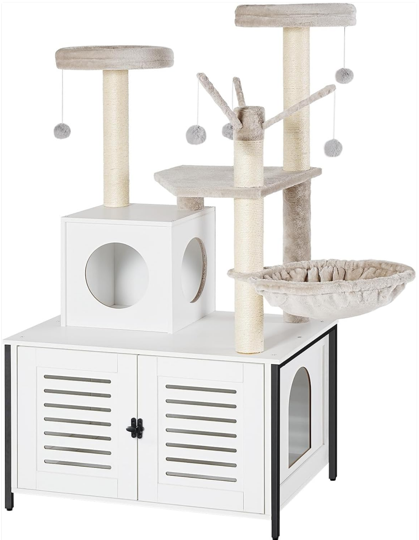
Image: Fully assembled HOOBRO Cat Tree, showcasing its multi-level design and integrated litter box enclosure.