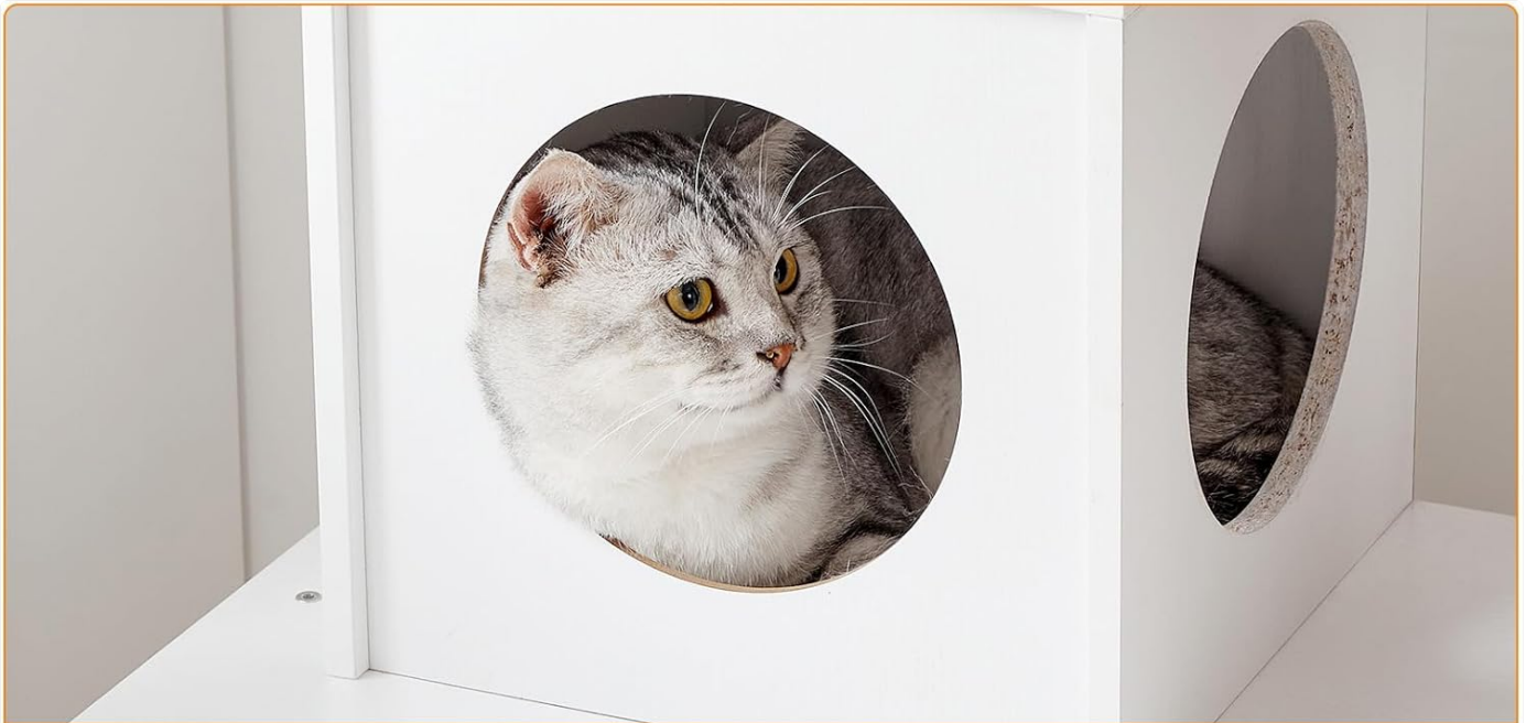
More Private Space