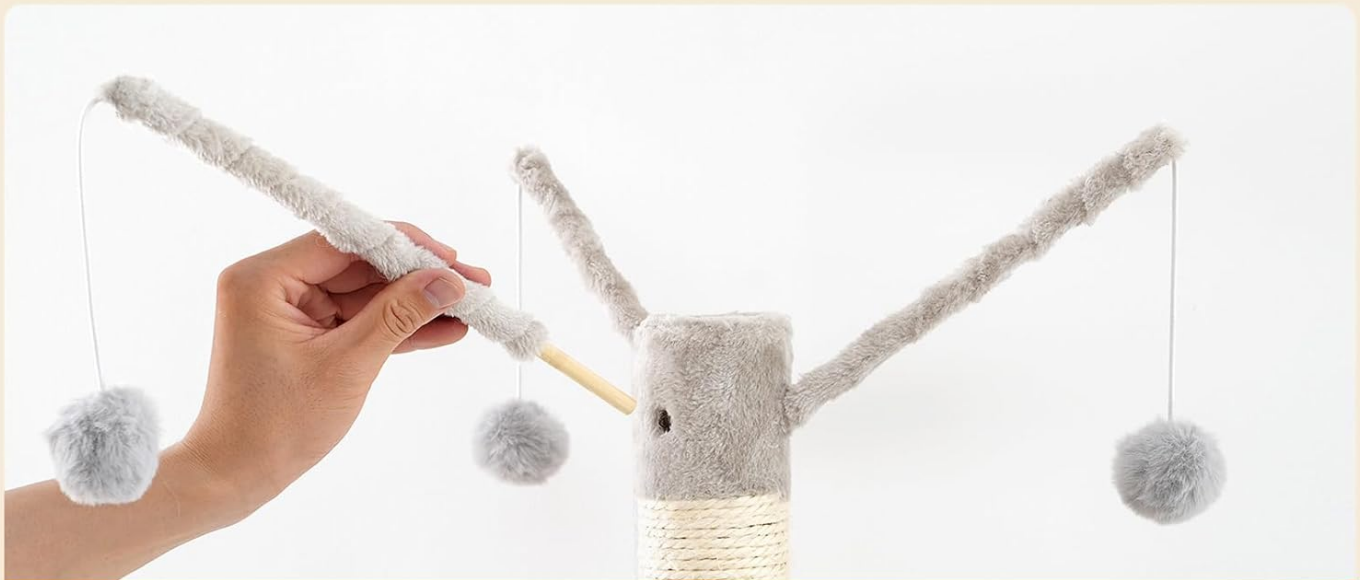
Detachable Teaser Sticks