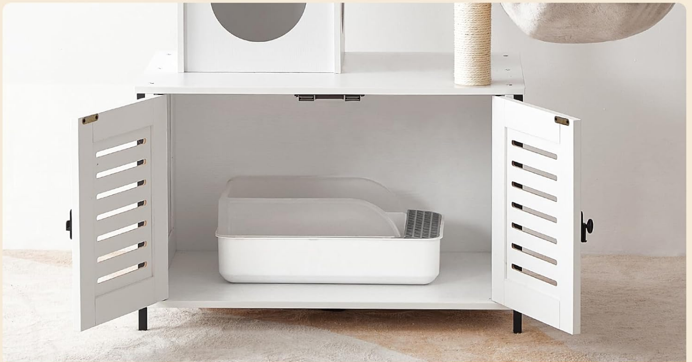
Hidden Litter Box