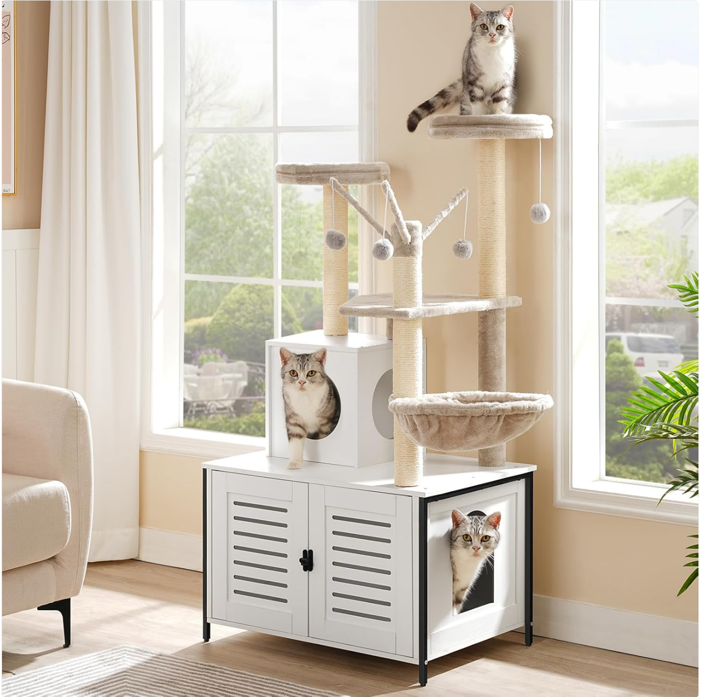
Image: Cats utilizing the various levels and the hidden litter box enclosure of the cat tree.