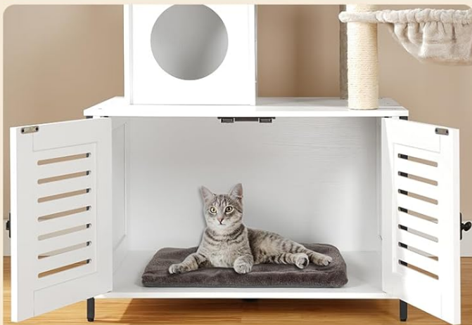
Add a cat bed to create a private and comfortable space