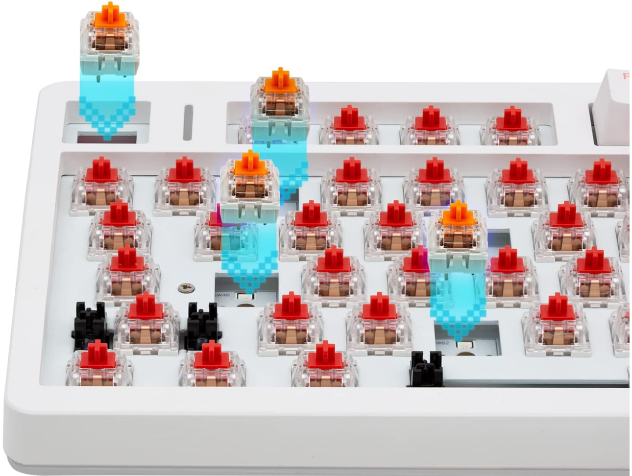
Image: Keyboard with several keycaps and switches removed, illustrating the hot-swappable design.

Hot-swappable axle holders for most mechanical axes, easy to change axes at will, freely define your own keyboard feel