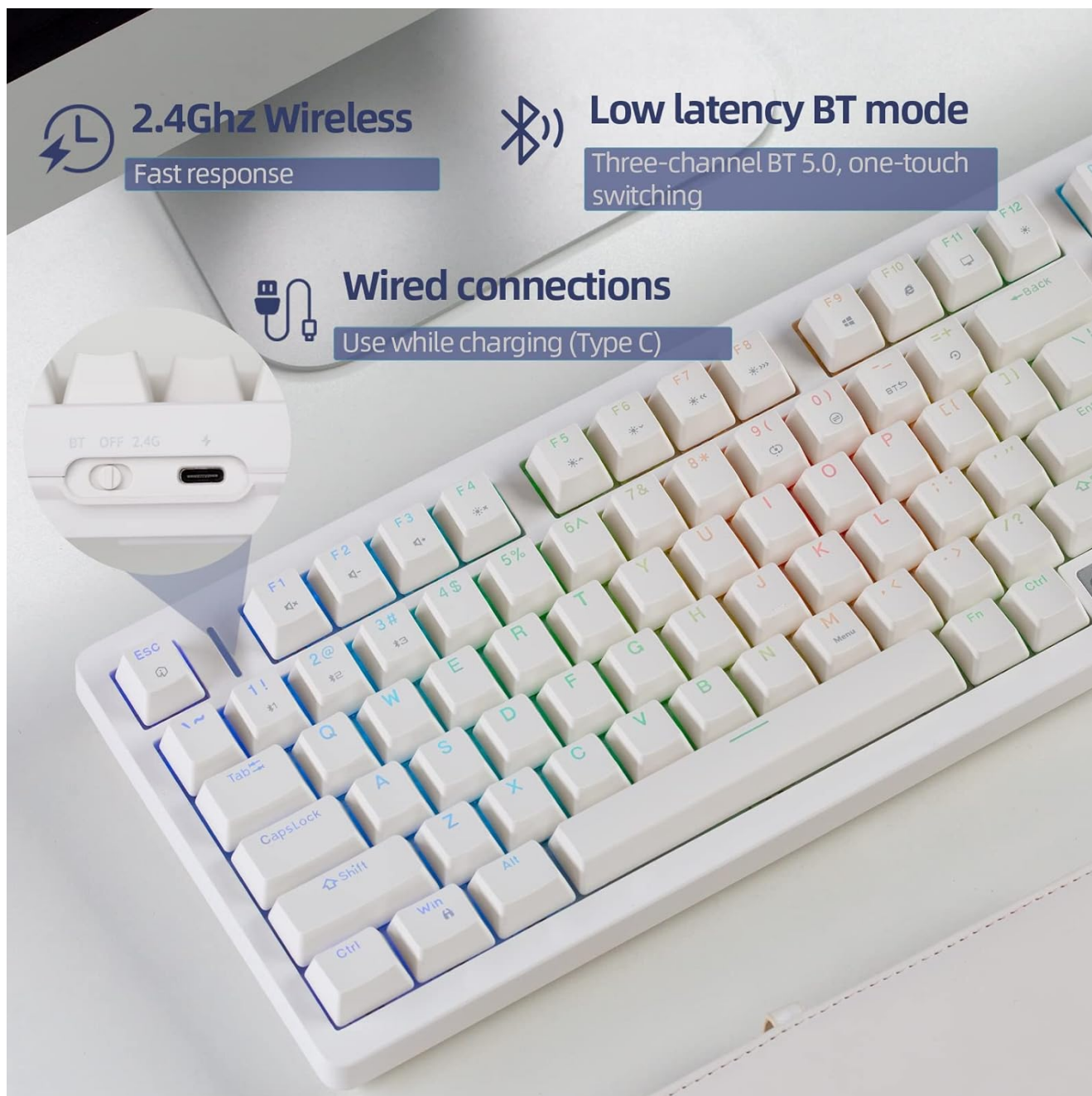
Image: Keyboard with 2.4GHz wireless dongle and USB-C port highlighted.