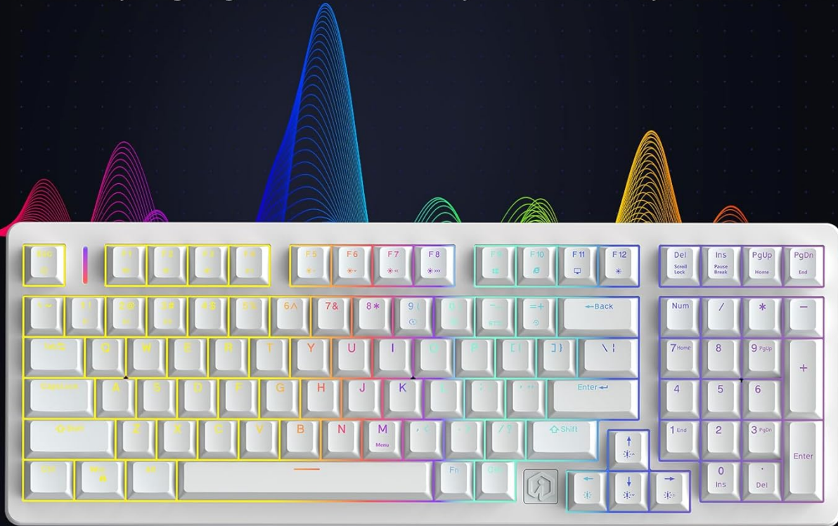
Image: Keyboard highlighting its 3800mAh battery capacity, providing over 40 days of use.

16.8 million colours of full-colour RGB lighting, customisable via the IROK assistant, with a variety of lighting modes and musical rhythms to create a dynamic ambience