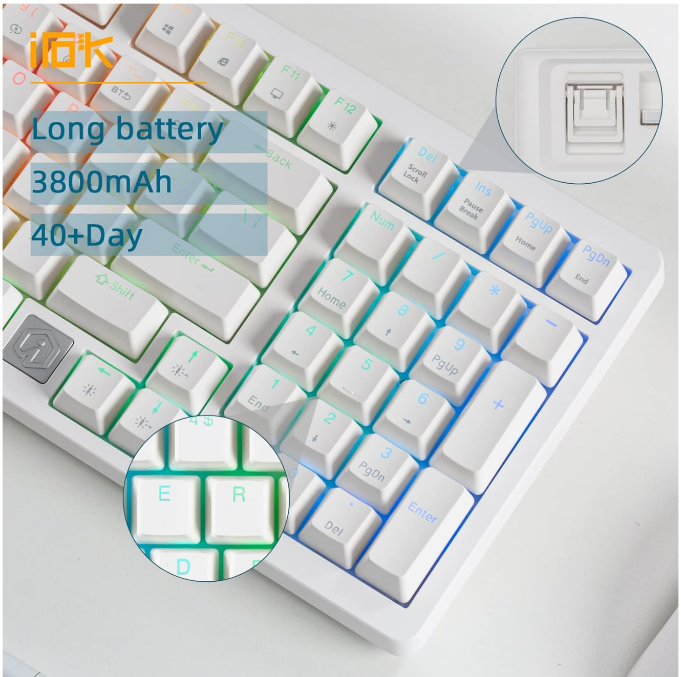
Image: The IROK FE98Pro keyboard showcasing its customizable RGB backlighting with a wave effect.