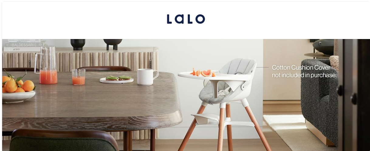
Image: Fully assembled Lalo The Chair Convertible 3-in-1 High Chair, showcasing its sleek design and wooden legs.

Attach the sustainably sourced beechwood legs to the seat base. Ensure they click securely into place. The design allows for quick and intuitive setup.