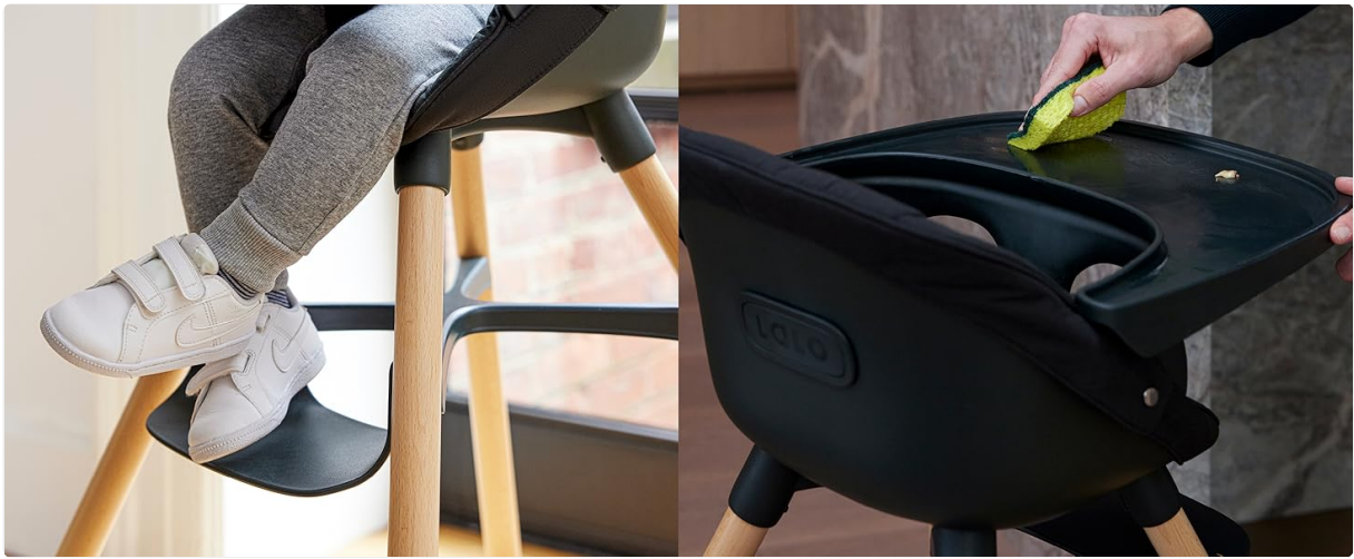
Image: Lalo The Chair shown in its toddler dining chair configuration, demonstrating its adaptability as children grow.