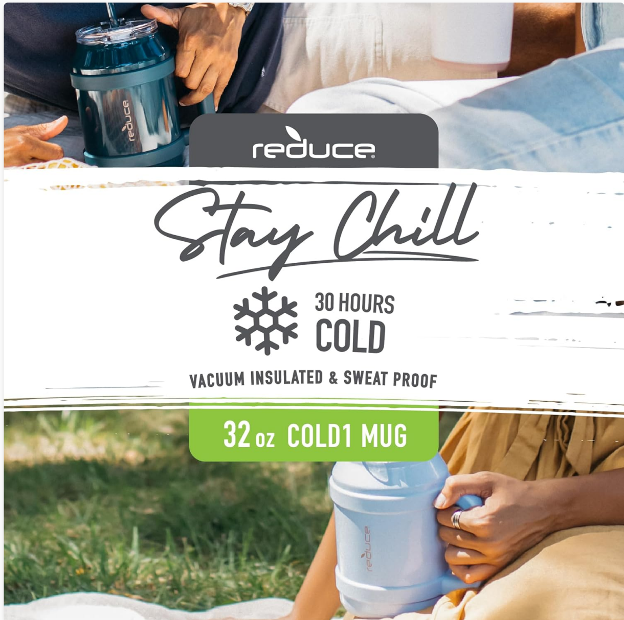
Image: Visual representation of the tumbler's insulation capabilities, indicating up to 30 hours of cold retention.