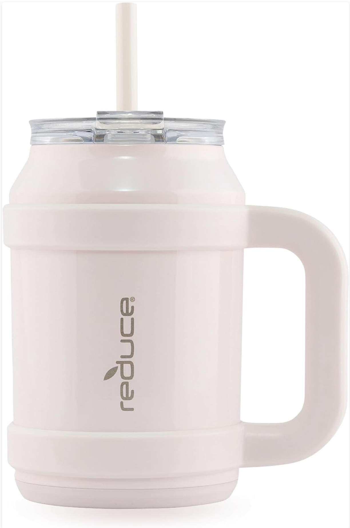
Image: The REDUCE Cold1 32 oz Water Tumbler, showcasing its design and components.