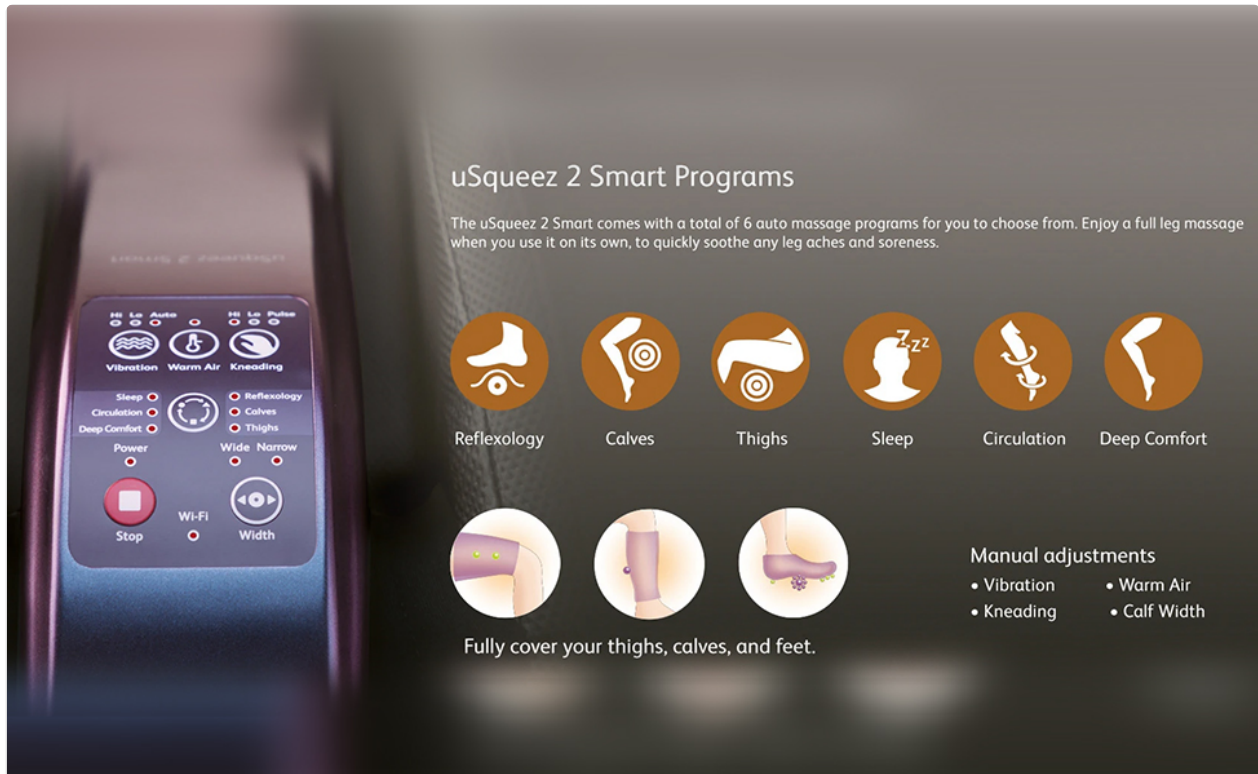
Image 3.2: The control panel of the uSqueeze 2 Smart, displaying options for vibration, warm air, kneading, and the six auto massage programs.