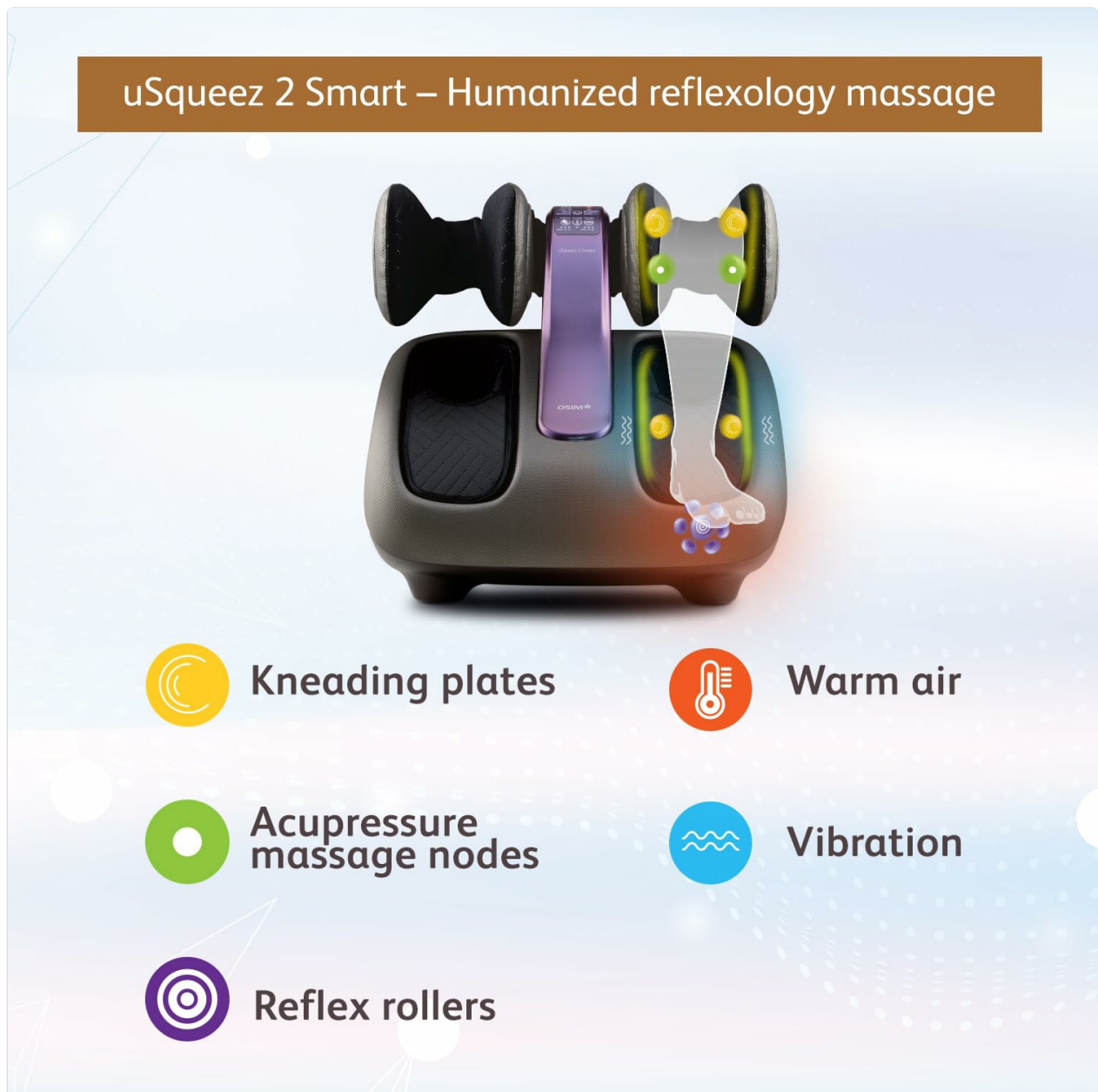
Image 3.1: Diagram illustrating the five core massage techniques: Kneading Plates, Acupressure Massage Nodes, Reflex Rollers, Warm Air, and Vibration.