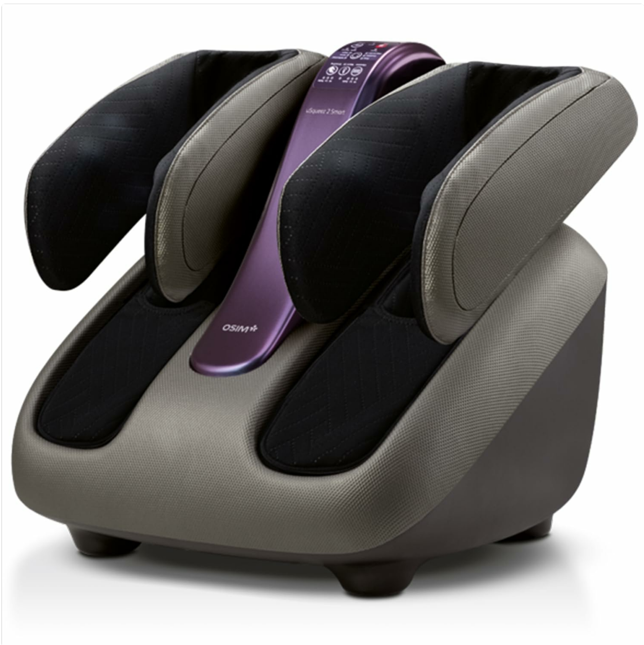
Image 1.1: The OSIM uSqueeze 2 Smart Leg Massager, showcasing its ergonomic design and dark grey finish with purple accents.