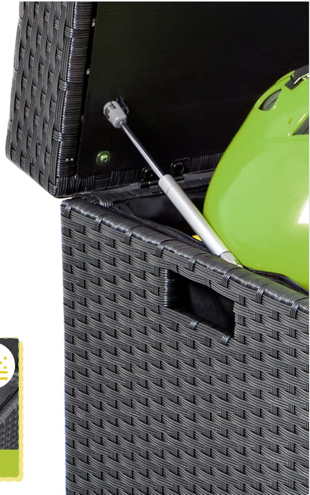
Image: An illustration detailing key user-friendly features: the hydraulic gas rod for safe lid operation, the built-in handrail for portability, and the internal dust bag for content protection.