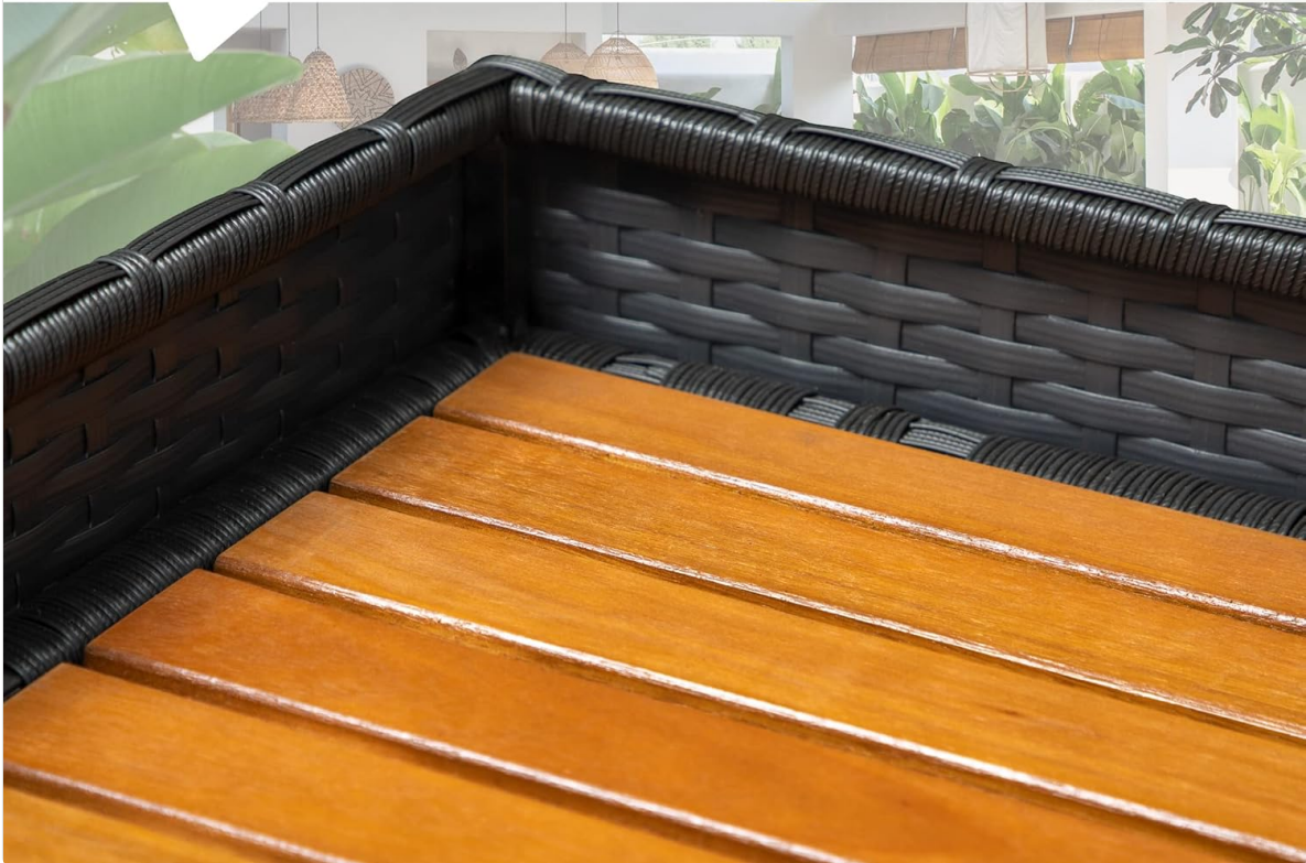
Image: A detailed view highlighting the texture of the high-density rattan and the smooth finish of the premium Acacia wood used for the bench lid.