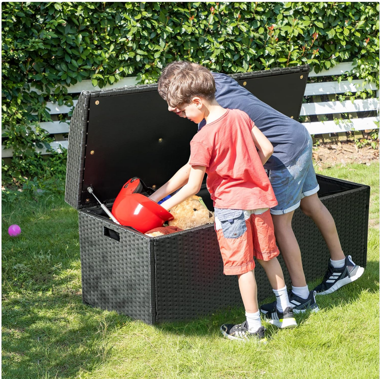
Image: Two children actively organizing and placing various toys into the spacious interior of the open Devoko storage bench, demonstrating its practical use for storing items.