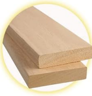
Premium Acacia Wood