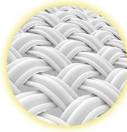
High Density Rattan