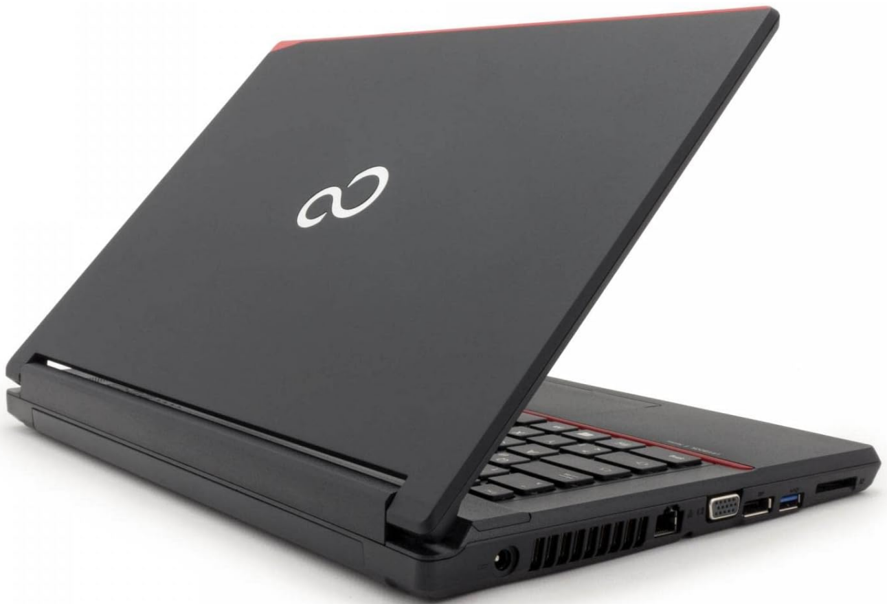
Image: Right side view of the Fujitsu LIFEBOOK E546, showing VGA, DisplayPort, LAN, and other ports.