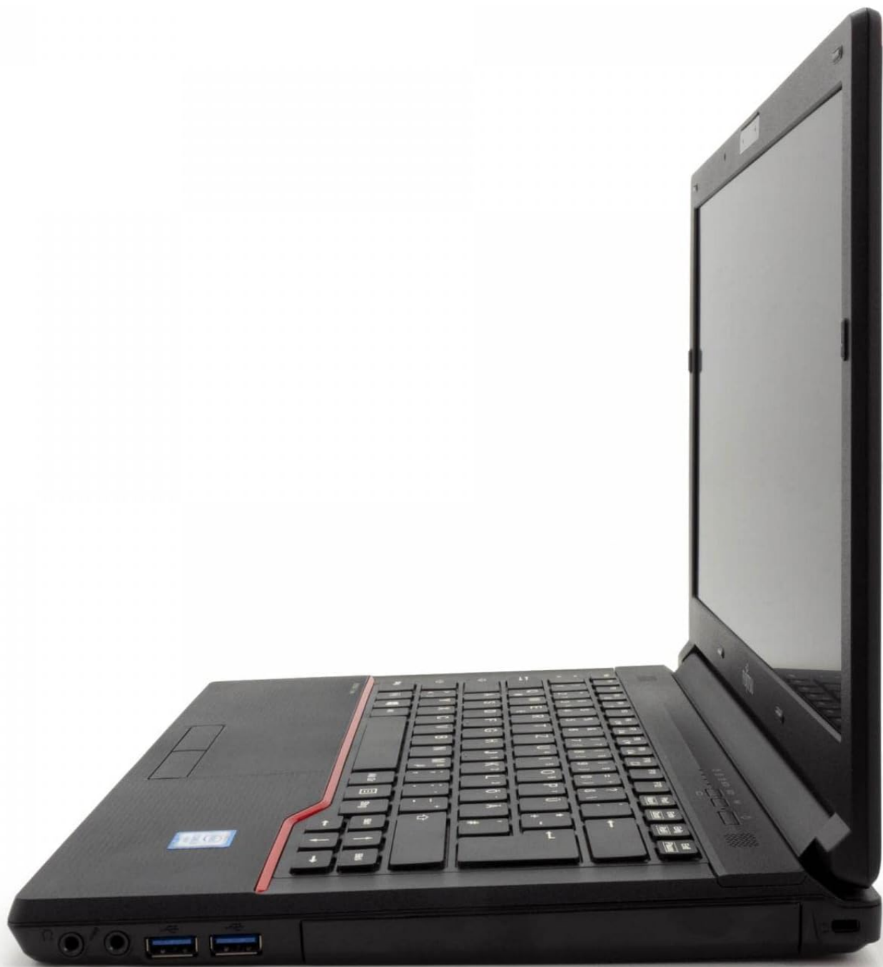
Image: Left side view of the Fujitsu LIFEBOOK E546, showing audio jacks and USB ports.