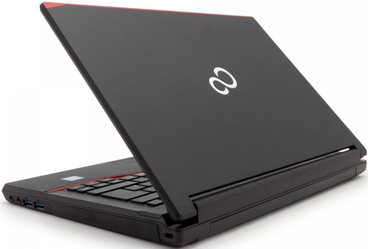
Image: Fujitsu LIFEBOOK E546 laptop open, viewed from an angle, showing the keyboard and screen. The power button is typically located near the keyboard.

and press the power button, typically located near the keyboard. The system will guide you through the initial Windows 10 setup process, including language selection, network connection, and user account creation.