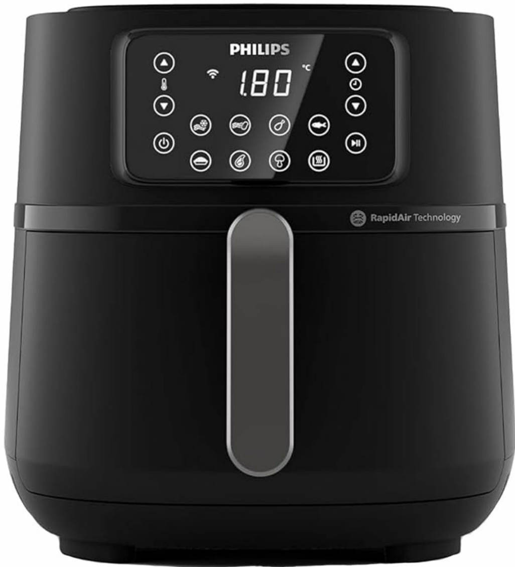
Image 1: Front view of the Philips 5000 Series Air Fryer XXL Connected HD9285/90, showcasing its sleek black design and digital display.