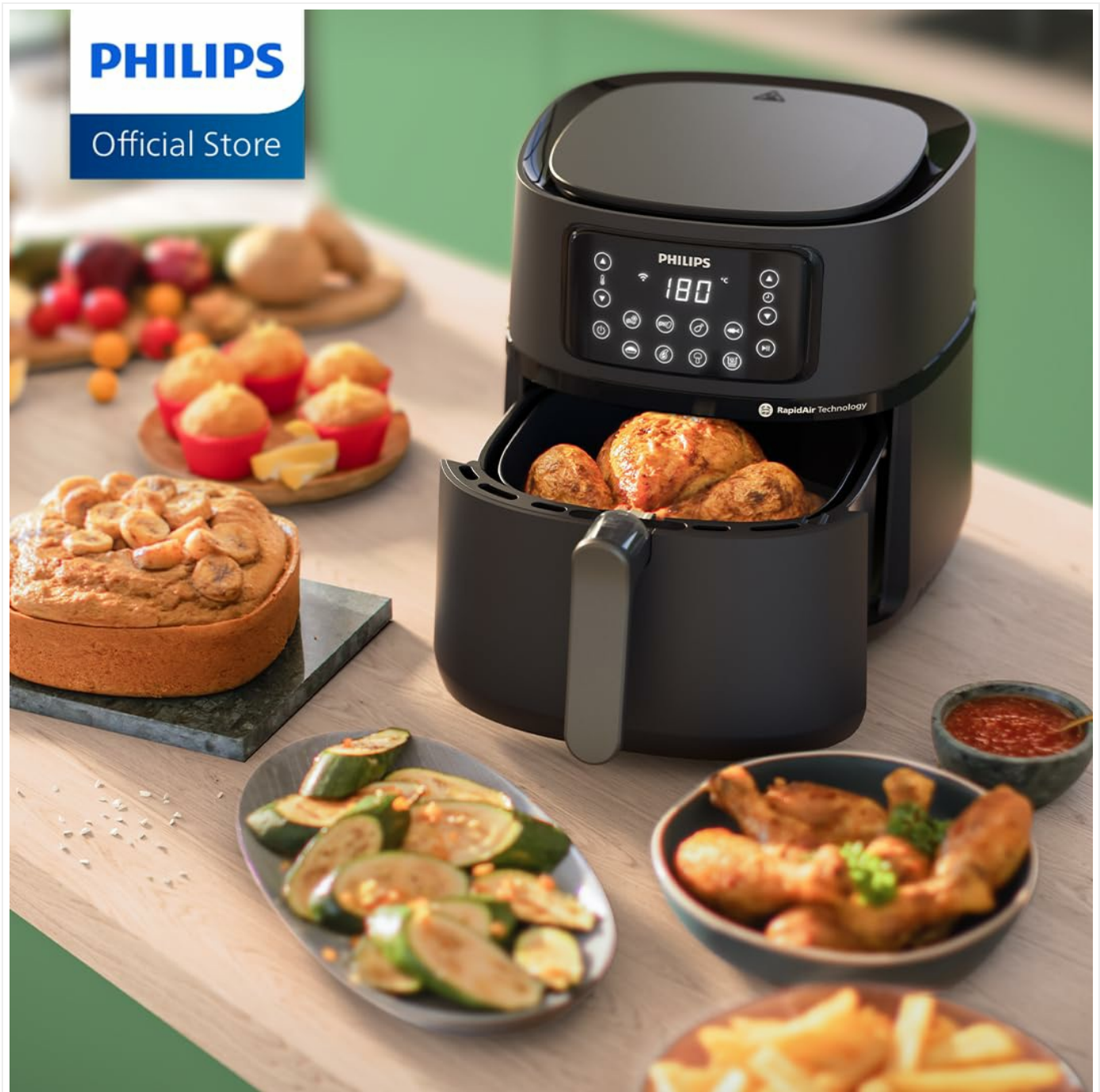
Image 3: The Philips Air Fryer with its basket partially pulled out, revealing cooked chicken inside, demonstrating its cooking capacity.