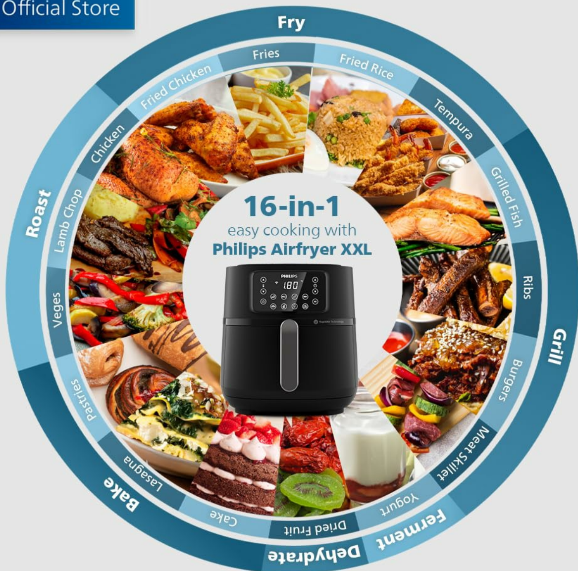
Image 5: A circular diagram illustrating the 16-in-1 cooking functions of the Philips Air Fryer, including frying, roasting, baking, grilling, fermenting, and dehydrating, with examples of food for each.