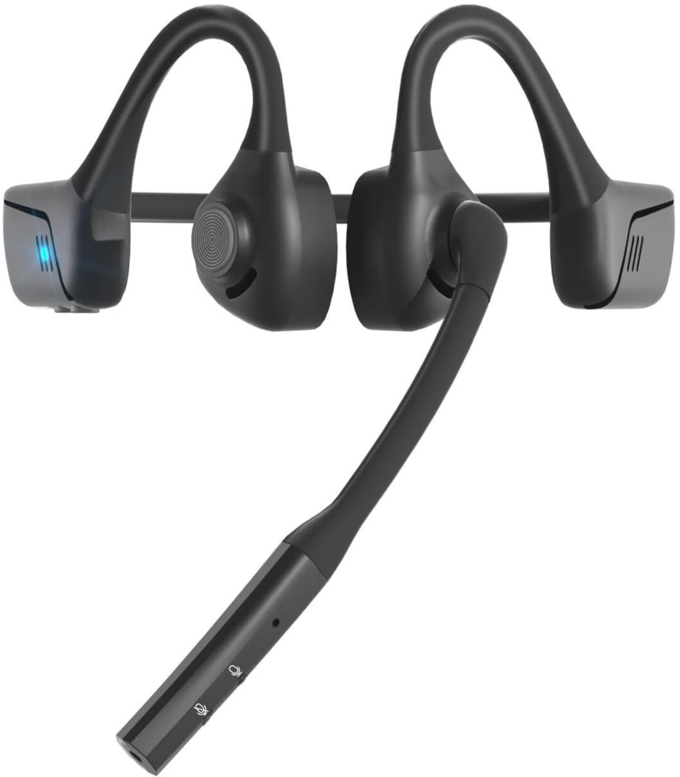
Image: The BANIGIPA G3 Bluetooth Headset, showcasing its open-ear design and boom microphone.