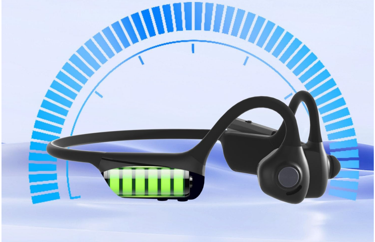
Image: Infographic detailing battery capacity (250mAh), charging time (2 hours), working time (16 hours), and standby time (400 hours).