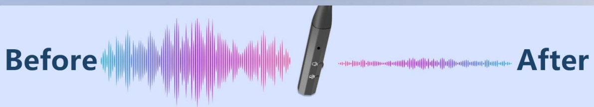
Image: Illustration of DSP noise canceling technology in action, showing clearer audio after processing.

Your browser does not support the video tag.