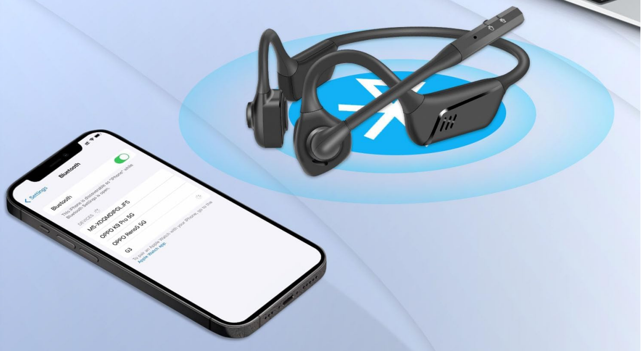
Image: Illustration showing the headset connected to both a smartphone and a laptop simultaneously.