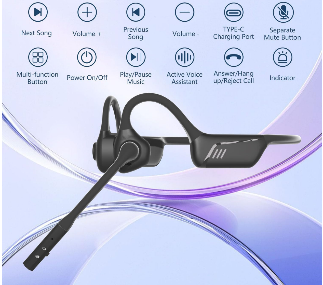
Image: Diagram showing the various buttons and their functions on the headset, including power, volume, and charging port.