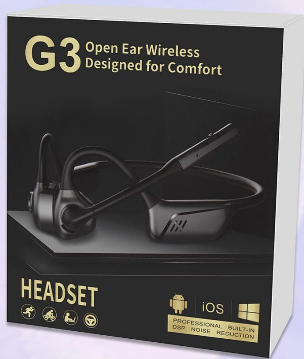
Image: Contents of the BANIGIPA G3 Headset box, including the headset, USB-C charging cable, and user manual.