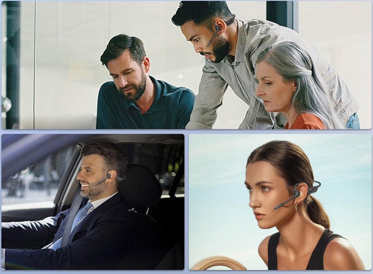
Image: Collage showing various usage scenarios for the headset, emphasizing situational awareness in different environments.

Stay aware of your surroundings while enjoying your favorite music whether working at home or communicating with colleagues at the office!