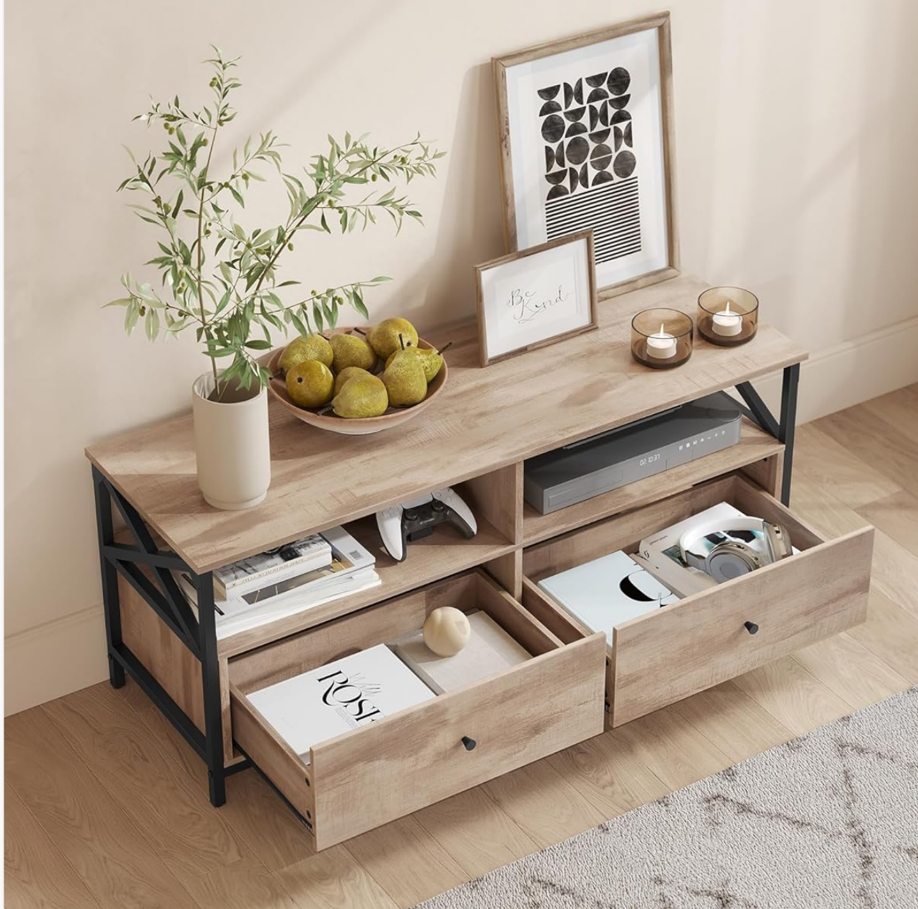
Image 3: The TV stand's drawers and open shelves provide versatile storage options.

Répond à vos différents besoins de rangement