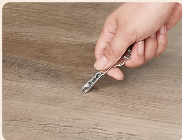
Résistant aux rayures

Image 2: Detail of the X-shaped side frame and adjustable feet, crucial for stability.