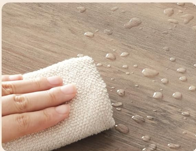
Facile à nettoyer