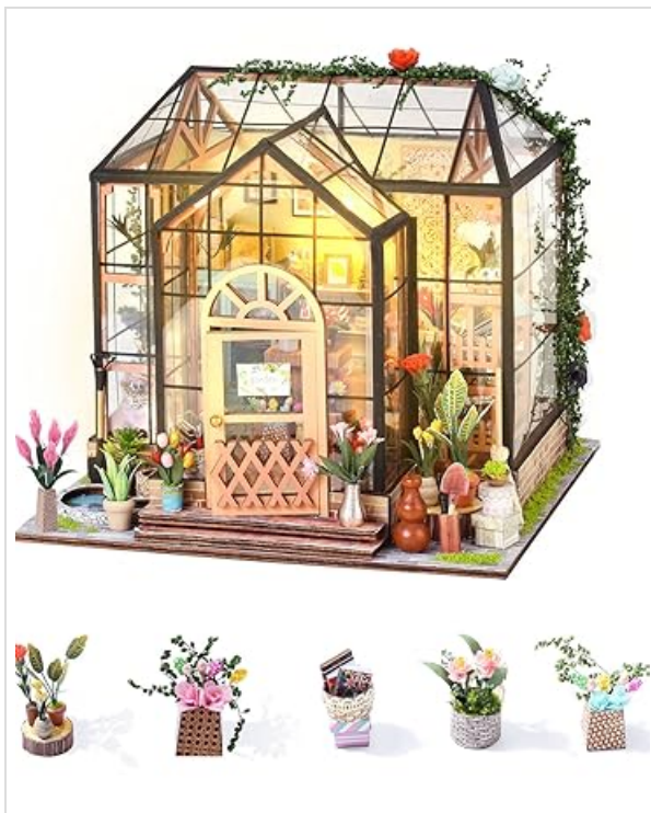
Image: A close-up of miniature potted plants and shelving units within the greenhouse, demonstrating intricate details.

Proceed to assemble the miniature furniture, plants, and decorative elements. These often involve small paper, wood, or plastic pieces that need to be cut, folded, and glued. Refer to the specific instructions for each item.