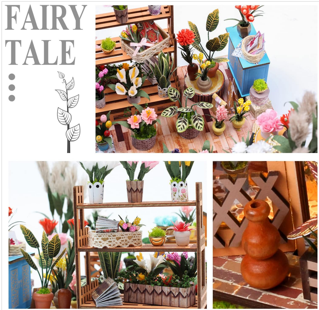
Image: Another perspective of the greenhouse interior, highlighting different miniature plant arrangements and decorative items.

Install the LED lighting system according to the manual's diagrams. This typically involves routing wires and connecting them to a battery box. Ensure all connections are secure before inserting batteries.