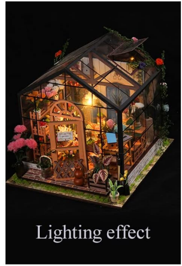
Image: A detailed interior view of the miniature greenhouse, showcasing various plants, flowers, and small furniture pieces.