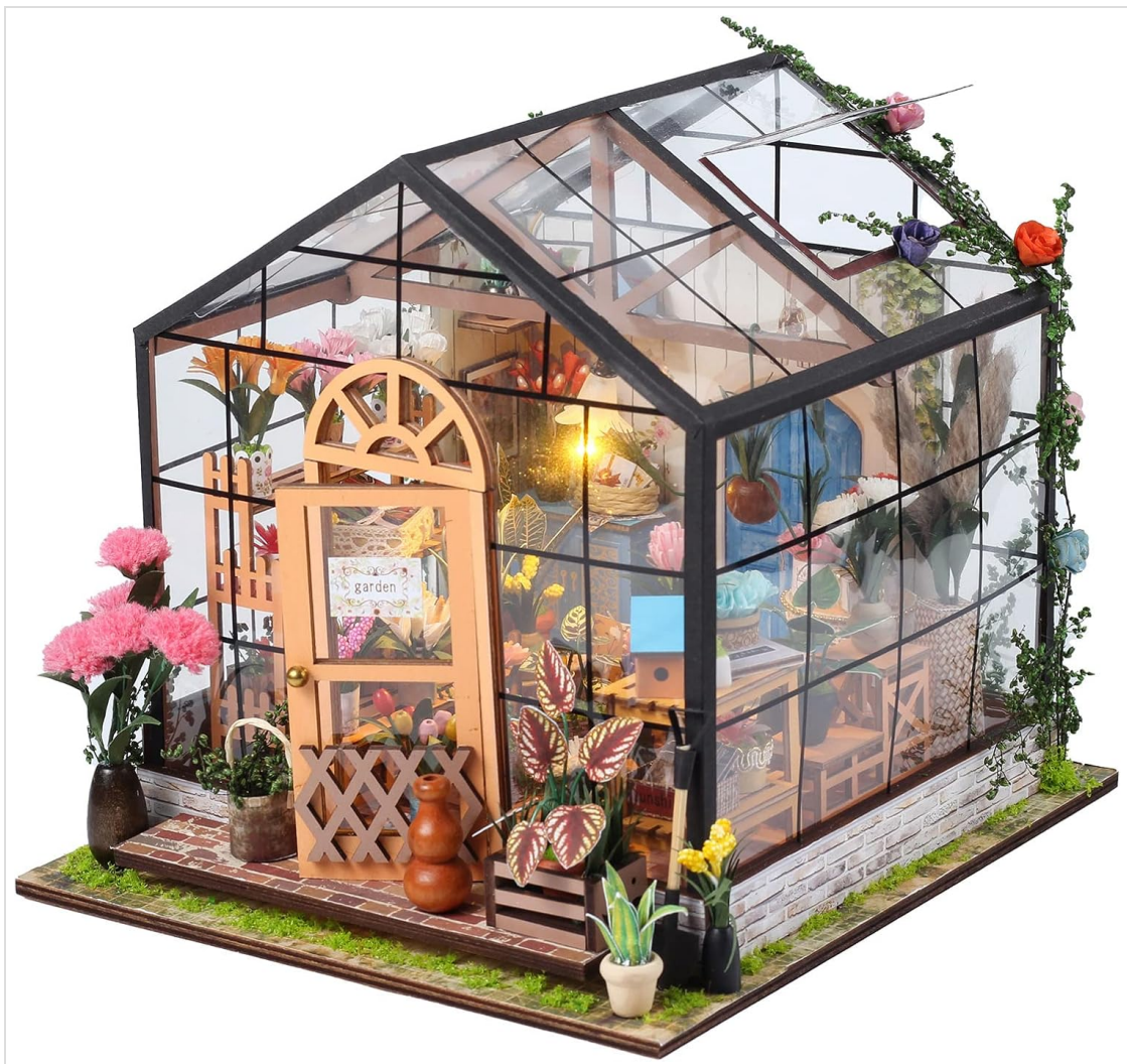
Image: The fully assembled miniature greenhouse, showing the base and overall structure.

Begin by assembling the base structure of the greenhouse. Identify the base plate and side panels. Secure them using glue as indicated in the manual's diagrams.