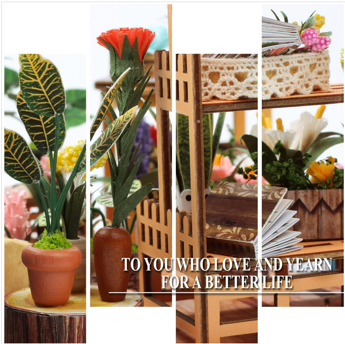
Image: A close-up shot focusing on miniature plants and a small wooden fence, illustrating the fine details of the kit.

Important: Building a DIY miniature dollhouse kit requires patience. Follow the instructions carefully and take your time to create a beautiful and unique miniature masterpiece.