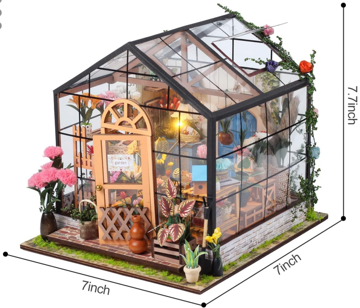
Image: A diagram illustrating the product dimensions of the assembled miniature greenhouse, measuring 7 x 7 x 7.7 inches.