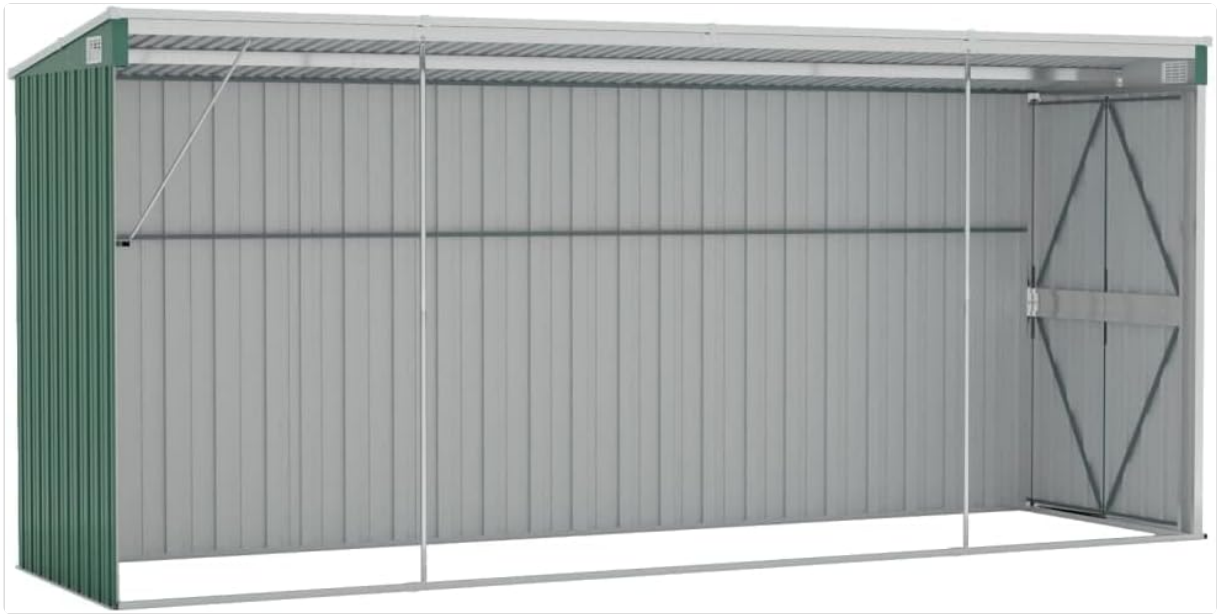
Image: Interior view of the shed, illustrating the structural framework and panel design. Refer to your packing list to identify all components.