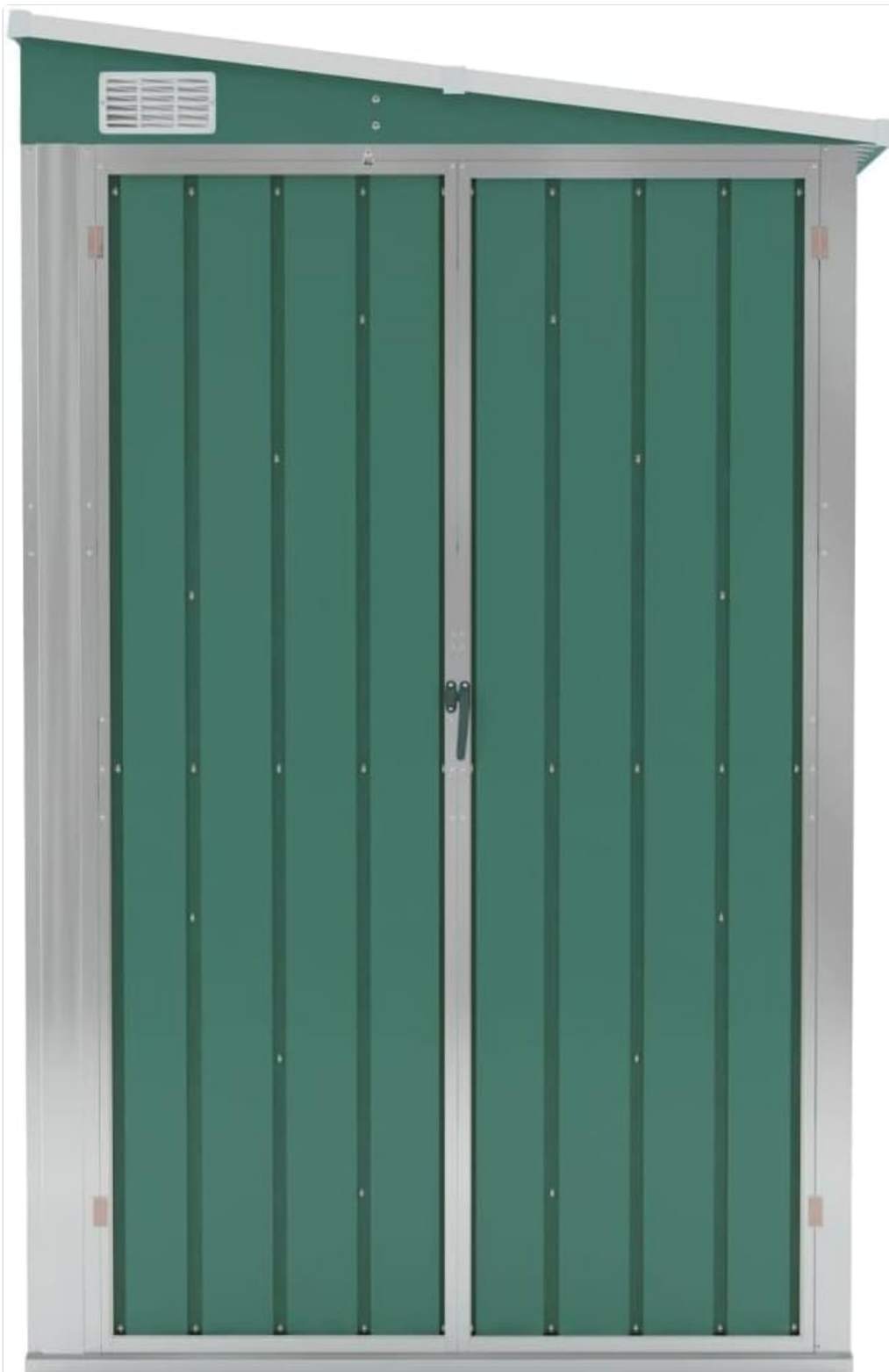
Image: Front view of the closed garden shed, showing the double doors and the location of the handle with its lock function.