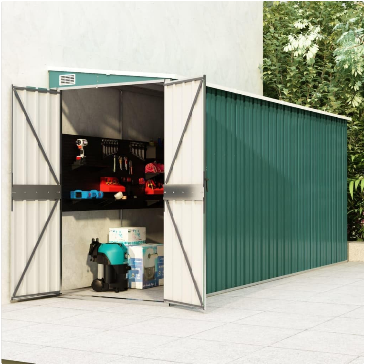
Image: The wall-mounted garden shed with its double doors open, demonstrating the interior storage capacity and how it integrates with a wall.