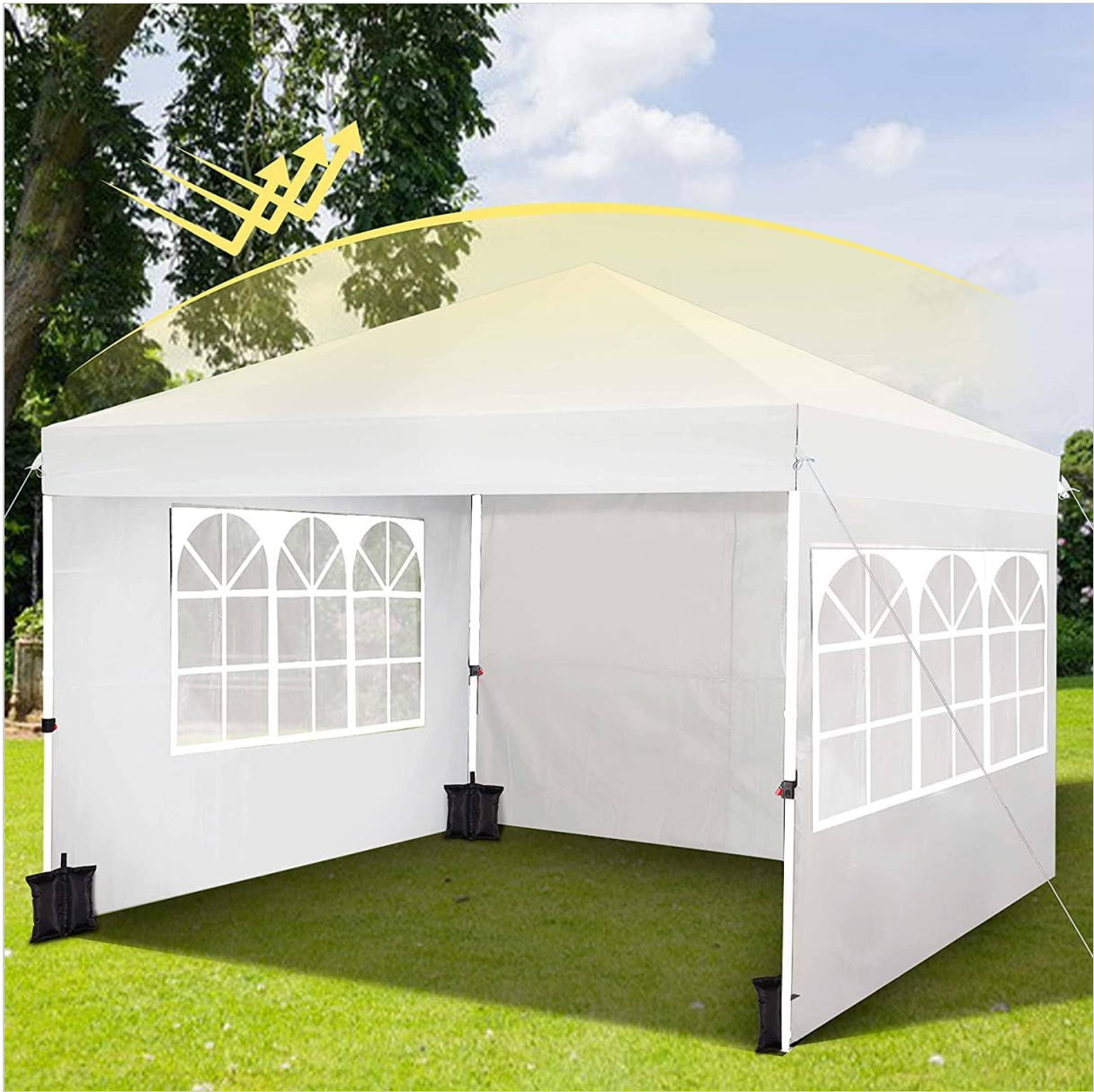
Image 2: Illustrative example of a canopy with side panels attached. Note: This product includes only the side panel fabric, not the full canopy structure shown.