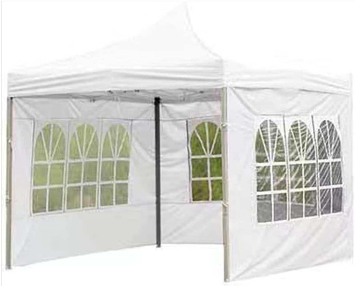
Image 1: Example of the canopy side panel with window design. This image illustrates the type of side panel included.