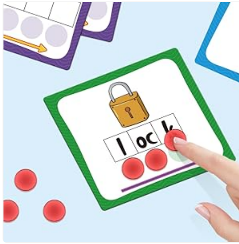
Image 3.2: Close-up of a hand demonstrating chip placement for phoneme segmentation.