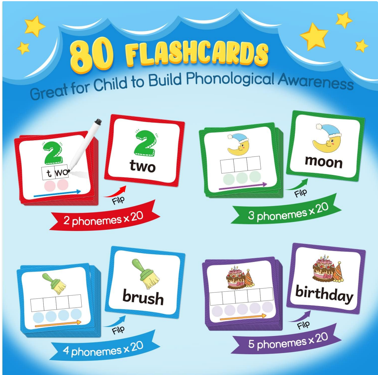
Image 3.5: Examples of flashcards across different phoneme levels.