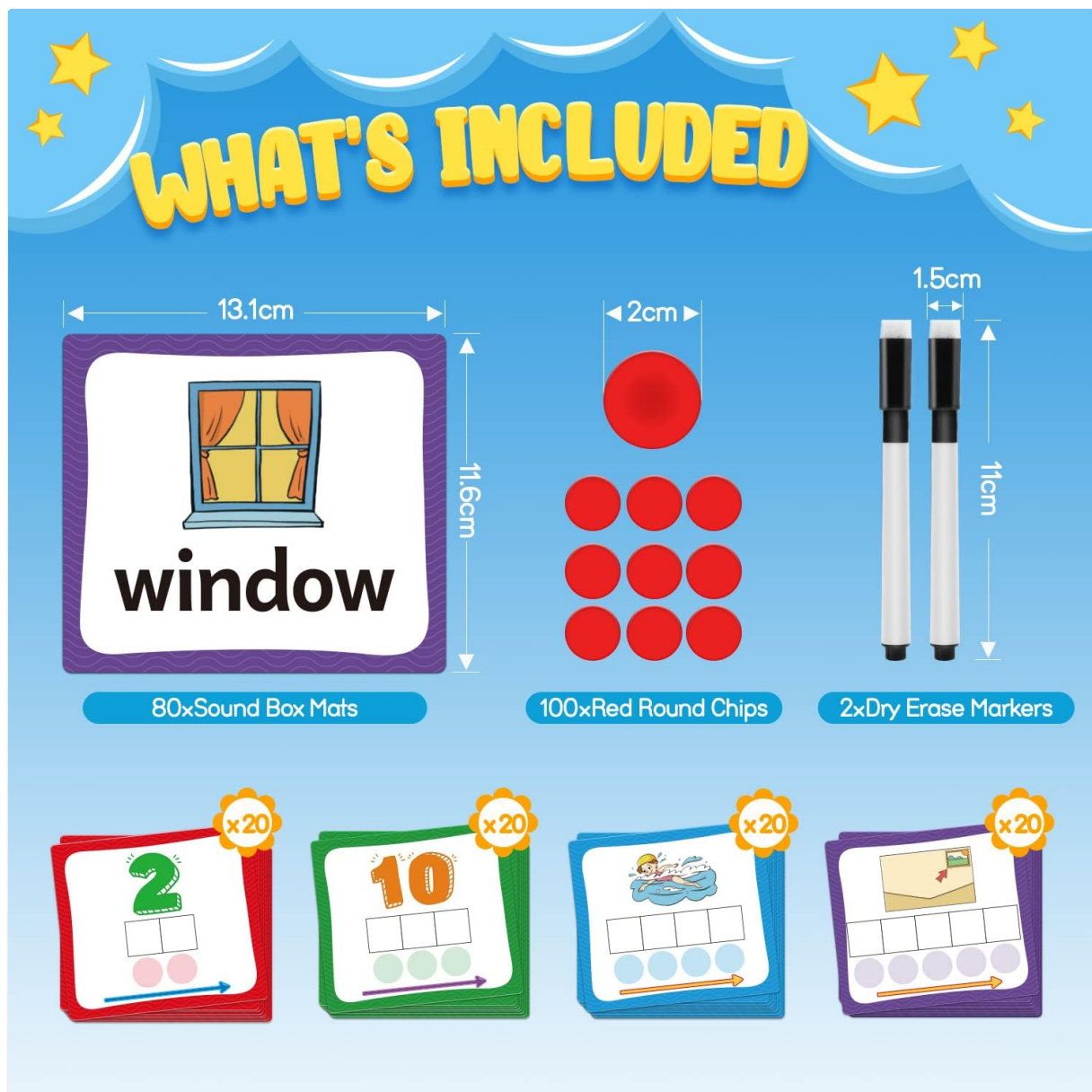
Image 1.2: Detailed illustration of the package contents and their quantities.