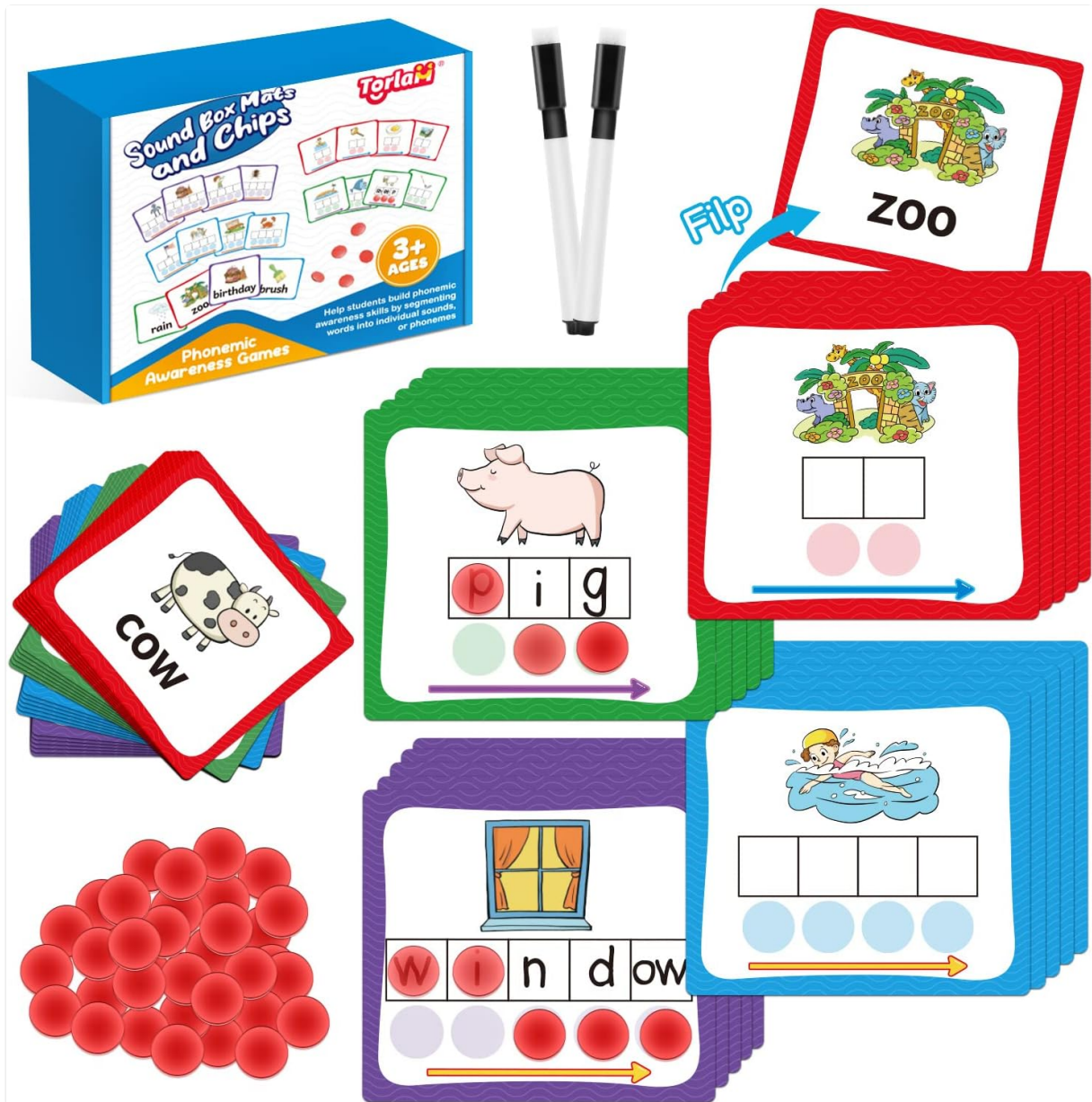
Image 1.1: Overview of the Torlam Elkonin Boxes Phonemic Awareness Phonics Games components.