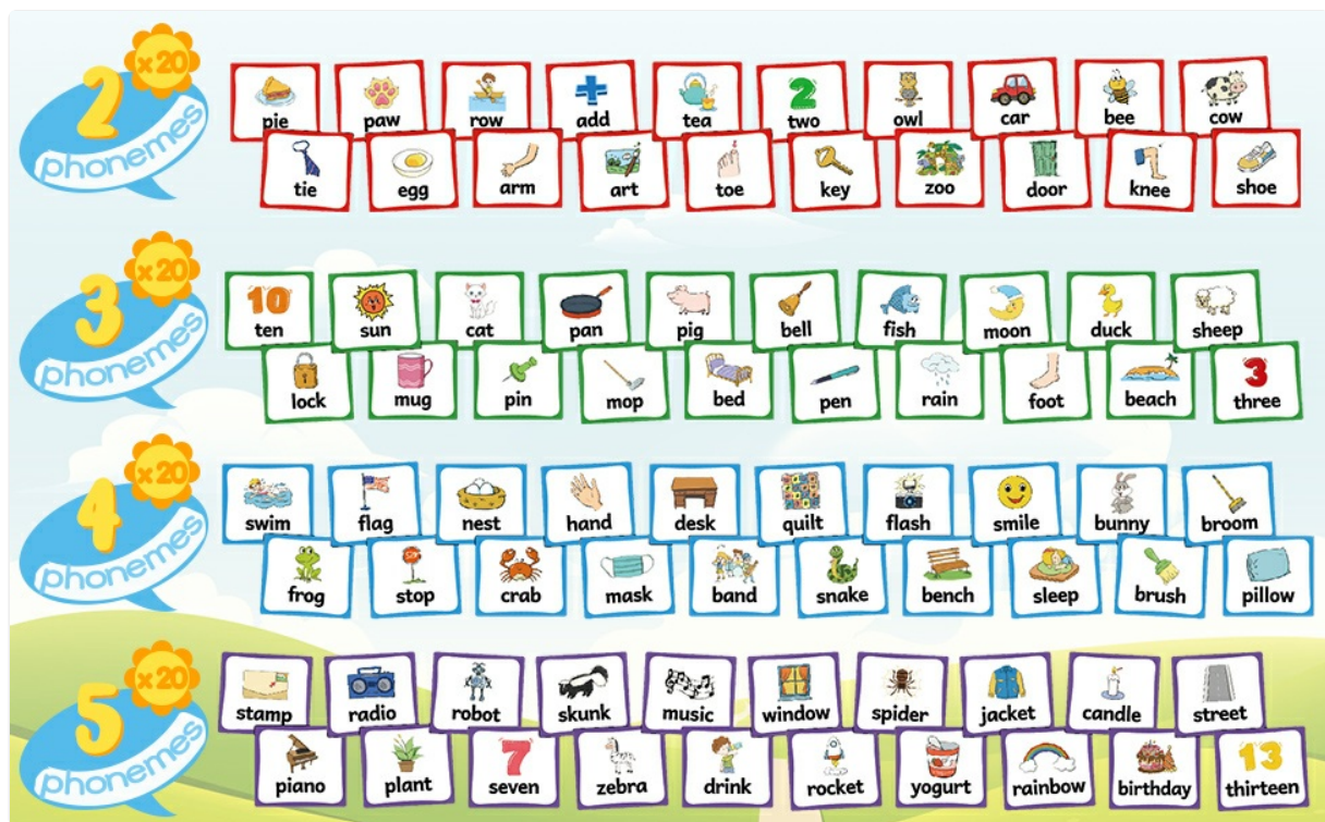
Image 3.6: Full list of words included, organized by phoneme count.