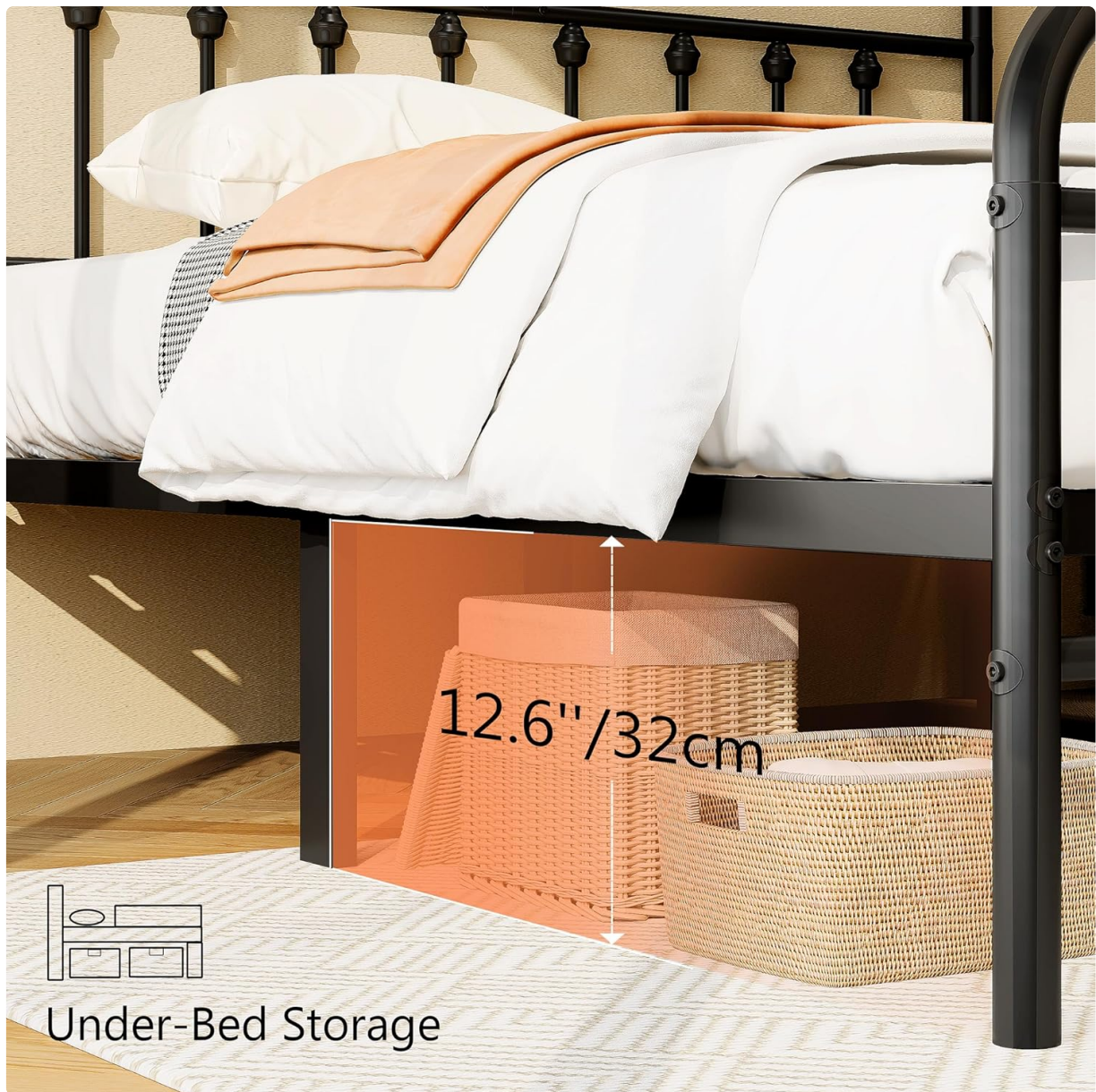
Image: The bed frame provides approximately 12.6 inches (32 cm) of under-bed clearance, ideal for storing boxes and other items.

The 14-inch height of the frame creates ample under-bed storage space, which is also easy to clean. The upgraded mesh steel structure is designed to maximize contact with the mattress, contributing to noise reduction.