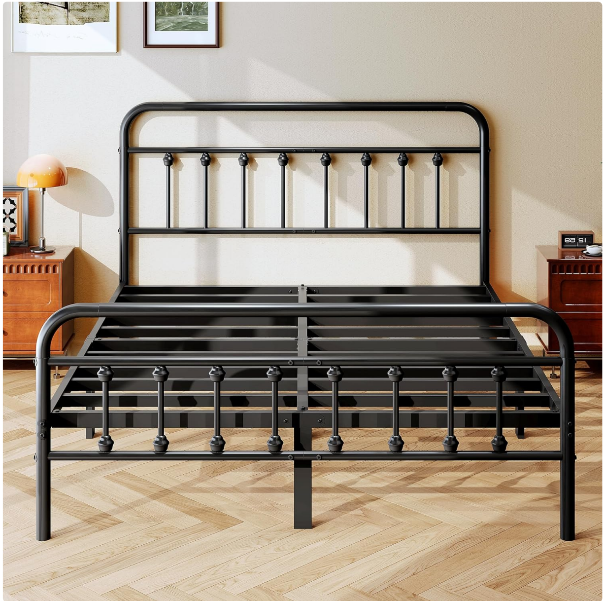
Image: The zunatu King Size Metal Platform Bed Frame fully assembled, without a mattress, highlighting its robust metal structure and Victorian design elements.