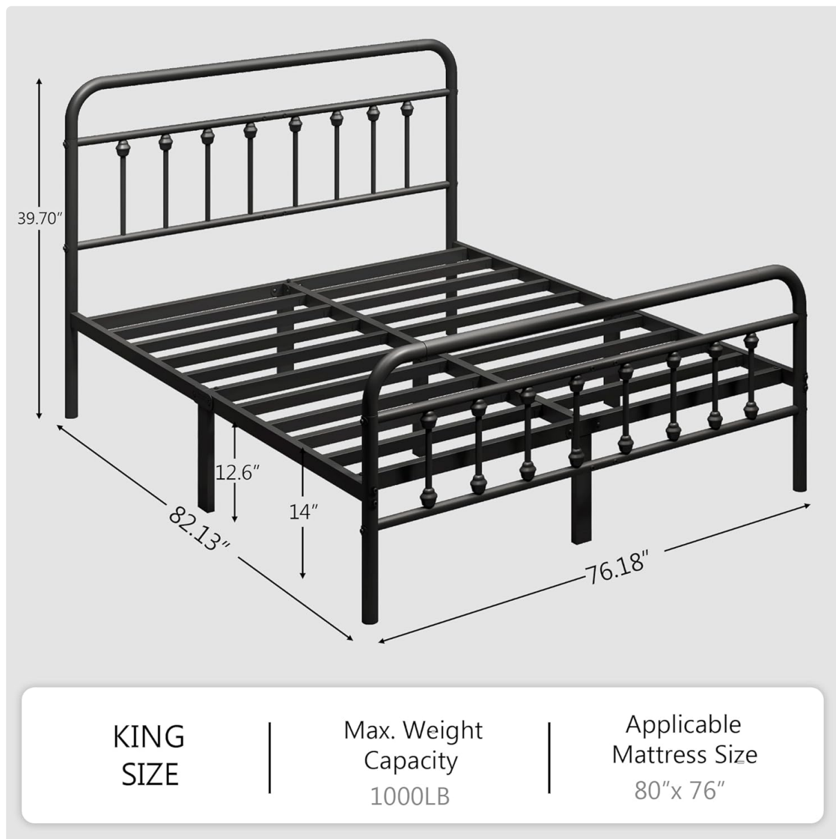
Image: Detailed dimensions and weight capacity for the King Size bed frame.