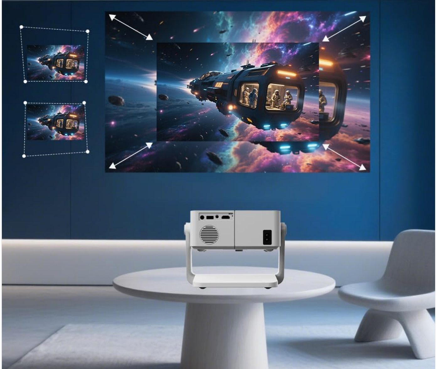
Figure 5.2: Visual representation of auto keystone correction and electric focus adjusting the projected image.