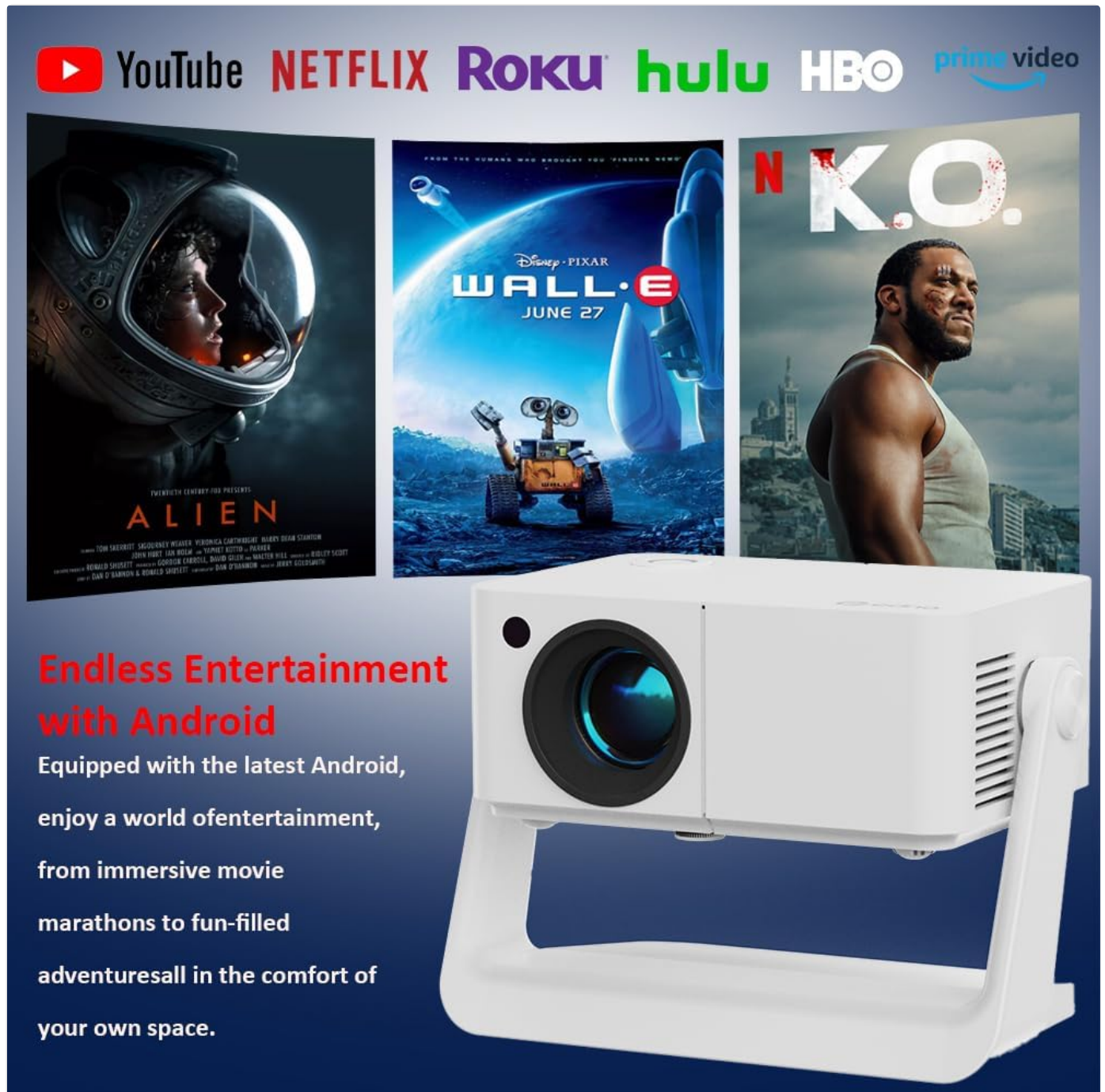
Figure 5.1: The projector's built-in stand allows for 360° rotation, enabling projection onto ceilings, walls, or floors.

The H69 projector features a built-in 360° adjustable stand, auto keystone correction, and electric focus for flexible setup.