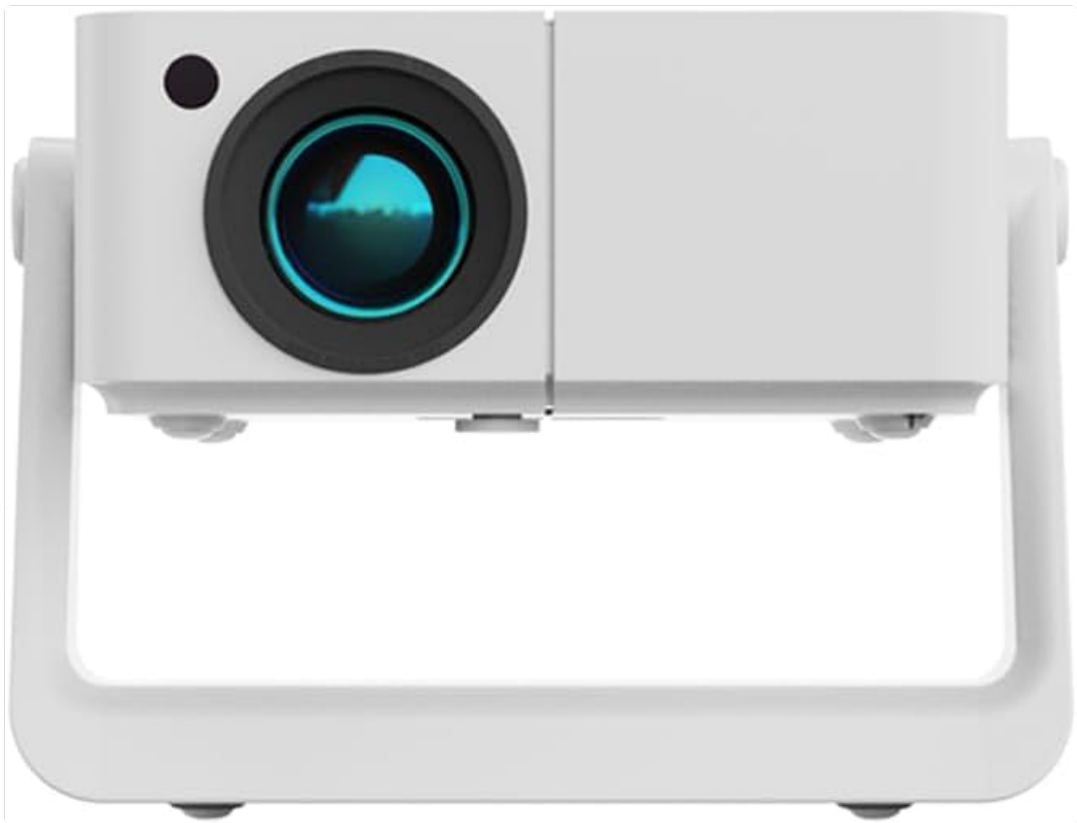
Figure 4.1: Front view of the PONER SAUND H69 Projector, showing the lens and sensor.