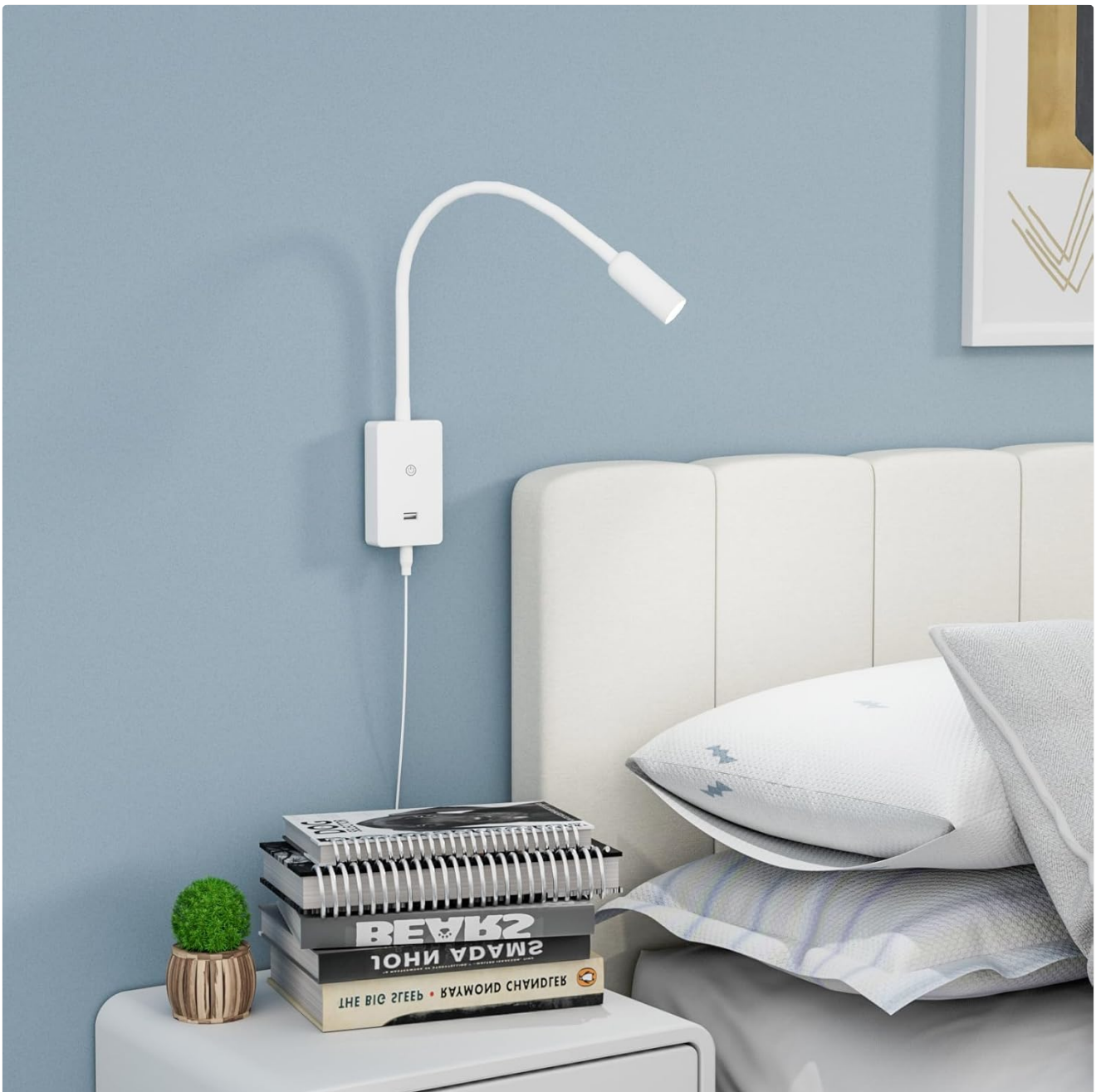
Image: The ENUOTEK LED Wall Mounted Reading Light installed above a bed, providing focused light for reading.