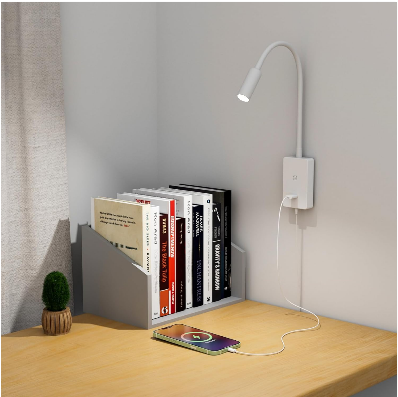
Image: The ENUOTEK LED Wall Mounted Reading Light installed above a desk, with a smartphone connected to and charging from the lamp's integrated USB port.