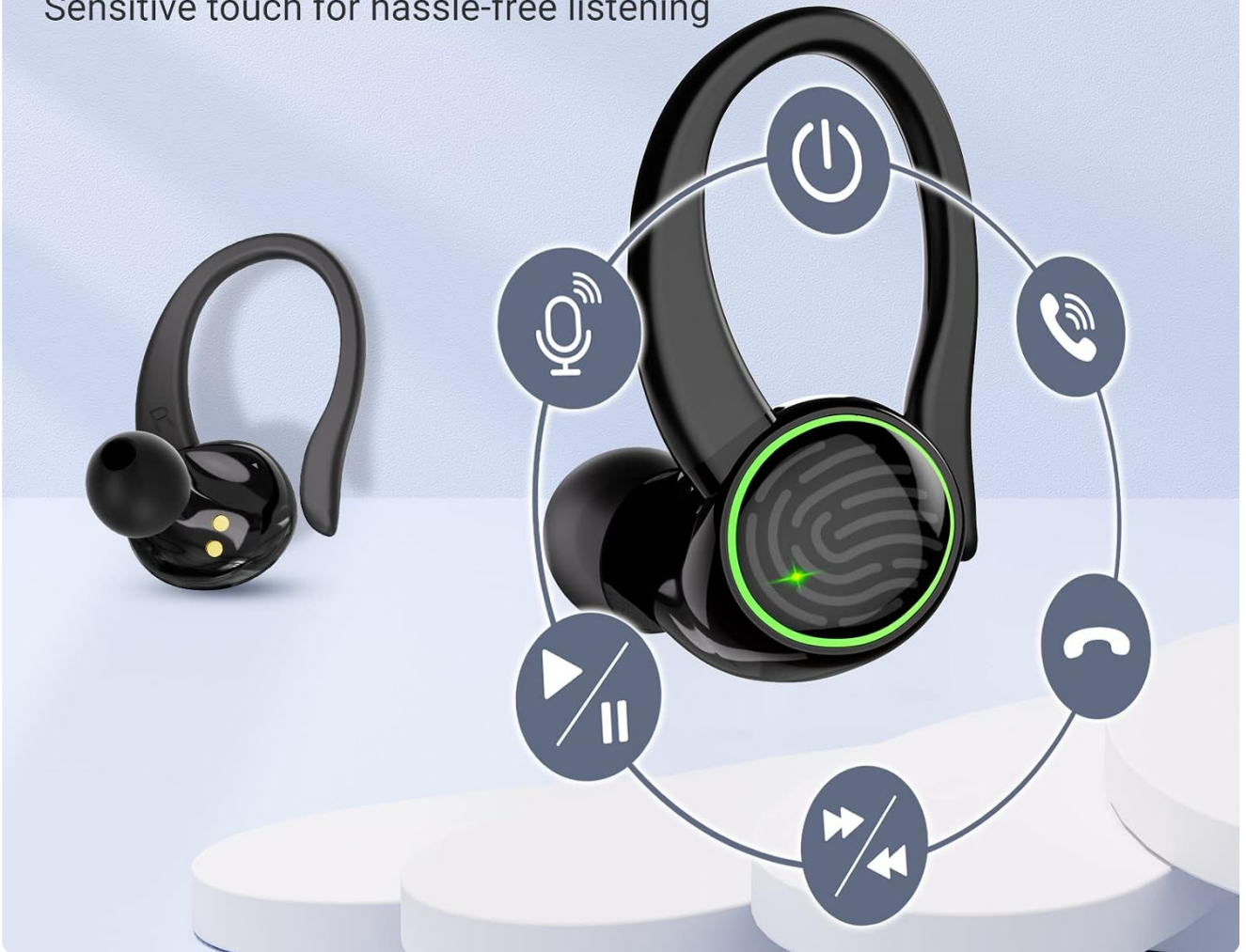
Image: Smart Touch Control. An illustration showing the various touch control functions on the earbud, including power, call management, music playback, and voice assistant activation.

Sensitive touch for hassle-free listening