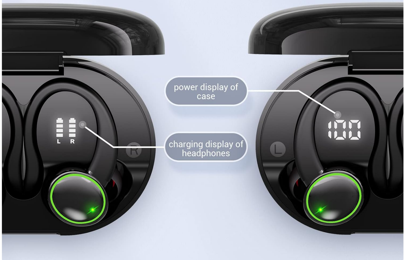
Image: Dual LED Power Display. This image highlights the digital LED display on the charging case, showing separate battery indicators for the case and each earbud (L and R).

Simple and clear knowing the remaining battery power of the earbuds