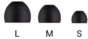
Image: Secure & Comfortable Fit. This image demonstrates the ergonomic design, flexible earhook, and the three included eartip sizes (S, M, L) for a customized and secure fit.