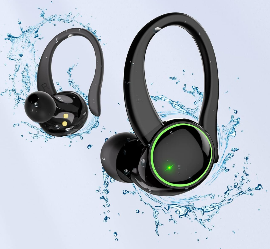
Image: IP7 Water & Sweat Resistant. The image shows the headphones being splashed with water, illustrating their IP7 waterproof rating suitable for workouts.

Water won't ruin your workout with IP7 waterproof