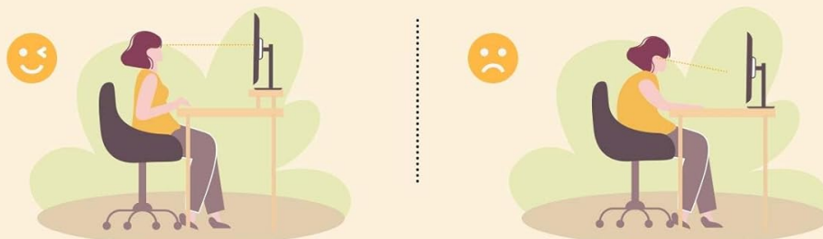
Image: An illustration demonstrating the ergonomic benefits of the monitor stand, promoting proper posture and reducing neck strain.

Make your screen and your eyes level, to ensure that the cervical spine is not sore