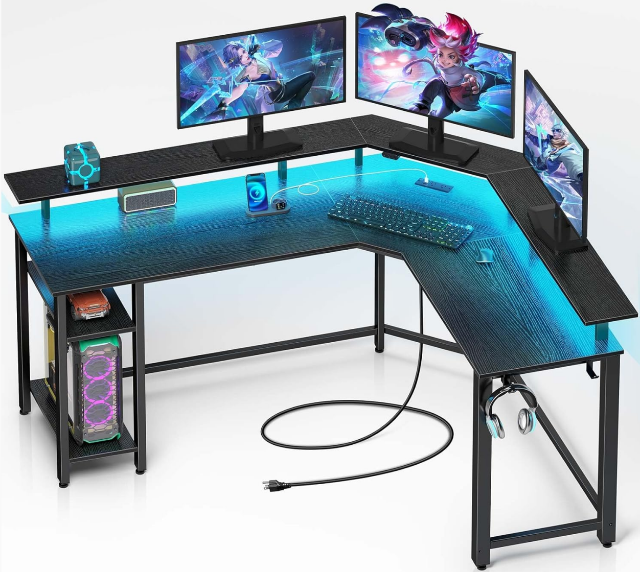
Image: The Rolanstar L Shaped Gaming Desk, showcasing its spacious design with multiple monitors, LED lighting, and integrated power solutions.