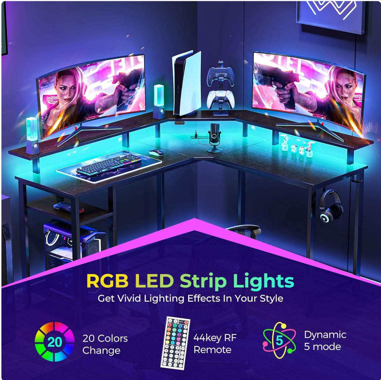
Image: Visual representation of the RGB LED strip lights, showcasing the 20 color options, 5 dynamic modes, and the 44-key remote control for customization.