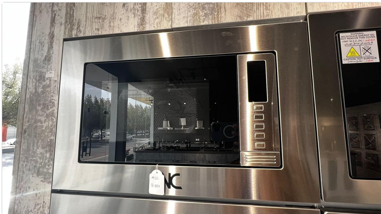
Image: Front view of the NC Microwave MEG50K with the door closed, showcasing its stainless steel finish and control panel.