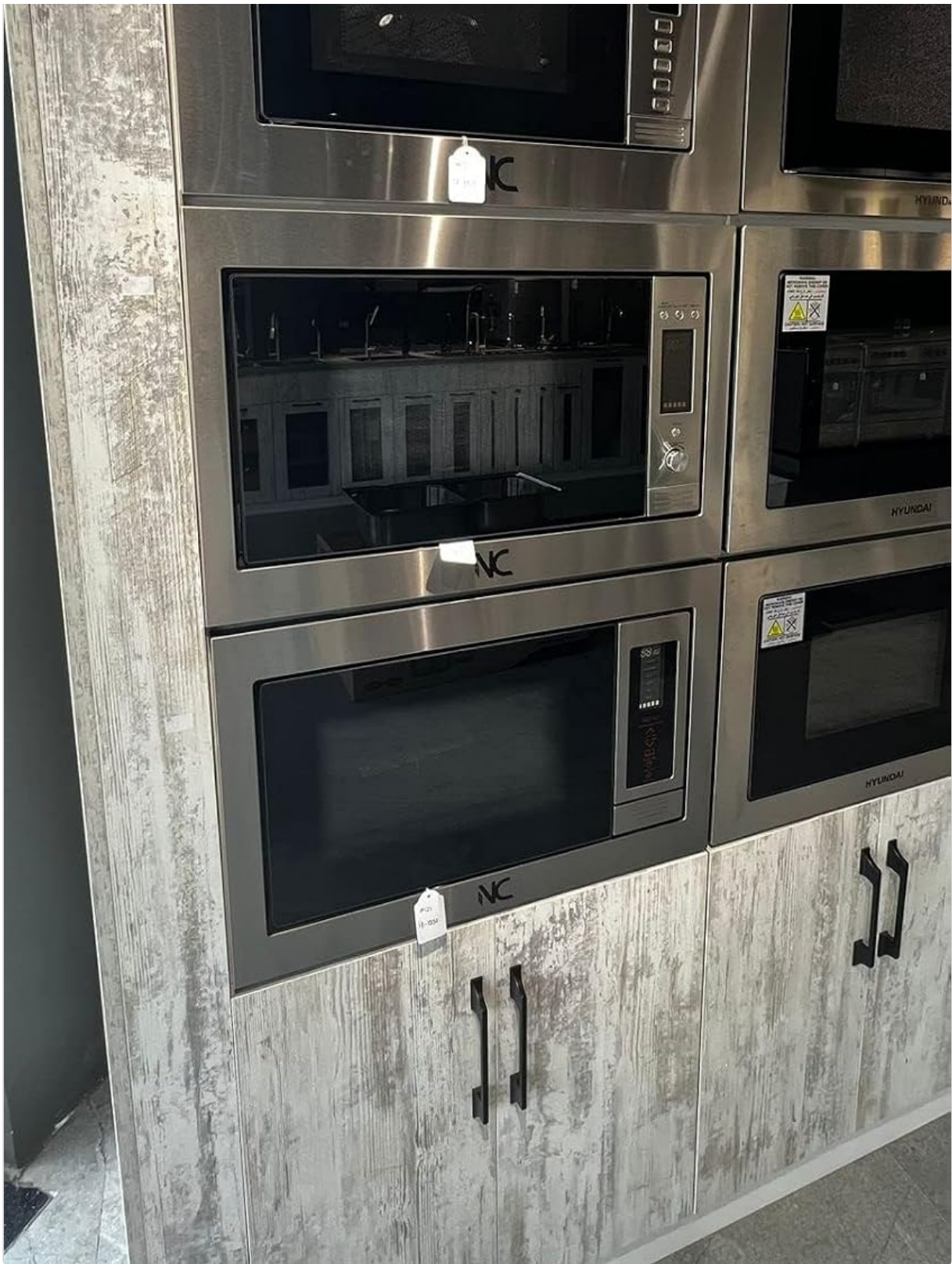
Image: The NC Microwave MEG50K positioned within a kitchen cabinet opening, demonstrating a typical installation scenario.