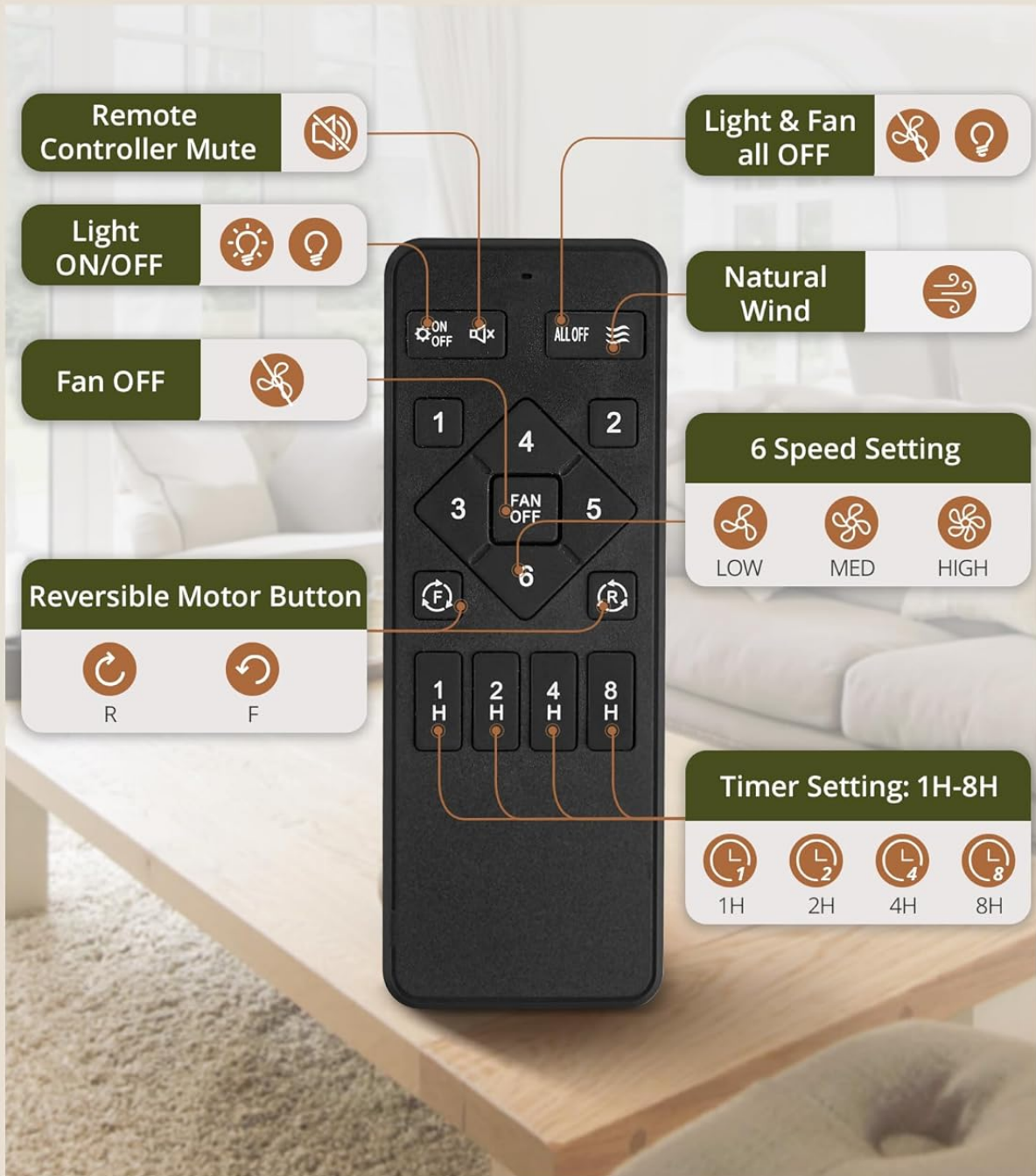
Image: Layout of the remote control with labeled buttons for various functions.