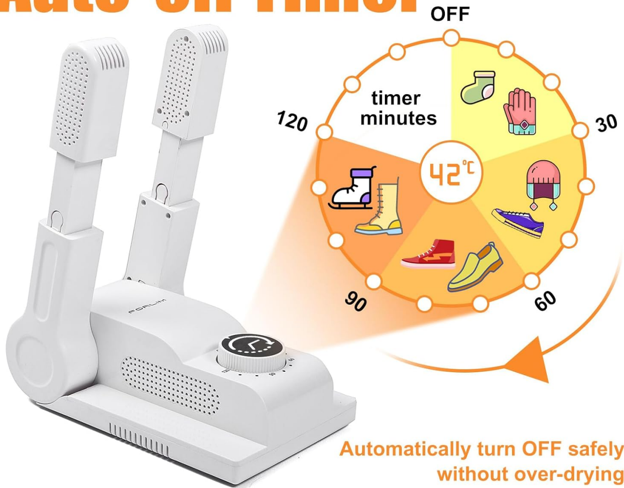
Image: The control panel of the FORLIM Boot Dryer, showing the timer dial with settings from 30 to 120 minutes for automatic shut-off.

Your browser does not support the video tag.