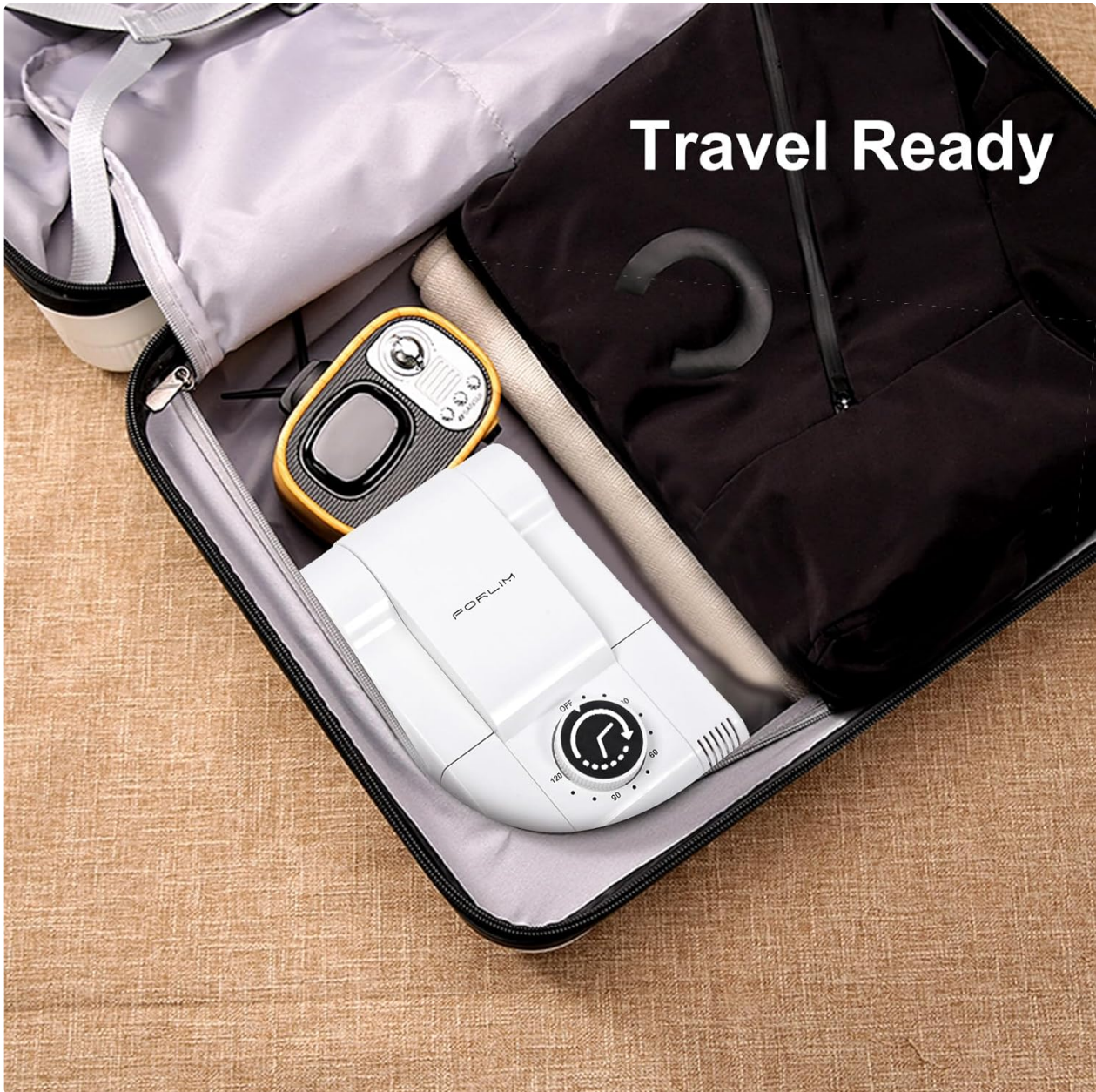
Image: The FORLIM Boot Dryer shown in its compact, folded state, ideal for storage or travel.