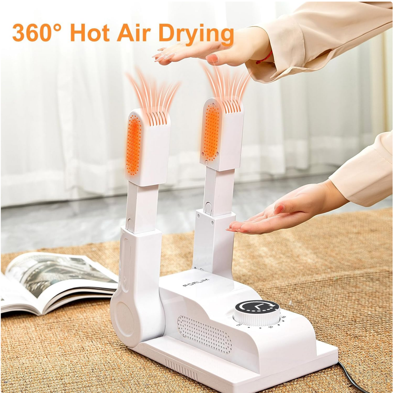
Image: The FORLIM Boot Dryer in operation, drying a pair of boots with warm air circulating through the ports.