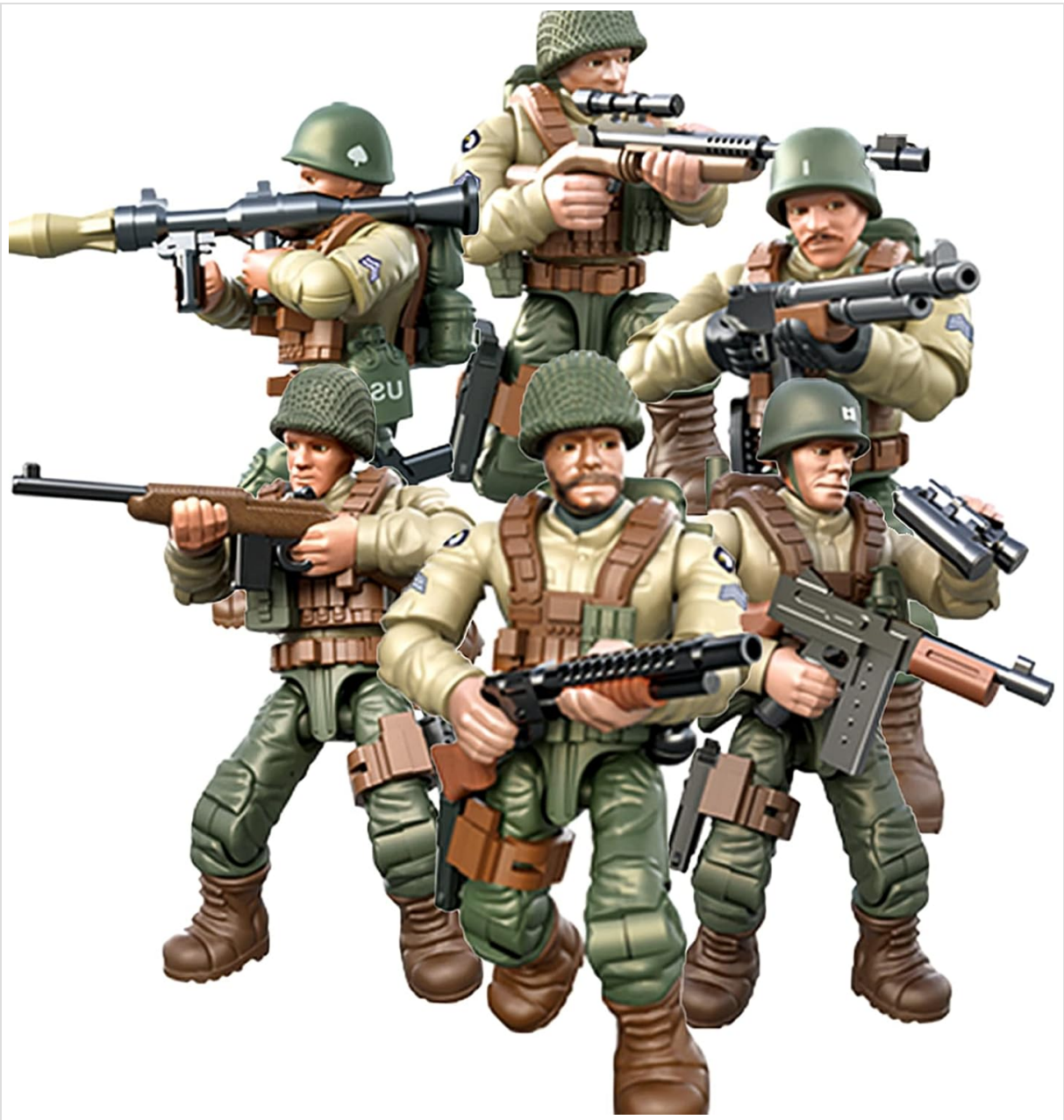
Image 2.1: The complete set of six MEIEST Mini WWII US Army Soldier figures, fully assembled and equipped.