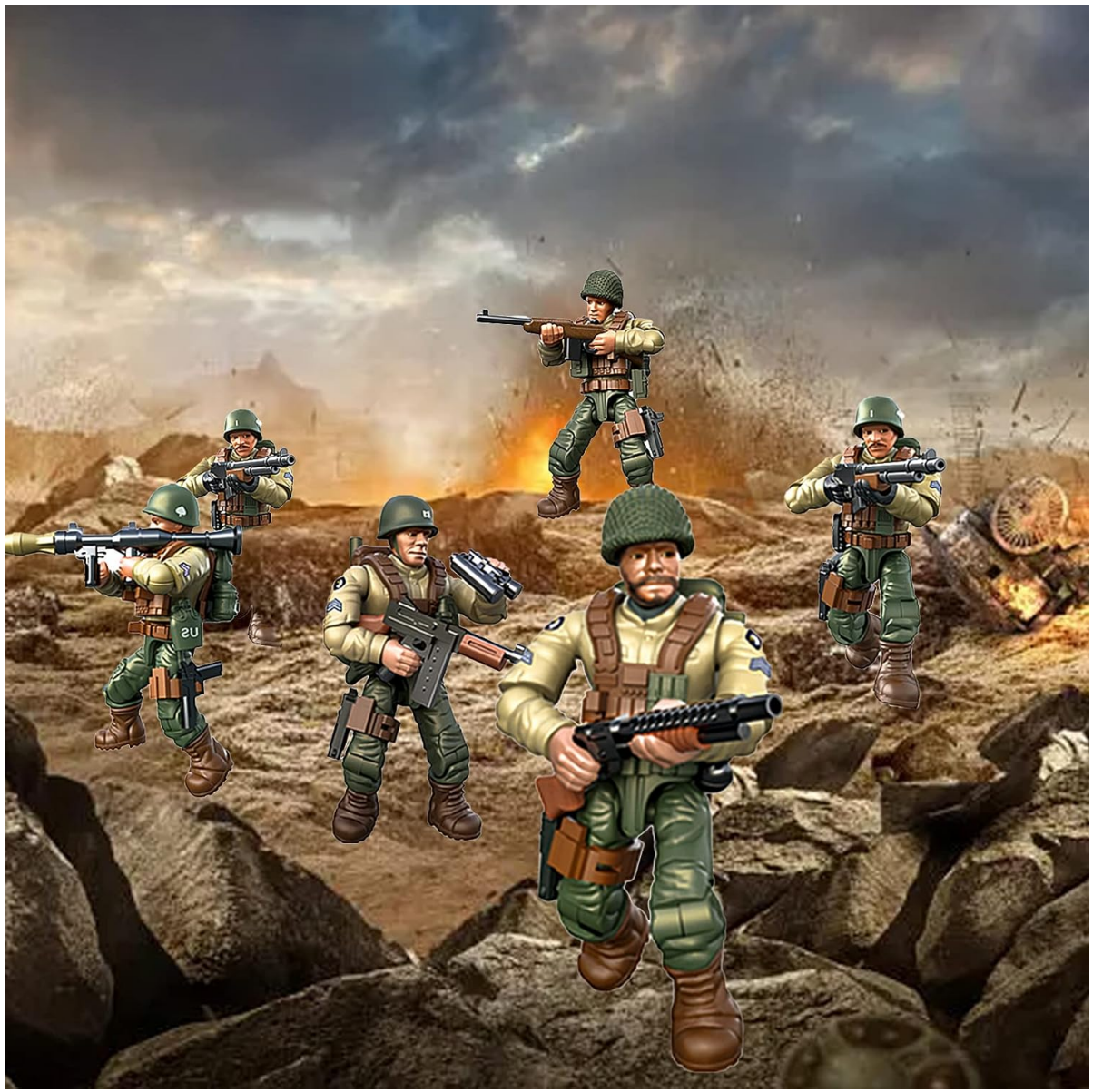
Image 4.2: An example of the figures arranged in a dynamic display, showcasing their potential for creating detailed scenes.