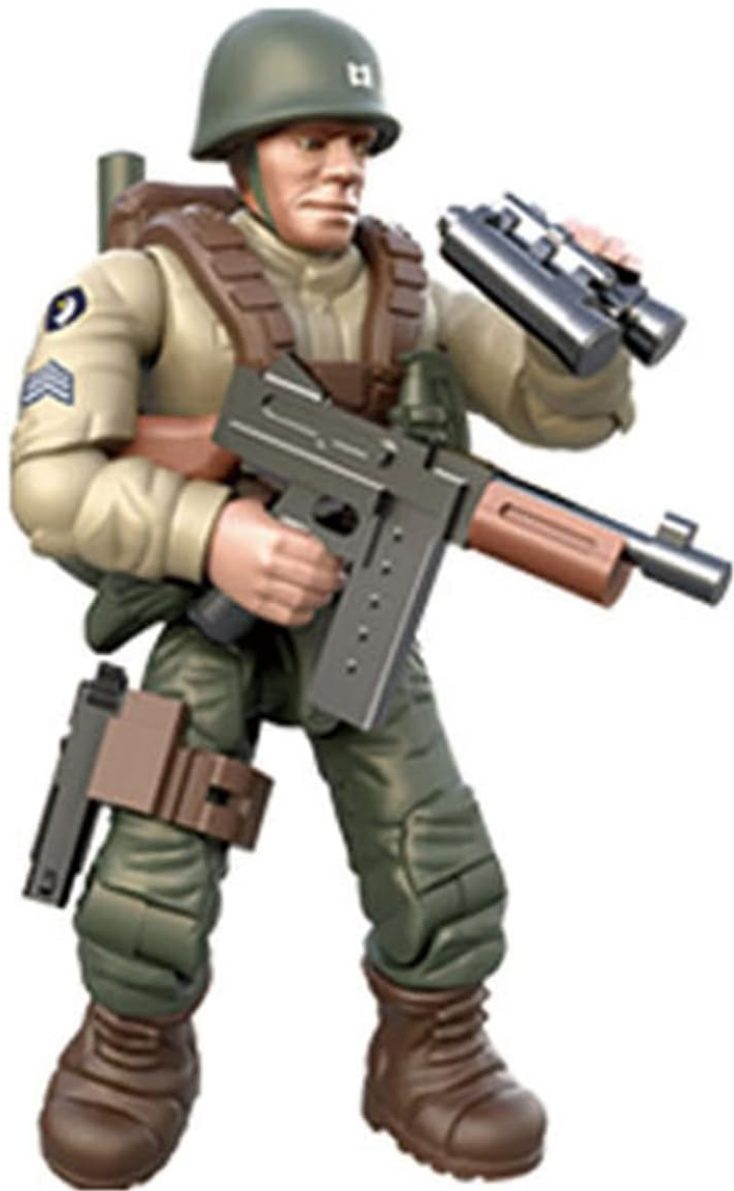
Image 2.2: A detailed view of a single soldier figure, illustrating its approximate height of 5.8 cm.