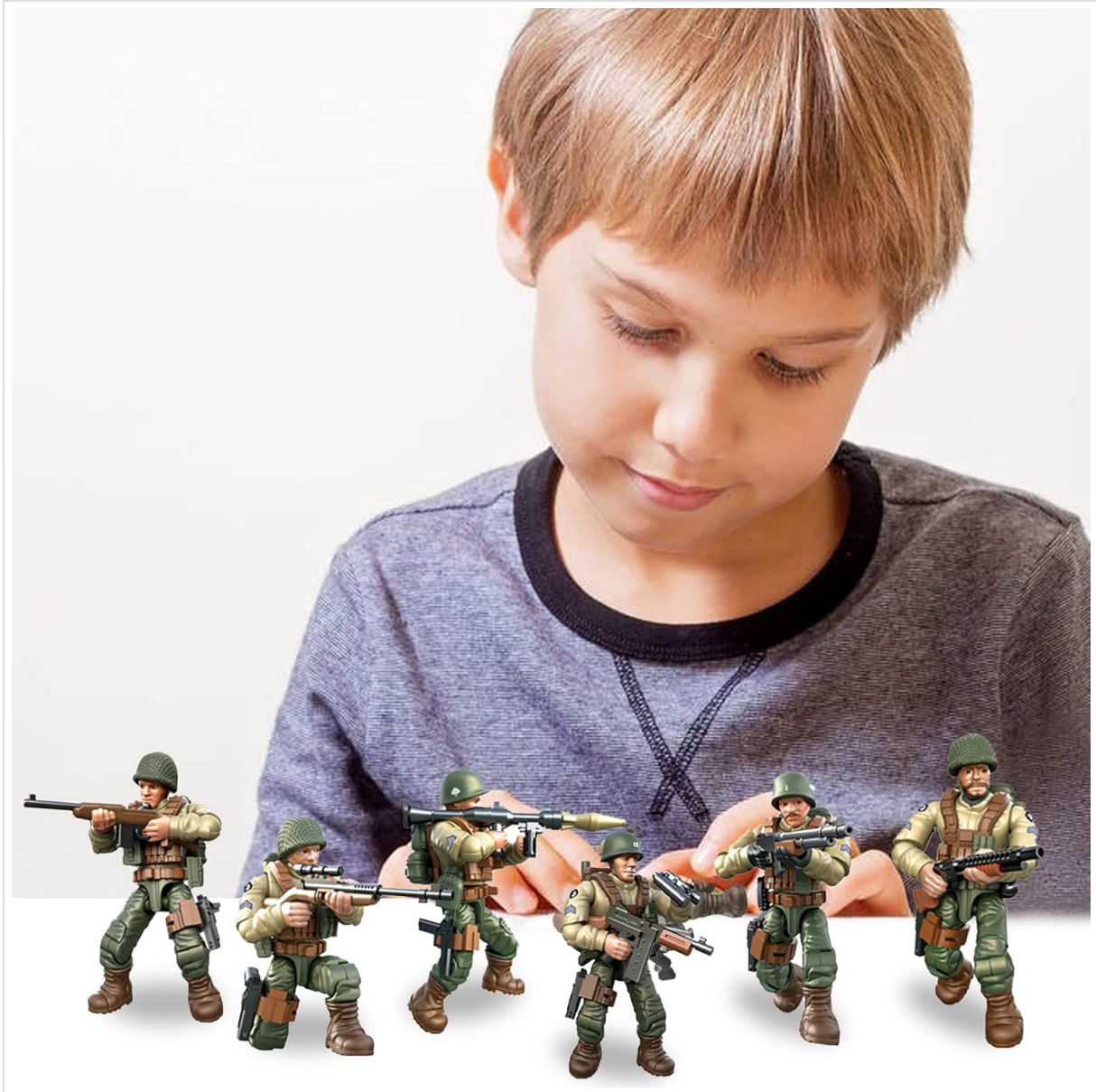
Image 4.1: A child engaging with the assembled soldier figures, demonstrating their use in imaginative play.