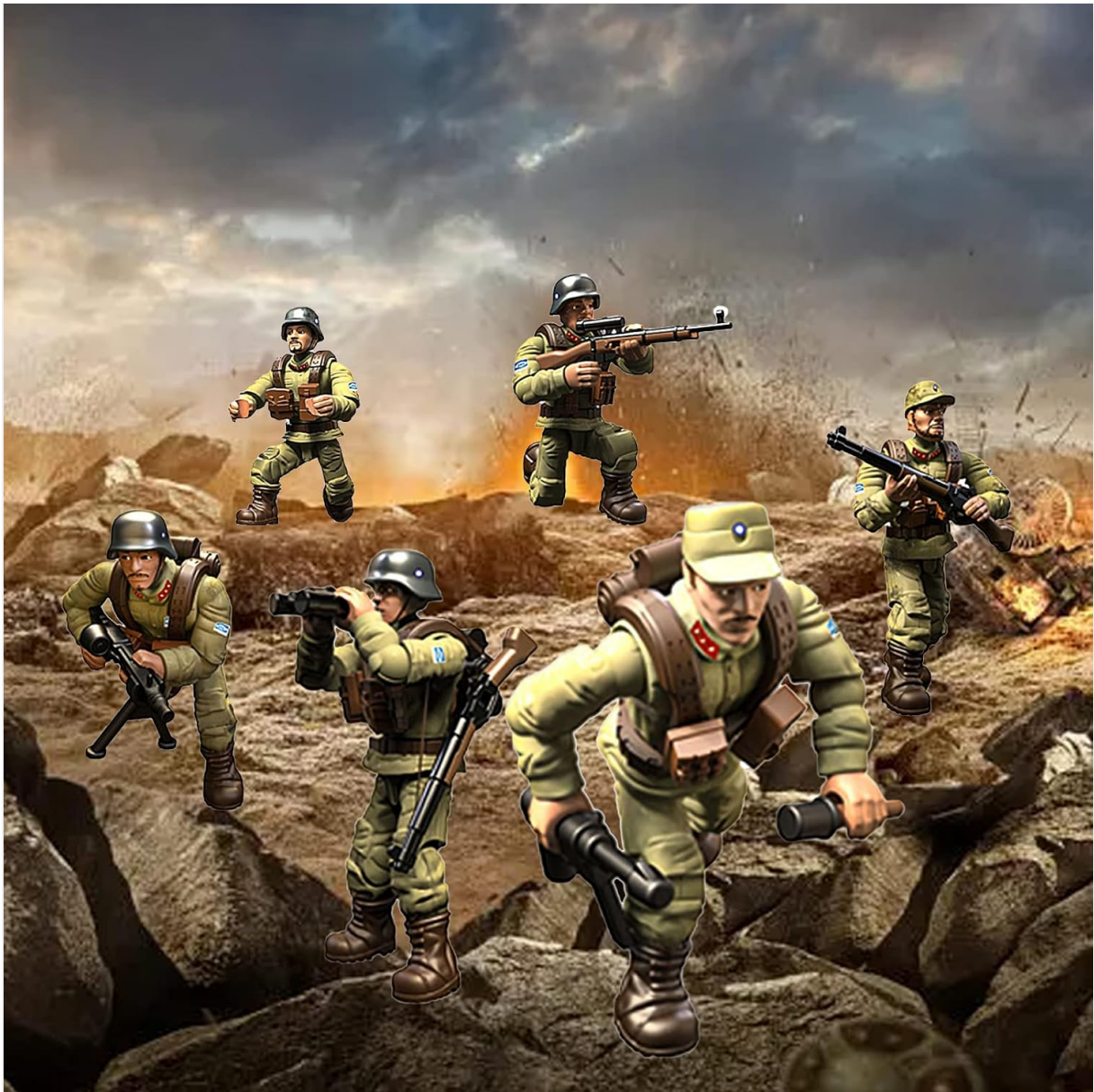
Figure 4: Example of assembled figures posed in a dynamic scene, demonstrating their usage for play or display.