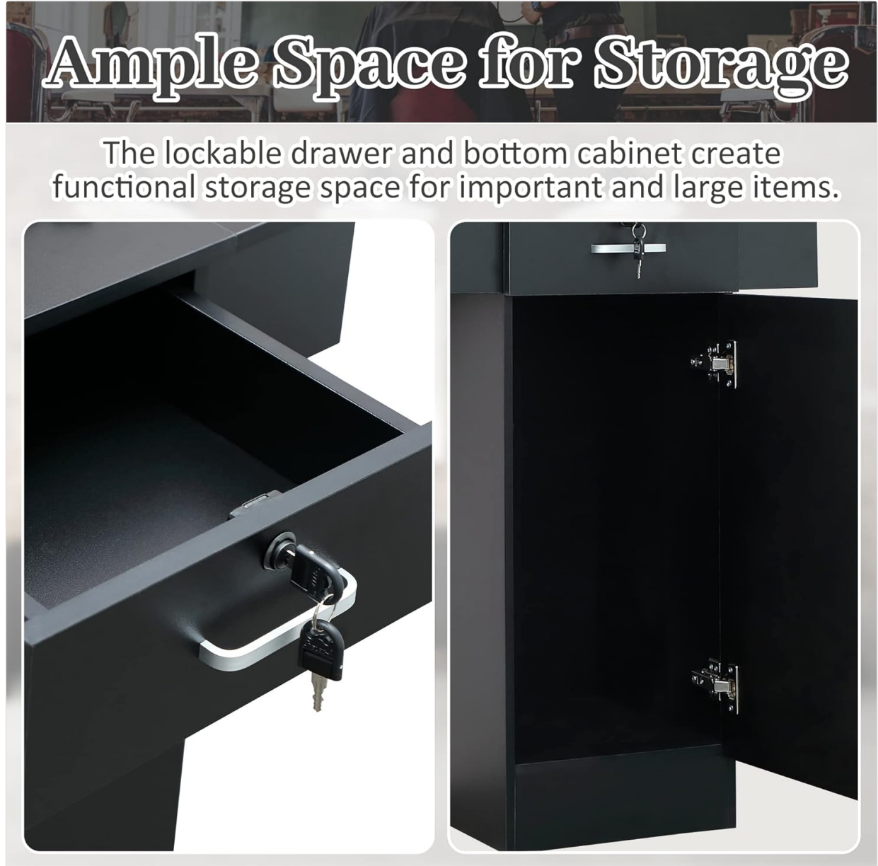
Figure 3: The lockable drawer and spacious lower cabinet provide secure and organized storage for various salon essentials.