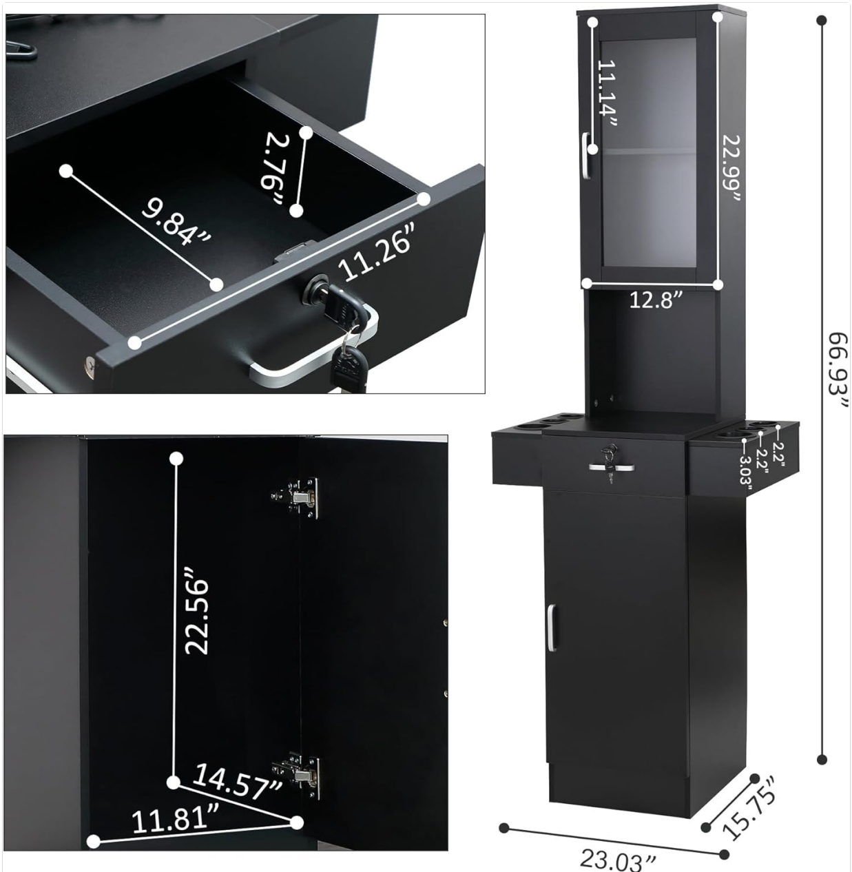
Figure 1: Detailed view of the salon station's drawer, cabinet, and overall dimensions. This image shows the dimensions of the drawer (9.84" x 11.26" x 2.76"), the upper cabinet (12.8" x 11.14" x 22.99"), and the lower cabinet (11.81" x 14.57" x 22.56"), along with the overall station dimensions (23.03"W x 15.75"D x 66.93"H).