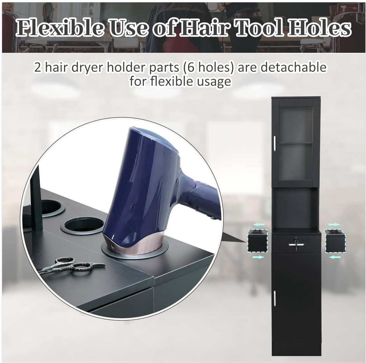
Figure 2: Close-up view of the heat-resistant tool holders integrated into the tabletop, designed for various hair styling tools like hairdryers and curling irons.

Video 1: Detailed assembly instructions for the RESHABLE Salon Station. This video demonstrates each step of the assembly process, from preparing components to final installation, including attaching drawer slides, assembling cabinets, and installing the glass door.