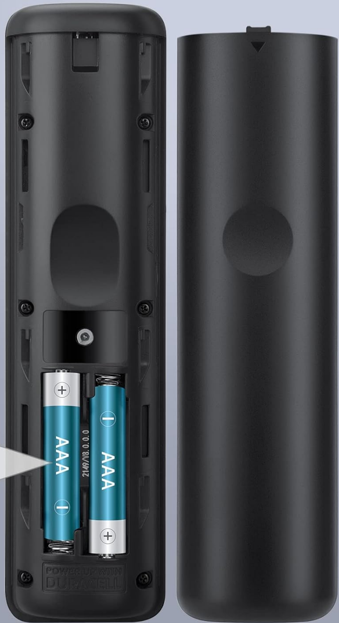
Image: The rear view of the Angrox XRT260 remote control with the battery cover removed, clearly indicating the slots for two AAA batteries. Text states "Requires 2* AAA Batteries (Batteries are not included)".