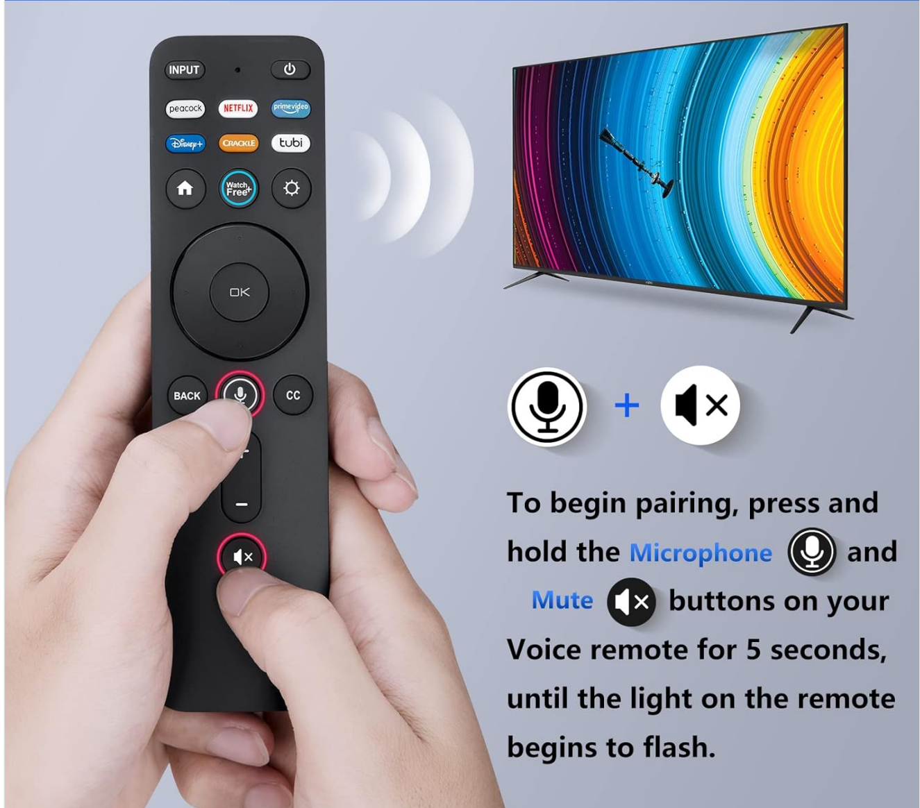
Image: A visual guide demonstrating the pairing process for the Angrox XRT260 remote. A hand is shown pressing both the Microphone and Mute buttons simultaneously, with an arrow indicating the signal being sent to a Vizio TV. Text explains to press and hold these buttons for 5 seconds until the remote's light flashes.