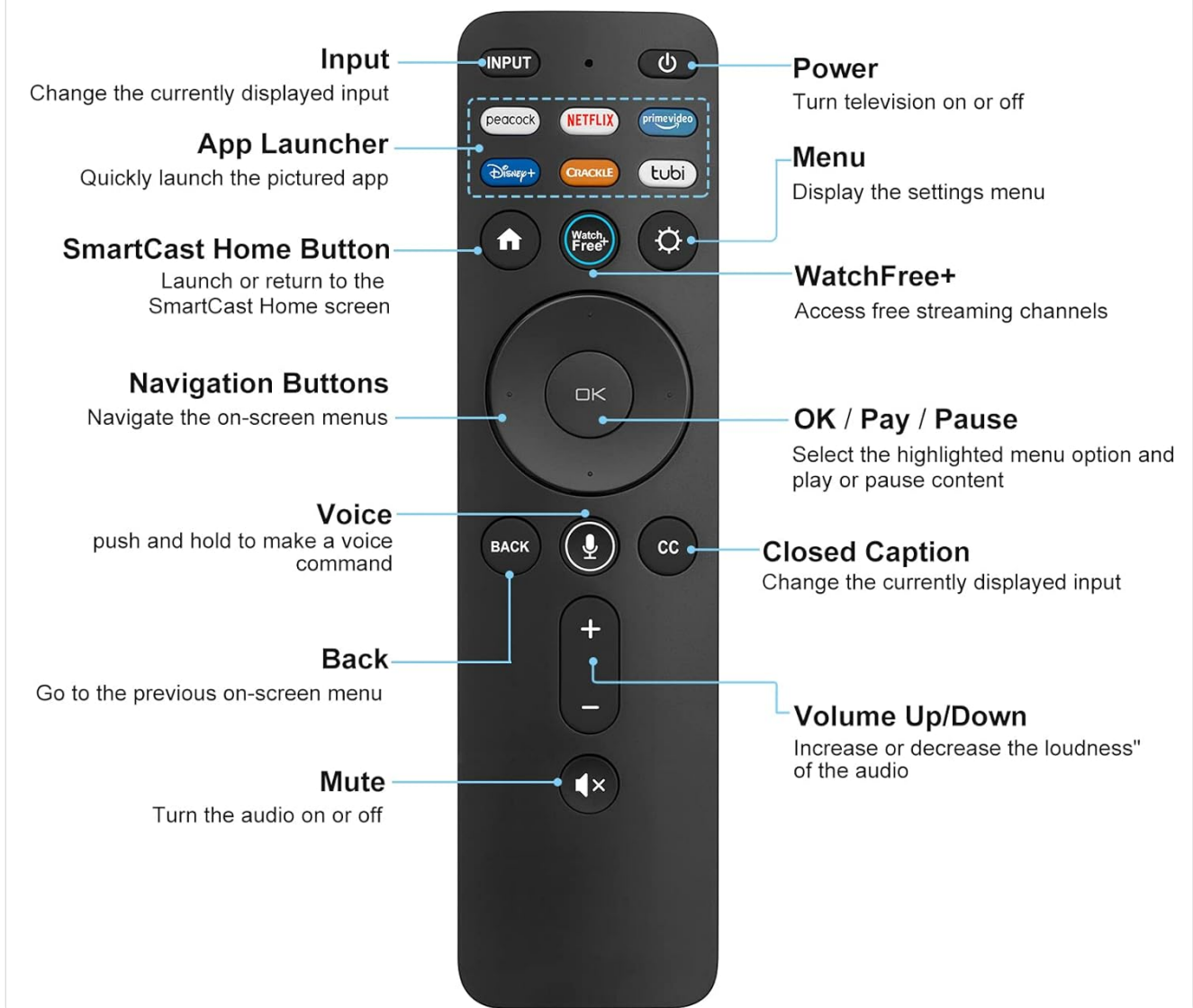
Image: A detailed view of the Angrox XRT260 remote control, with callouts pointing to and describing the function of each button, including Input, Power, Menu, App Launcher, SmartCast Home, WatchFree+, Navigation, OK/Pay/Pause, Voice, Closed Caption, Back, Volume Up/Down, and Mute.