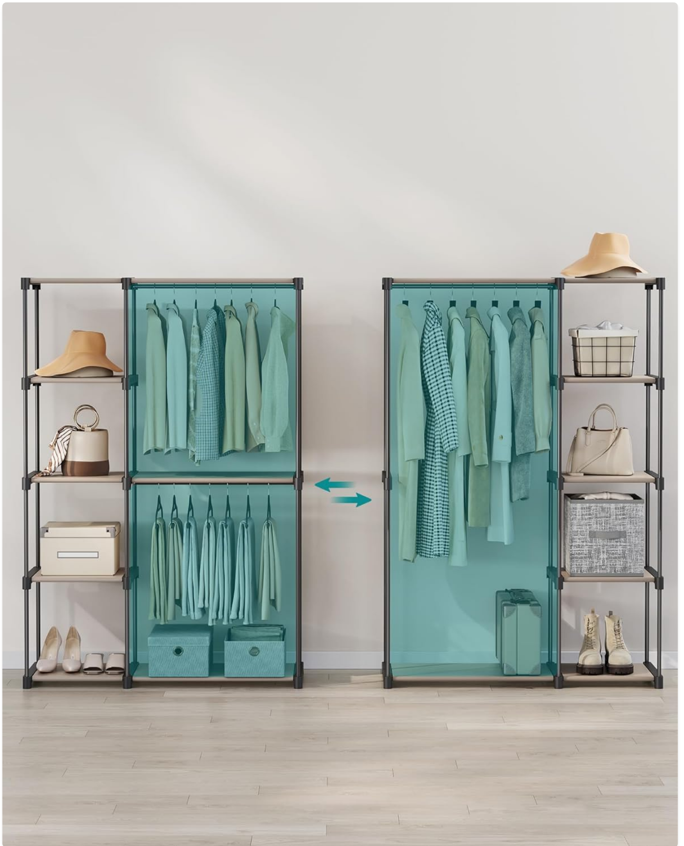
Image 5.2: Demonstrating the modularity and adjustable hanging space.